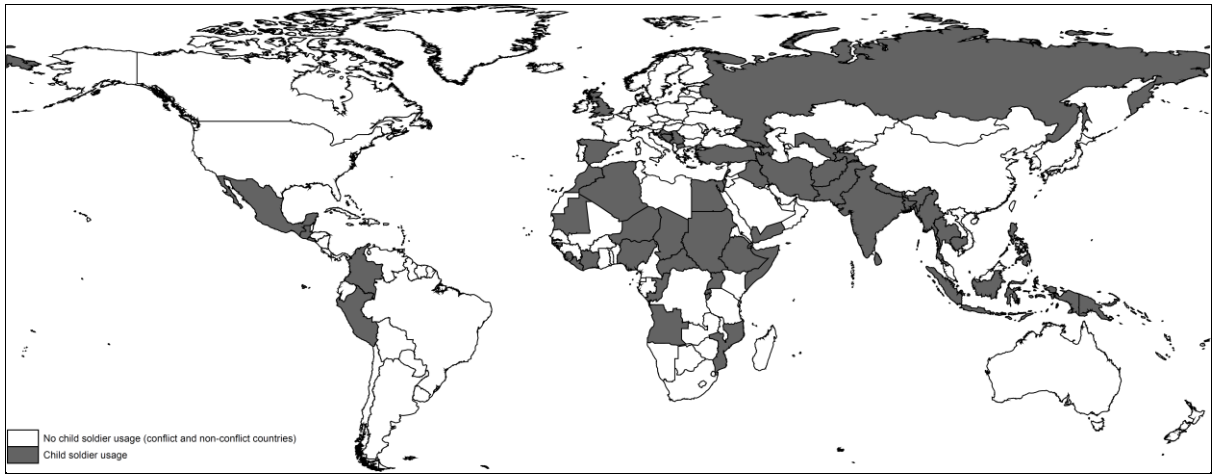
Figure 1. The Usage of Child Soldiers Worldwide, 1989-2010

Note: Shaded countries signify states in which at least one rebel group used child soldiers during conflict. White marked countries are non-conflict states or rebel groups without child soldiers operated.