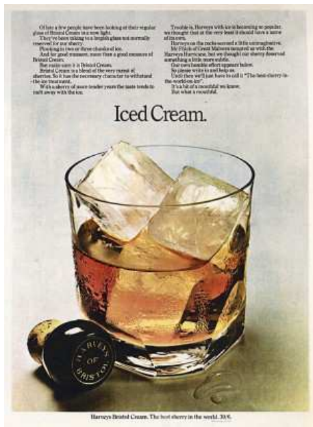
Figure 4: CDP for Harvey's