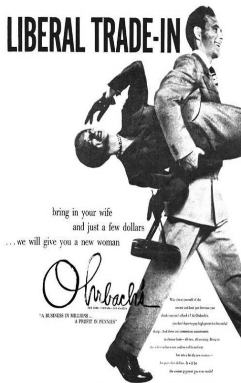
Figure 1: Orbach's