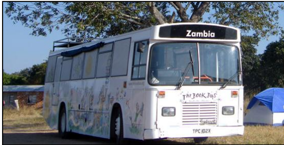
Tiger Book Bus

was devised, which is administered through VentureCo as a strand of their wider portfolio of volunteer and adventure tourism activities.