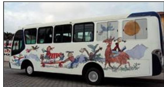
BISEE Book Bus

programmes across 4 regions of the country: Amazon, Andes, Southern Coast and Northern Coast. In 2013 it is planned that the Book Bus Foundation will begin activities in Rajasthan India.