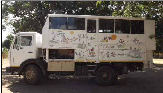
Matilda Book Bus

corners with shelving, posters and bright decoration that transform dull classrooms and inspire young reader's imaginations and creativity.