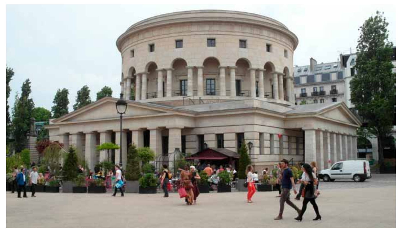
Figure 17.6 Claude Nicolas Ledoux, Rotonde de la Villette (1884-88), part of Farmers-General wall, Place Stalingrad.

whose rules we don't quite know. And yet, walking among Tschumi's signal-red folies whose 'madness' he insted on in an interview (Tschumi, 1986, p. 26), I cannot help but be reminded of Aragon's ruminations on modernity which conclude with the evocation of 'an essentially modern tragic symbol: ... a sort of large wheel which is spinning and which is no longer being steered by a hand' (Aragon, 1994, p.118). The 'folie' which sits along the east side of the grande halle, the former abbattoir, has a giant water wheel, spinning unsteered [figure 17.5]. Might this be another game of signification, one that taunts the notion that there is none to be found in Tschumi's folies?