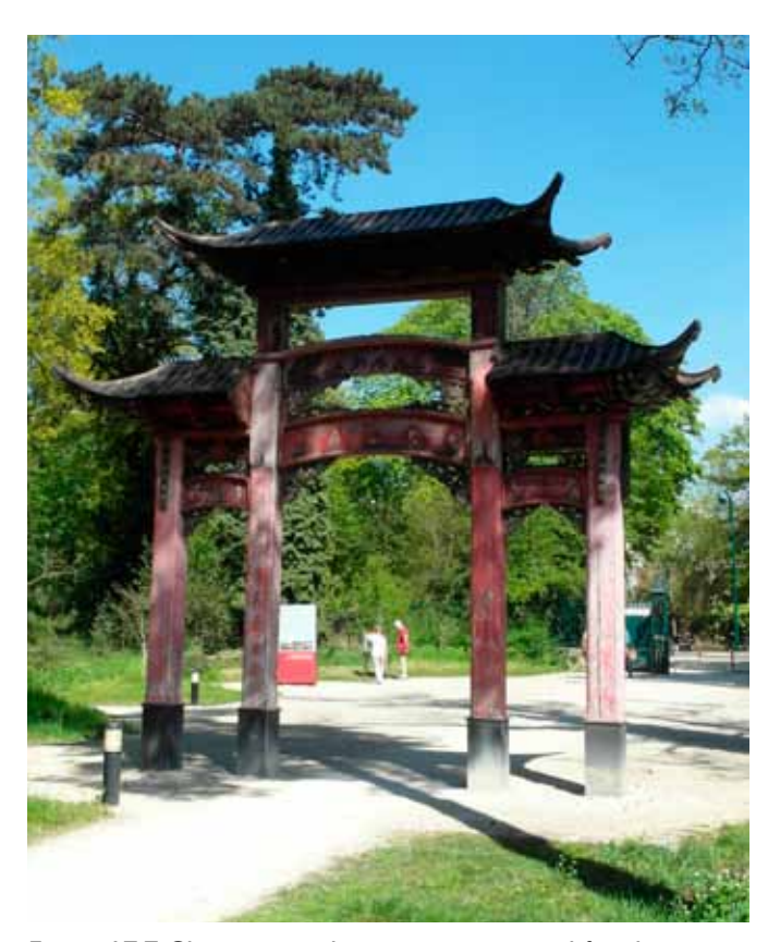
Figure 17.7 Chinese wooden gate, constructed for the Exposition Coloniale 1907, Jardin d'agronomie tropicale, Bois de Vincennes, Nogent-sur-Marne.