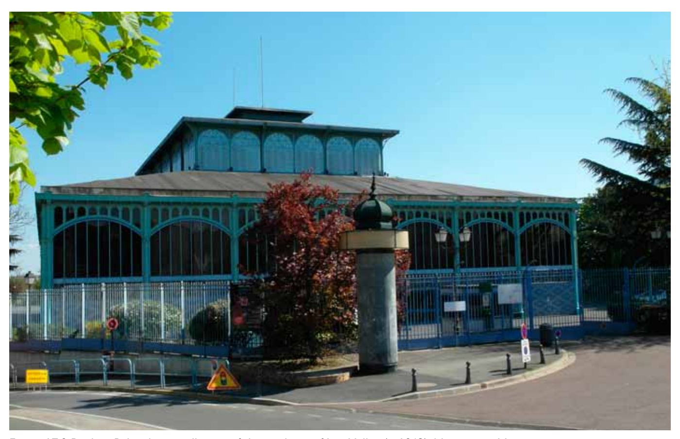
Figure 17.9 Pavilion Baltard, originally one of the pavilions of Les Halles (c. 1863), Nogent-sur-Marne.

I have taken you to places which now figure on your mental map of Paris. When arriving in Nogent-sur-Marne we resisted the lure of the dérive and headed straight for the Jardin d'agriculture tropicale. But Baltard must no longer wait. On the way back to the train station I detoured to pay a visit to the Baltard pavilion, the only one to survive the demolition of Les Halles in 1971; remnants of another now reside in Yokohama [figure 17.9]. The giant pavilion serves as an event space not dissimilar to the Parc de la Villette's central grande halle. However, the programme is pitifully sparse (http://pavillonbaltard. fr/). The pavilion is fenced off and uninviting. Nothing here speaks of its former function as a place of trade, exchange, encounter and consumption. It is hard to imagine the formidable fish wives' daily bickering and haggling so vividly recounted in Zolas' Belly of Paris (1873). Just outside the tall industrial gate nestles an odd assemblage of Haussmannian street furniture: lamp posts and iron benches, an advertising column and even a rubbish bin [figure 17.10]. These forlorn relics of nineteenth-century Paris are tied together in a nostalgic and inept gesture. The space in which the street furniture purposelessly congregates is called 'Square du Vieux Paris' [figure 17.11]. Nothing could be further from the truth. But that is not what I came here for.