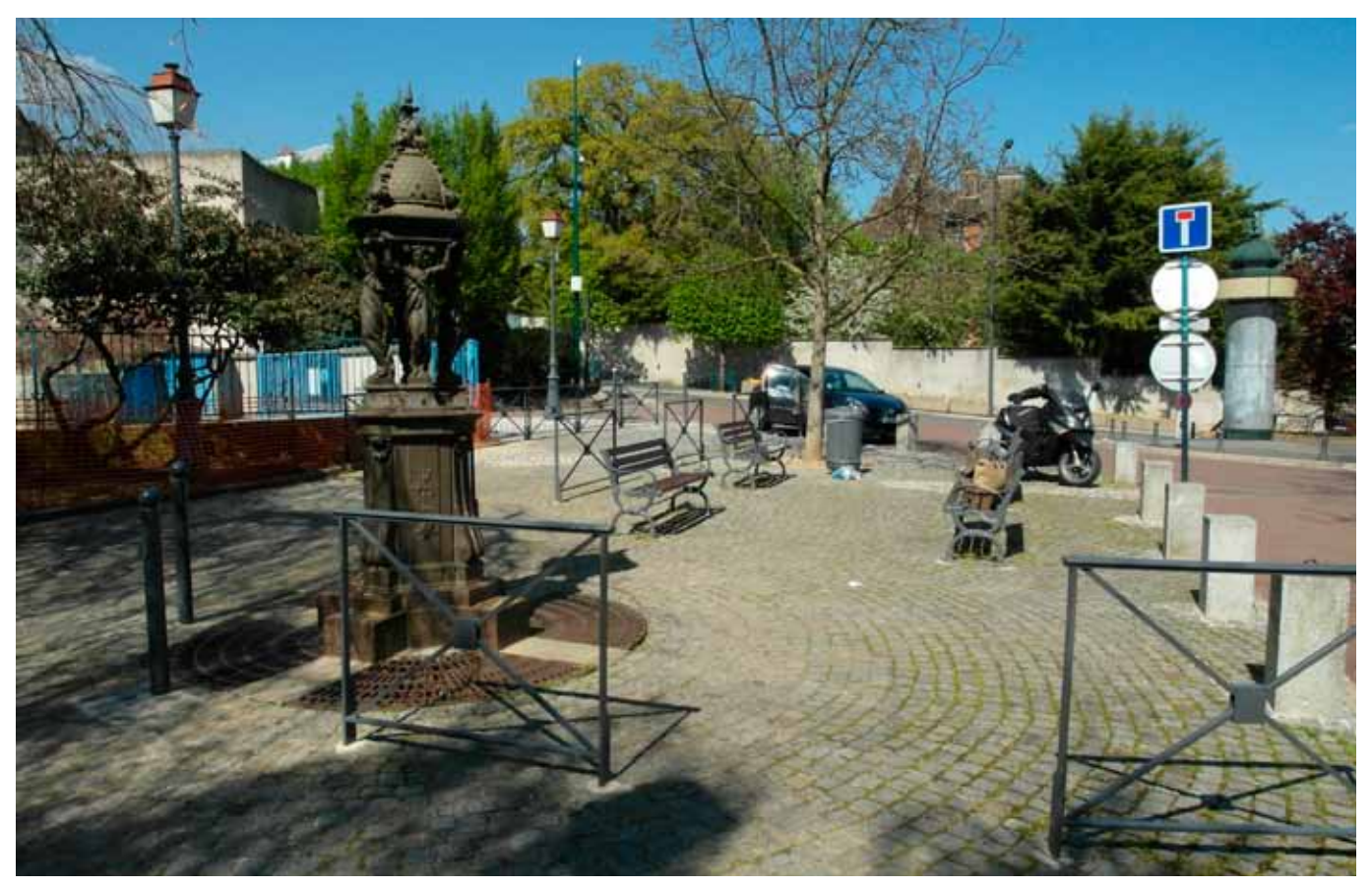
Figure 17.10 Haussmannian street furniture, reassembled in Nogent-sur-Marne.