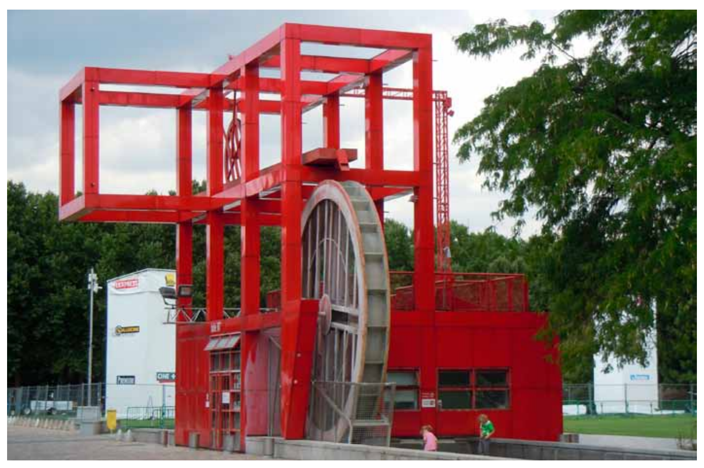
Figure 17.5 Bernard Tschumi, 'folie', Parc de la Villette (1982-87).