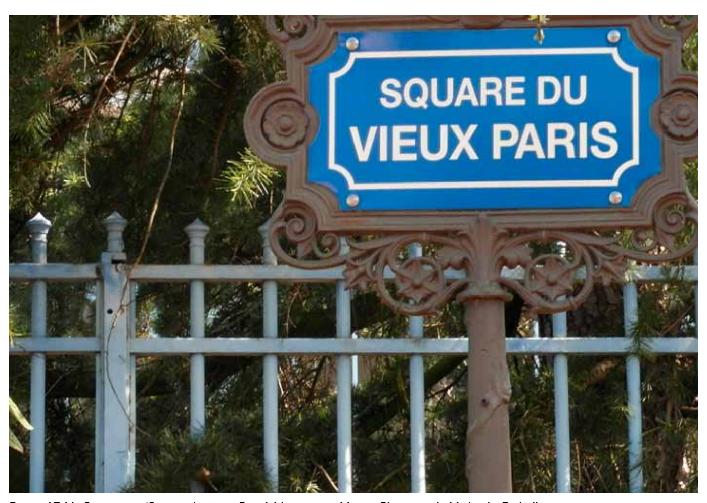
Figure 17.11 Street sign, 'Square du vieux Paris', Nogent-sur-Marne.