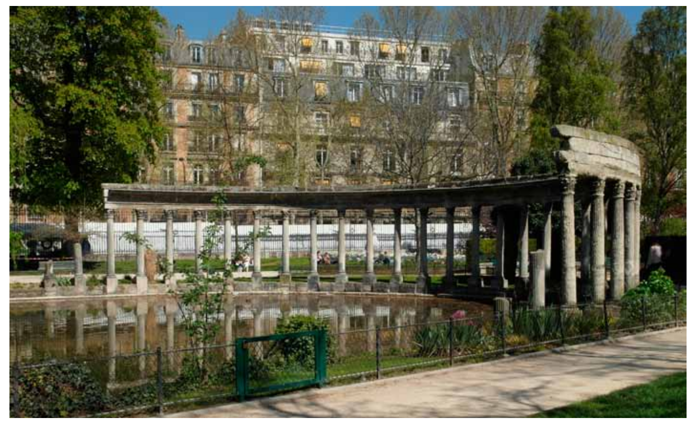
Figure 17.2 Classical Colonnade (1778), Parc Monceau.