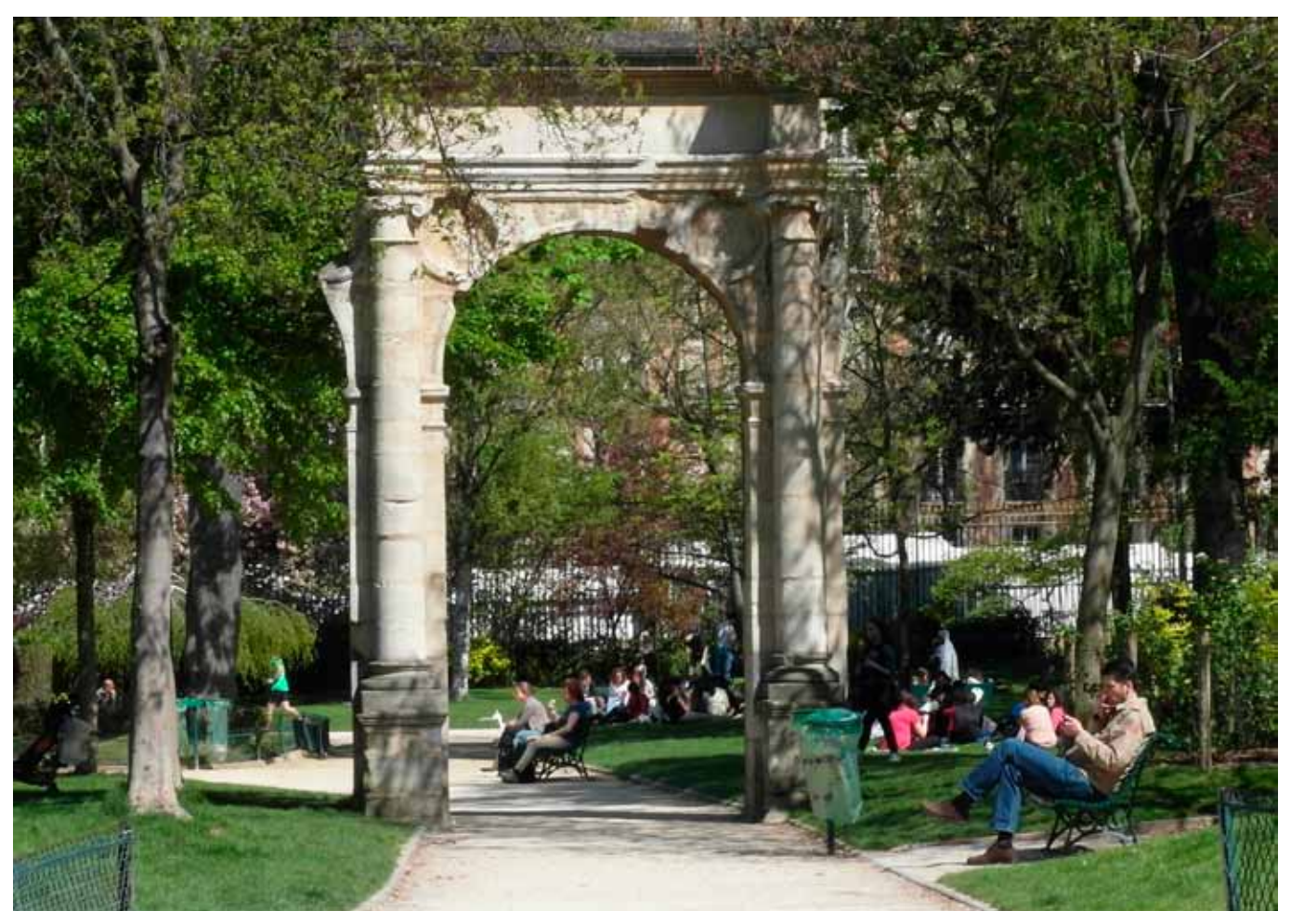
Figure 17.4 Fragment of the Hôtel de Ville, destroyed in the civil war of 1871.