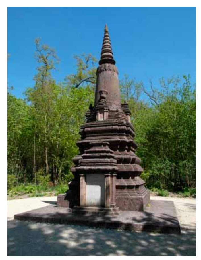
Figure 17.8 Monument to the war dead from Cambodia and Laos (1927), Jardin d'agronomie tropicale, Bois de Vincennes, Nogent-sur-Marne.

that had fascinated Debord. From the hip hangout, now a restaurant and bar, boom the heavy rhythms of dance music and a changing rainbow of colours illuminates the rotonda at night.