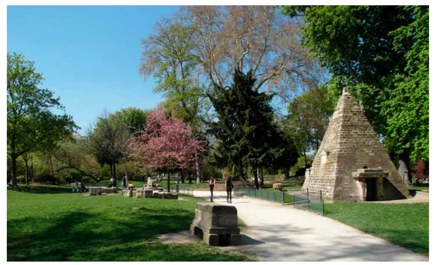
Figure 17.3 Egyptian Pyramid (1778), Parc Monceau.

frequently compared to antique Rome or Pompeii. The park's structures invoke a kind of time travel, or feigned voyage. They make manifest the symbolic aspiration of Paris as a new Rome as well as the tragedy of such a claim.