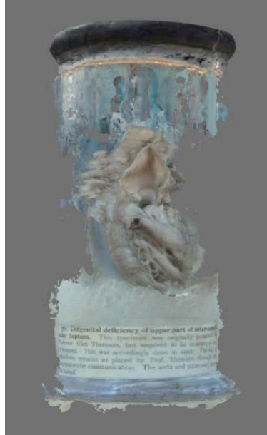
Figure 3: Wet specimen visualised by photogrammetry, displaying artefacts from preservation fluid and problems caused by glass reflection.