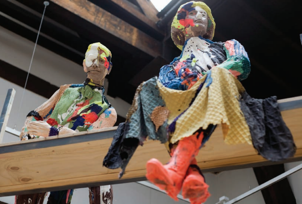
FIG. 6: The Immortals (detail) (2012), Folkert de Jong. Mackintosh Museum, The Glasgow School of Art.