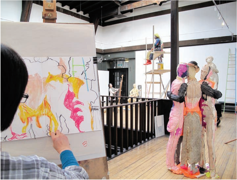
FIG. 7: The Drawing Studio workshop during Folkert de Jong's The Immortals , (2012). Mackintosh Museum, The Glasgow School of Art.