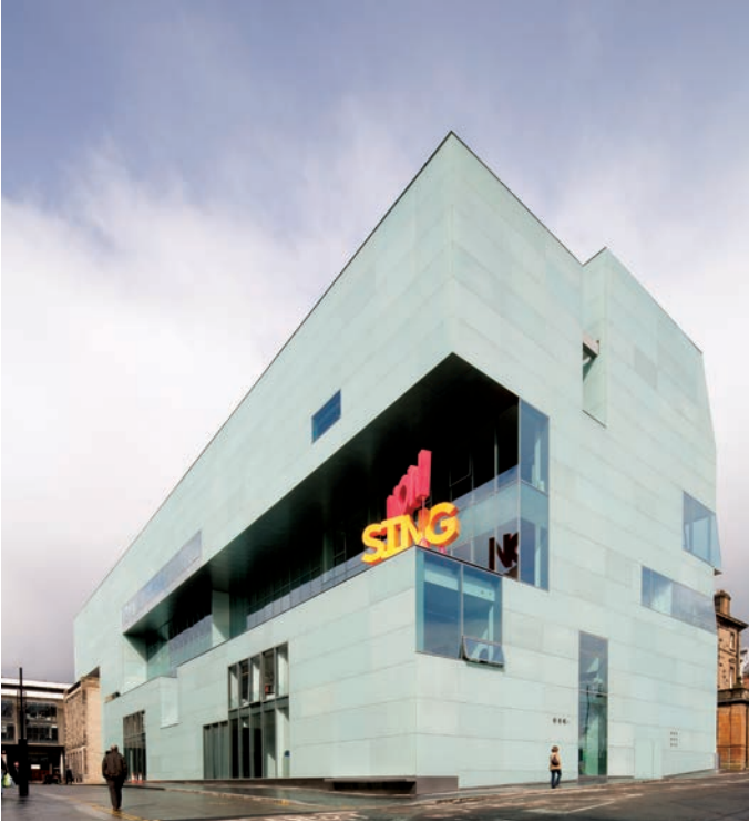
FIG. 8: Now Sing , (2014), Michael Stumpf. Balconies Commission, Reid Building, The Glasgow School of Art, on the occasion of Glasgow International Festival of Visual Art.