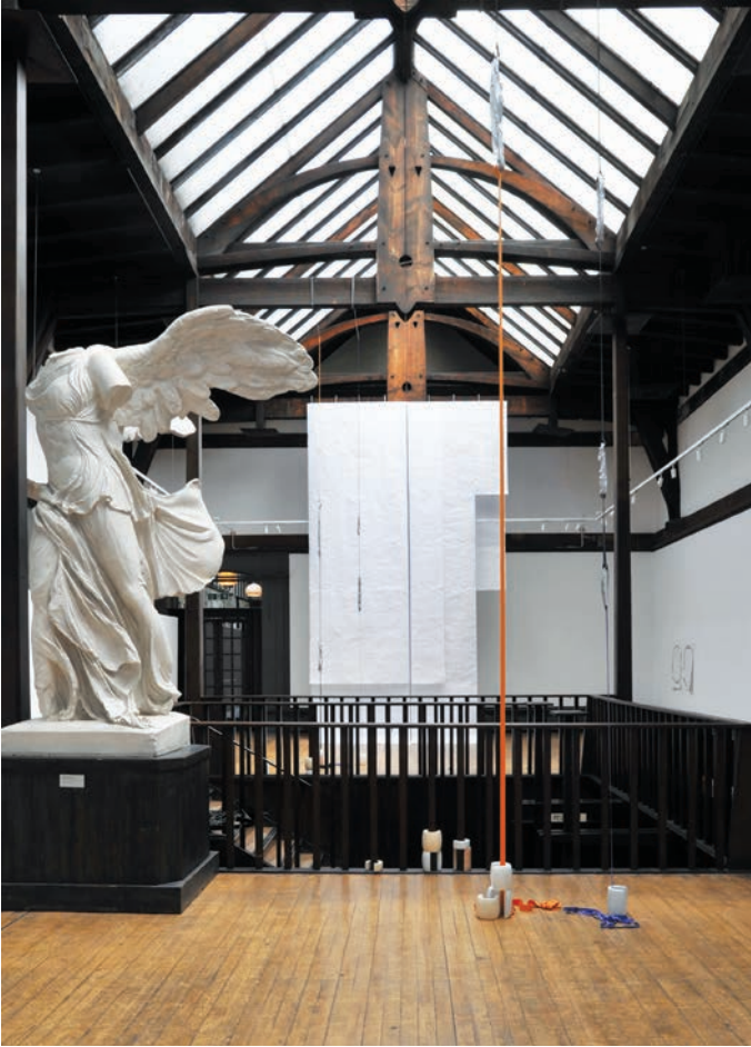
FIG. 4: Inhale, Exhale, Alice Channer (2010). Mackintosh Museum, The Glasgow School of Art.