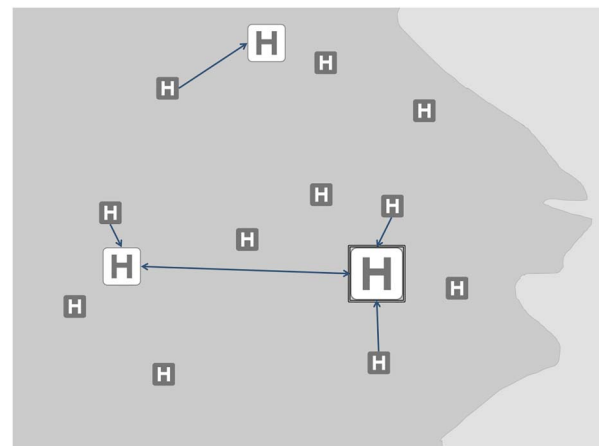
Figure 2 Example of a ‘Hub and Network’ model. The specialist, ‘Hub’, site refers to the centre which is commissioned to provide severe asthma services (depicted as largest white box). The wider network sites would supplement the specialised centre, rather than act as an alternative, and support the central service in delivering the best care for patients. The wider network might be made up of two types of sites: ‘satellite’ and ‘peripheral’ (depicted in white and grey, respectively). Satellite sites would be entrusted a level of responsibility to provide certain services governed by a contracted service level agreement with the Hub. The level of responsibility devolved would vary across networks and individual satellite sites depending on local needs and the expertise and capacity available at these sites.

volume specialist centres. These types of differences in opinion and viewpoints are inevitable when, over the years, independent local services have evolved in the absence of a national focus and create a political challenge in reorganising services to meet the specialised commissioning specification. Also inevitable is a degree of uncertainty around capacity and waiting times as the number of patients meeting the referral criteria could exceed expectations, particularly if the specialist units receive inappropriate referrals.