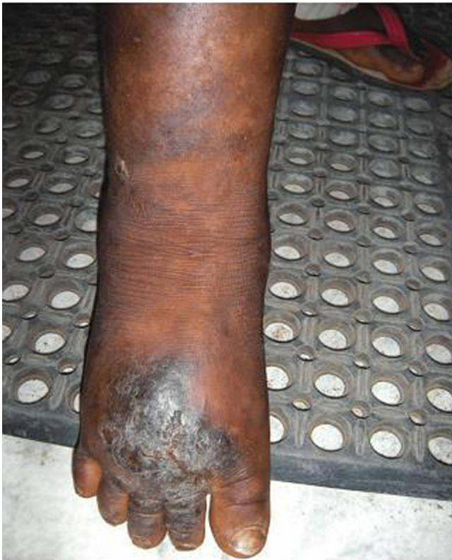
Fig. 1. Lymphedema of Right Lower Extremity.