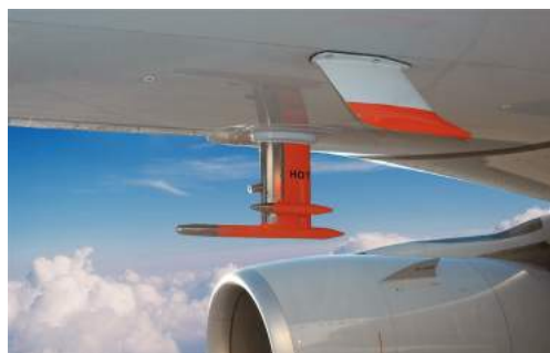
Fig. 4. Dedicated inlet system of the Airbus A340-600.

Figure 5 shows the layout of the optical and data acquisition systems for the instrument. The detection is based on 4 high-finesse optical cavities (cavity length \sim 44.1 \text{ cm} , expected finesse \sim 627\,000 , expected path length \sim 176 \text{ km} , \tau_0 \sim 30 \mu\text{s} ). Two cavities are operated at 662 nm (maximum absorption of \text{NO}_3 ), the other two at 405 nm (maximum absorption of \text{NO}_2 ). The inlet to one of the (662)-cavities is heated in order to thermally decompose \text{N}_2\text{O}_5 entirely to provide the sum of \text{NO}_3 and \text{N}_2\text{O}_5 , with \text{N}_2\text{O}_5 provided by the difference to a direct \text{NO}_3 measurement in a separate, unheated channel. One of the (405)-cavities is flushed continuously with \text{NO} in order to measure \text{O}_3 concentrations via quantitative conversion to \text{NO}_2 .