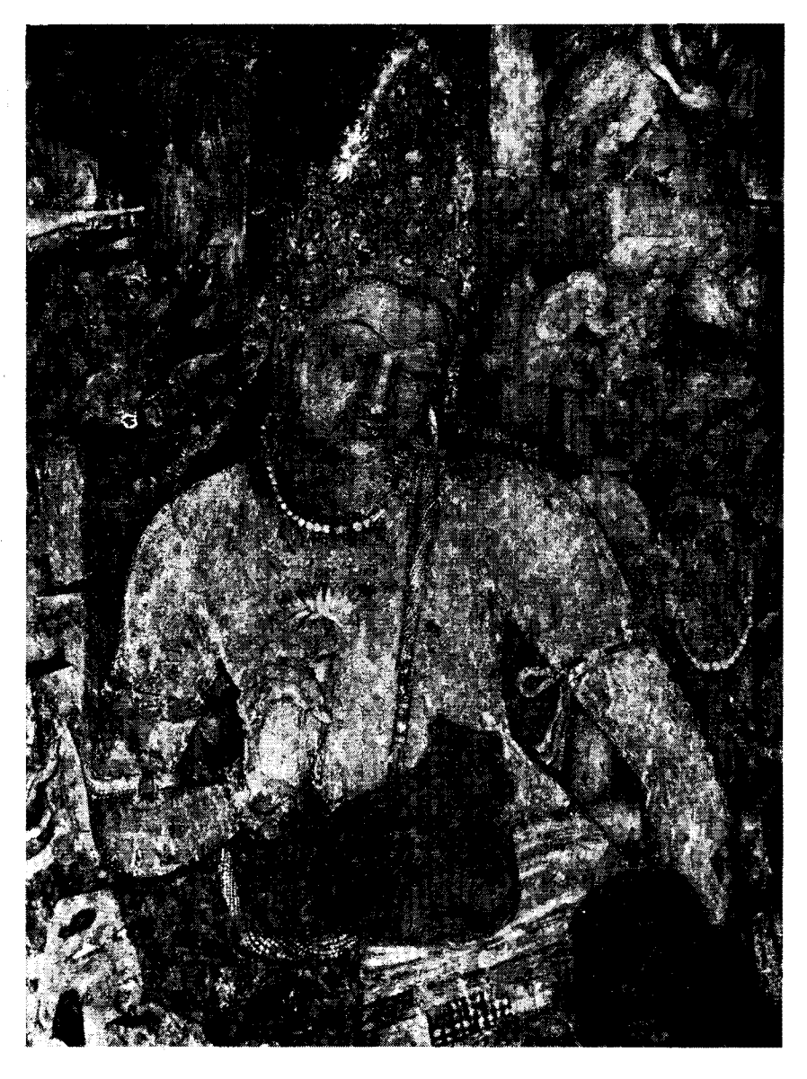
Plate XII. Ajanta, Cave 1 : Bodhisattva Padmapāņi

teings. In one inscription the gift is said to endow on the donor good looks, good luck and good qualities. The miracle of \hat{s}ravast_{\bar{i}} was also a very popular subject at Ajanta. Rows of Buddha figures, one above the other, came to be painted so as to depict the Thousand Buddhas. In Cave 2 there is an inscribed record mentioning the subject as 'Thousand Buddhas' ( Budha Sahasa ).