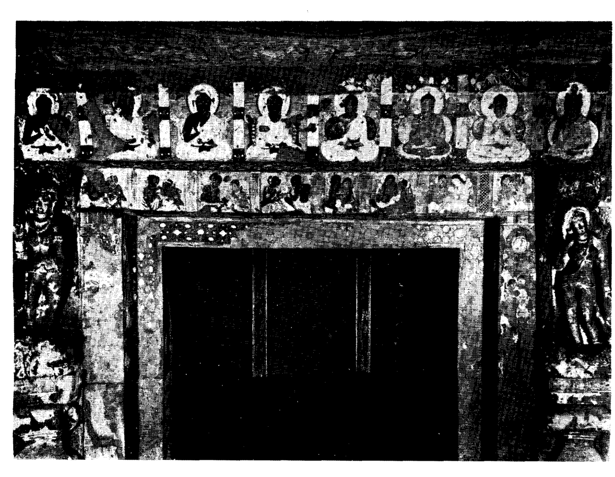
Plate XIII. Ajanta, Cave 17: paintings and sculptures on the entrance

The back wall of the verandah of Cave 17 fortunately retains a fair amount of paintings and thus helps in understanding the manner the