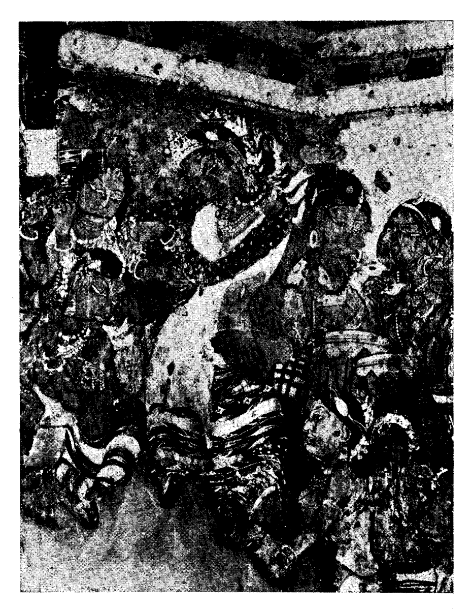
Plate XIV. Ajanta, Cave 1 : scene from the Mahājanaka Jātaka depicting a dance

The greatest quality of Ajanta paintings is, however, that it is imbued with feeling and can be appropriately called a bhāvachitra . Bhāvachitra is defined as that type of painting where the rasas such as śringāra , etc. are revealed to a person by mere observation and which create wonder in mind ( śringārādiraso yatra darśanādeva gamyate/bhāvachitrain tadā khyatain chittakautukakārakain ).