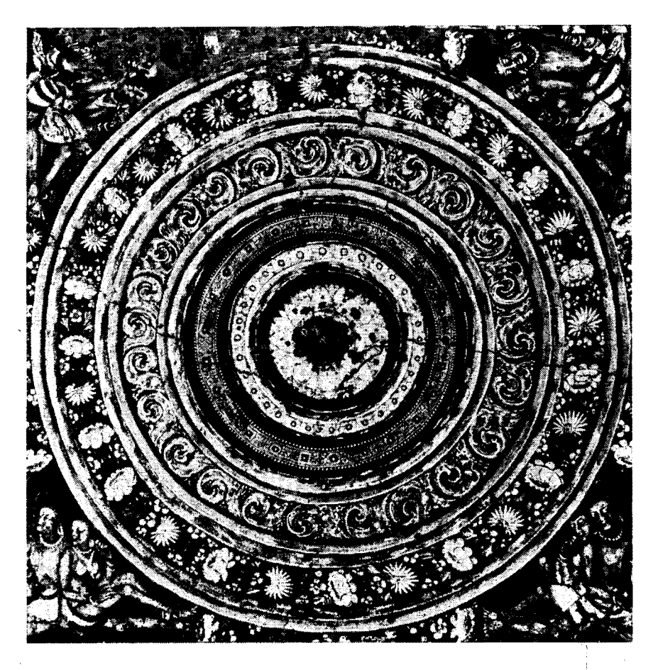
Plate XI. Ajanta, Cave 2: part of ceiling decoration

so as to evoke admiration for the artist who produced their graceful movements. The roundels with concentric bands of variegated colours and patterns around a central lotus with a gandharva figure or couples in the corners amidst clouds were a very common composition of the ceiling decoration.