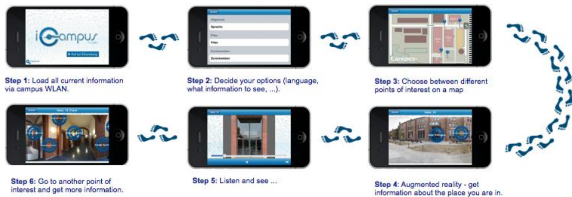
Figure 4: iCampus Wildau - How to use the system

The iCampus Wildau multimedia guide for the library helps to reduce this workload, since all important information has been provided by the guide as well. Let's see how it works. In Figure 4, you can see an example running on a mobile device: When you start the guide (Step1), then all available up-to-date information is loaded via wireless LAN (WLAN, wi-fi). Next, a user can make several decisions, e.g., what language he (or she) wants to use and what information he wants to listen to (Step 2). All content is location based, i.e., the information is provided where it belongs to. So, the user can now (virtually on a map and in real life) walk through the library and choose a point of interest (Step 3). Done so, a 360°- picture opens up showing the chosen point. In an augmented reality based way, the information which belongs to this place is placed on the picture (Step 4). By tapping it a user can listen to it (Step 5).