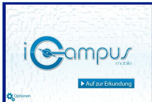
Figure 1: iCampus Wildau - Start screen in German: Let's start exploring!

Nowadays, self-guided audio tours are a common companion for visitors of museums, exhibitions and even on city tours worldwide. Newer technologies and devices, like Apple's iPod Touch, call for further developments. So, multimedia guides start to capture the field and to substitute classical audio guides. Although an audio guide might still be the first choice of curators of any museum to avoid distractions of a visitor from the actual exhibits, when it comes to other applications, multimedia guides can be more than helpful [1,2,5,6]. At our university, students have developed such a multimedia guide, called iCampus Wildau .