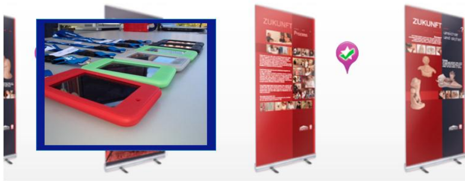
Figure 6: iPod Touch with multimedia guide for a special exhibition

To keep this exhibition alive, any interested user can still get the content via the iCampus webclient [3].