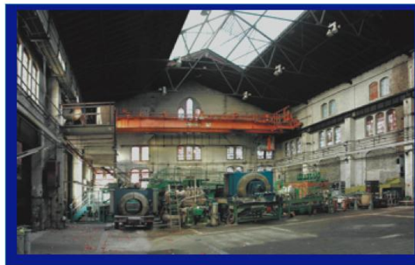
Figure 2: Indoor photo of the library before ....

Besides other applications, using iCampus Wildau as a multimedia guide for the university library has been especially successful. The library of University of Applied Sciences in Wildau is a central and, for many students and university employees, the favorite place on campus. Located in a former factory hall and now a listed building, it has a very interesting architecture and, most important, it is a modern and convenient place to work and study.