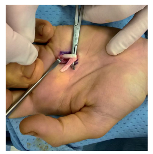
Figure 2. The picture shows the longitudinal partial flapshaped tear of the flexor digitorum superficialis.

showed the restoration of ring finger ROM (0-100 degrees) and the disappearance of the trigger, then the exploration of the distal pulleys (A2 and A3) was not necessary. Also, a capsulotomy of the PIP was not necessary because the limitation of ROM was not due to a capsular contracture. The patient was recommended to frequently move the fingers even with the bandage, to prevent the formation of adhesions. The cutaneous sutures were removed after 15 days. There was no need for physiotherapy as the ROM has been completely restored almost immediately. After 3 months of follow-up, no evidence of relapse was recorded and the ROM was 0-100 degrees.