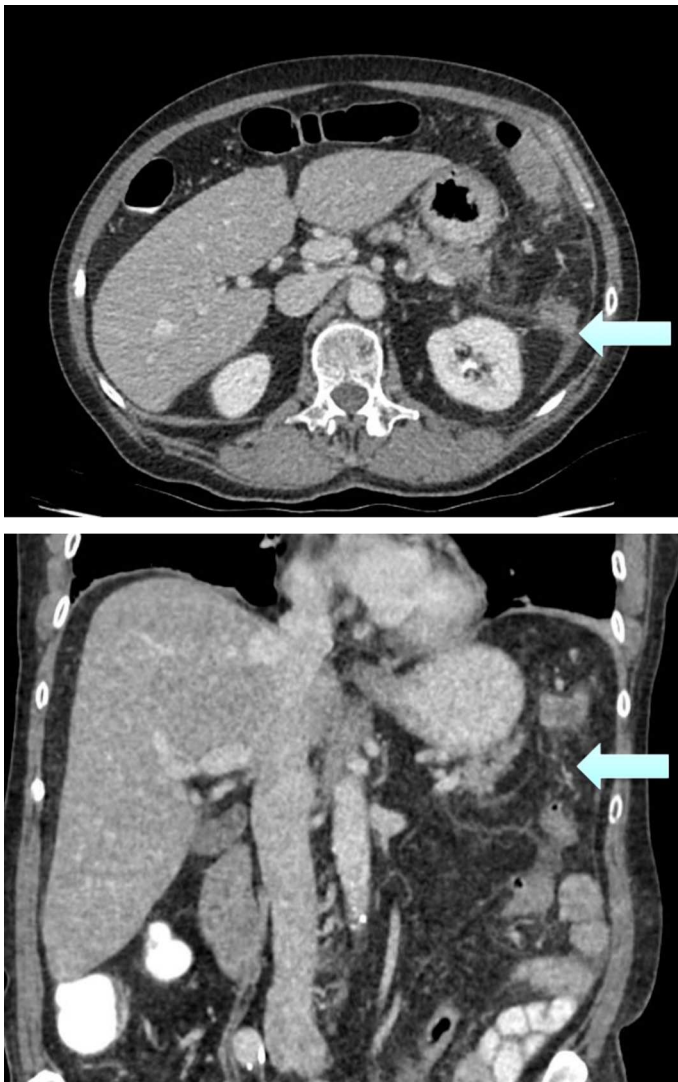
Fig 2 Computed tomographs of the abdomen (in axial and coronal views) showing fat stranding (increased density of fat, a sign of inflammatory process) and thickening (arrows) around the splenic flexure secondary to ischaemic colitis