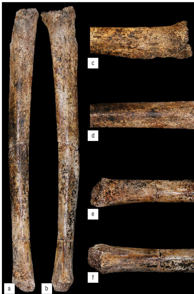
(a) Medial aspect; (b) lateral aspect; (c) close-up of anterior shaft; (d) mid shaft; (e) close-up of distal end seen in (a); (f) close-up of distal end seen in (b).

However, the distribution of Mn staining is not only on this one side of the specimen, but on all anatomical sides (anterior, posterior, medial and lateral), as shown in Figure 1. Such a distribution can also be seen on many specimens (for example, in Figure 2, specimen U.W. 101-1070, correctly attributed here). The distribution of Mn staining on the Dinaledi Chamber material is generally circumferential, occurring on multiple sides of bones. That distribution is not compatible with lichen growth in the present context, and there are significant reasons to reject the hypothesis that the Dinaledi Chamber is a secondary deposit. 2,13