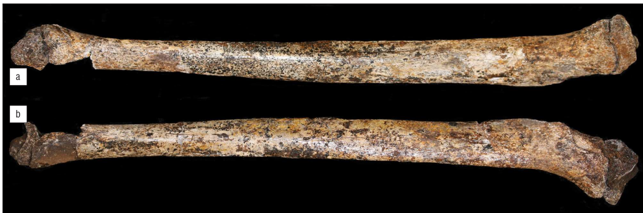
Figure 2: Patterns of mineral staining affecting tibia U.W. 101-1070. Note differential mineral staining patterns between conjoined fragments at the distal end.

In addition to lichen, Thackeray suggests 1(p.5) that snails and beetles could indicate the presence of leaf litter (on which they feed), which would be found near the cave entrance and therefore in a situation with diffuse light. However, as noted by Dirks and colleagues 13 , snails have been recognised to colonise dark caves to considerable depth 17 , and are far from restricted in diet to just plant matter 18 . Gullella sp. and Euonyma varia (Connolly, 1910) occur in large numbers in the Rising Star Cave system, including in deep chambers in the dark zone, and may well be responsible for some of the bone surface modifications on the fossils. Subulinid snails (including Euonyma ) are largely omnivorous and are thus not dependent on green plant material as a food source (Herbert D 2016, personal communication, January 28), while Gullella spp. are carnivorous and feed mostly on other snails. 18