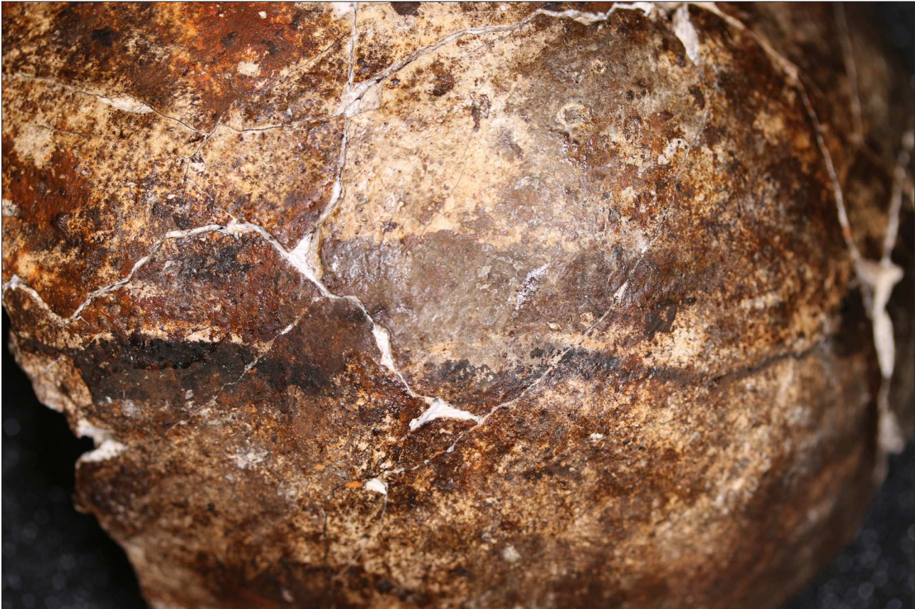
Figure 3: Specimen U.W. 101–419 Cranium A(1) displaying tide lines of mineral staining which extends across different vault fragments. Tide lines mark a contact boundary between the bone surface and surrounding sediment, and indicate the resting orientation of the bone during precipitation of the stains.

Thus the notion that snails are light-dwelling, leaf-litter feeders is incorrect, and bone surface modification by snails cannot be used to imply a close entrance to the surface or redeposition of the hominin fossil material from a location near light. Furthermore, much of the radula damage observed on the bones of H. naledi occurs after they were mineralised – therefore most invertebrate damage was probably produced inside the dark Dinaledi Chamber on bones already covered in coatings of manganese and iron oxide deposits (Figure 4).