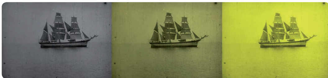
Figure 2. Three different “stages” of Aan de kust van Istrië during its digitization process. Color image available in the electronic version of The Moving Image , accessible via JSTOR.

techniques, for instance, can be seen as a classic example, because a renewed focus on color helped shape a new conception of early cinema. This was emphasized by filmmaker and former Nederlands Filmmuseum deputy director Peter Delpeut in his keynote presentation at the Colour Fantastic Conference in Amsterdam in March 2015.