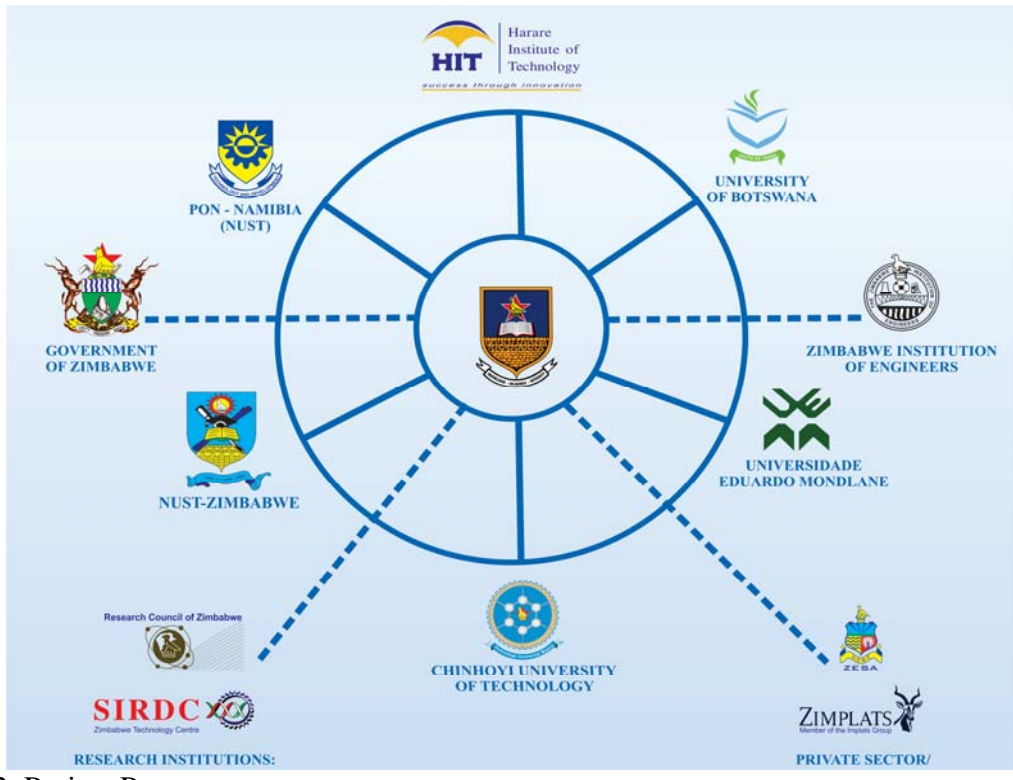
Figure 2. Project Partners