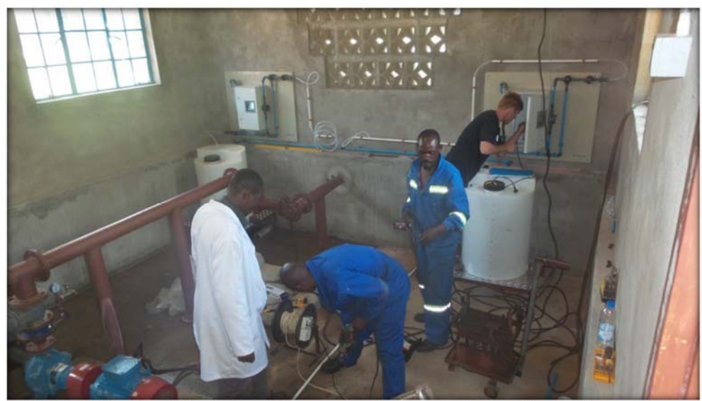
Figure 4. Technical Staff at Work Installing the Chlorinators in the Pump House