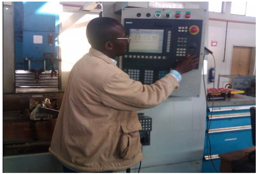
Figure 5. CNC Programming under Professional Training.

Most of the equipment in the Faculty of Engineering at UZ is now old and obsolete. A proposal to re-equip the workshops and laboratories with modern equipment was presented and accepted by the University authorities and therefore the Faculty has gradually been purchasing these. However, one major challenge that the Faculty would have faced was the lack of skills to operate these new machines. Part of the project funds were thus utilised to train 10 academics and technicians in the use and programming of CNC machines. Thus the machines that have been purchased so far are not idle but are now readily used for projects and practicals. Figure 5 shows one of the beneficiaries of Professional Training, programming a CNC machine.