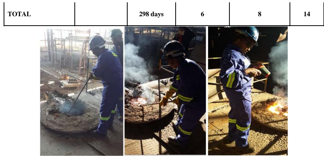
Figure 3. A Young Female Academic who was attached at Craster International Foundry.

One notable achievement from the project was the involvement of both technical and academic staff on the UZ Groundwater project. The Faculty of Engineering's personnel, most of whom had been attached at various companies as summarised in Table 1, were involved in the design and development of the groundwater system at the UZ. Because of failure by the local authorities to provide adequate and fresh water to Harare, the Faculty took up the challenge to develop a successful groundwater supply to the entire campus. The design team consisted of technicians and academics (professional engineers) from Land Surveying for the provision of routes for the pipe network and levelling, Civil Engineering for all the civil works and construction of sump and pump house, Mechanical Engineering for the fabrication of pump house pipes and sizing and selection of both submersible (borehole) and booster pumps and Electrical Engineering for powering and controlling the network. The system developed also included a purification plant for chlorinating and thus supplying clean water to the community (Figure 4).