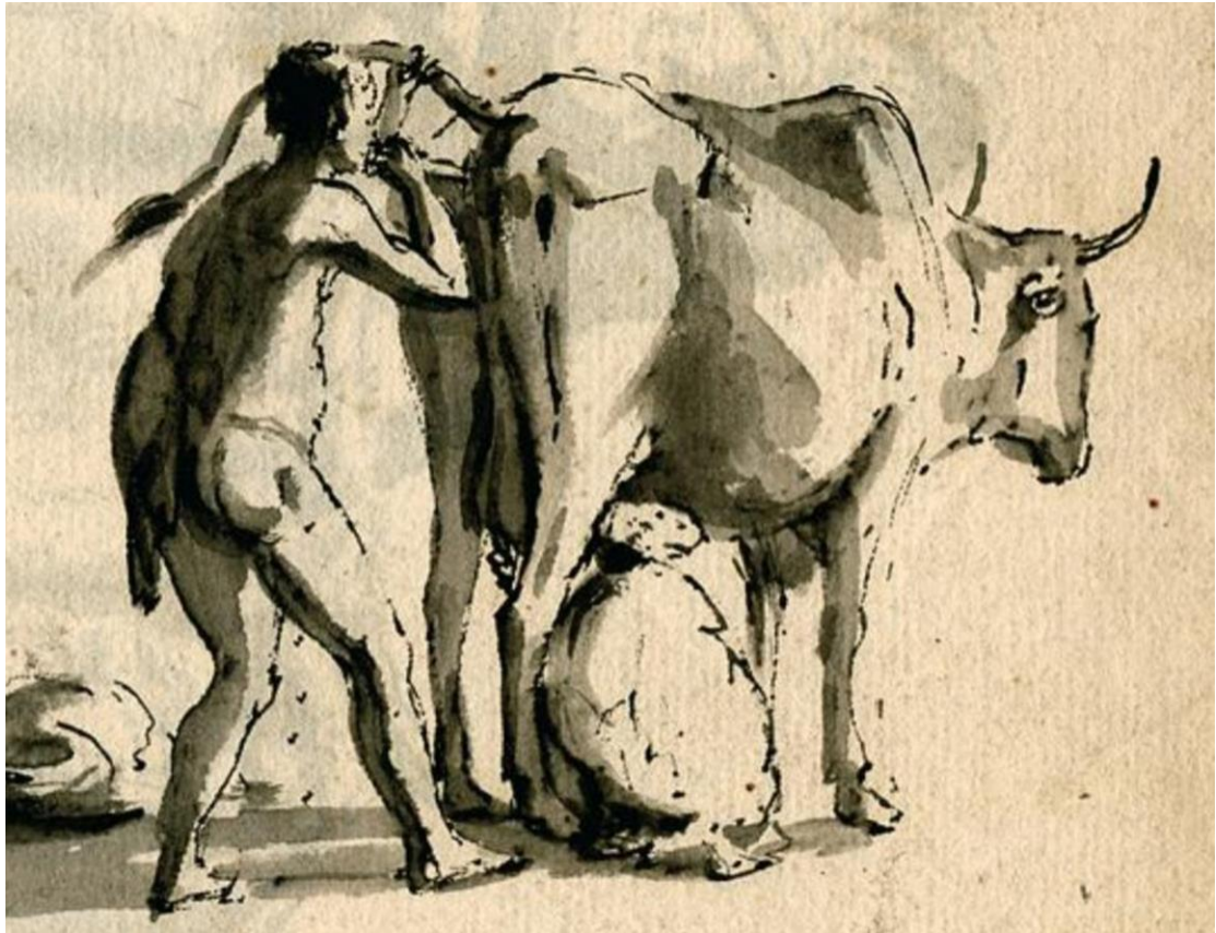
Figure 3. A drawing of insufflation, thought to pre-date 1713, in which a reed may have been used to blow air into the cow (see Smith & Pheiffer 1993: 54-55).