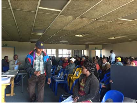
Figure 3- Community members at Alexandra community meeting

to lock away extra stock, and locations of running water, toilets and drainage. They were articulate, respectful of each other's voices and considerate of each other. They spoke inclusively and deliberated.