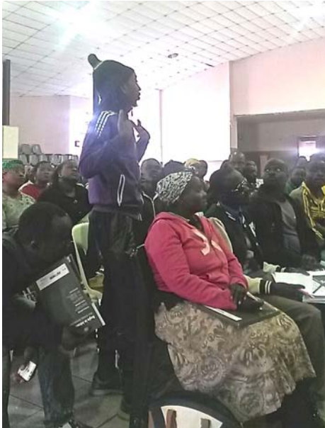
Figure 2- Community member from Ivory Park