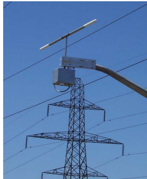
Fig. 3. ThermalRate installation [22]

An Alstom P341 relay employs weather station data in determining ampacity or DLTR and is used as a back-up protection for possible line over-loading (line loading exceeding the determined ampacity) in the context of wind power integration. In a case of line loading exceeding the power line ampacity, the relay can act by reducing the wind farm power output in order to maintain the transmission line loading below ampacity level and maintain transmission reliability or even trip off the wind farm [20].