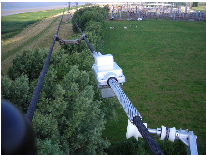
Fig. 2. Ampacimon installation on a 400 kV line [21]

The CAT-1 load cells are installed at the dead-end structure of a power line and they measure tension of the line suspension section. The sag on the suspension section span is determined by the conductor tension [20].