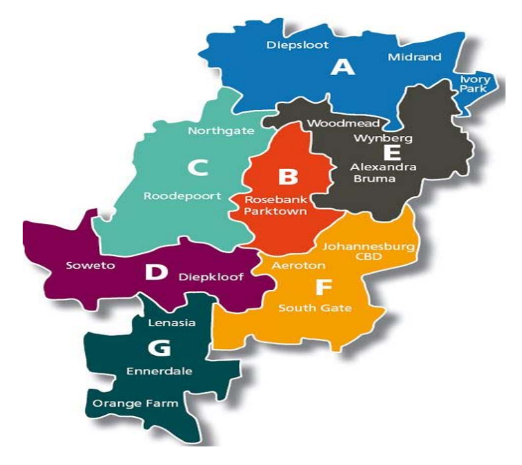
Fig. 1 City of Johannesburg Regions

Currently, at CoJ, there are four active LSs. They are Robinson Deep with about 7 years to its end of life, Goudkoppies with about 15 years remaining to be closed, Ennerdale with about 13 years left and Marie Louise with about 6 years left to be closed (Table 2). Each of this site received approximately about 1000 tons of wastes or less on daily basis and one of the them, Robinson Deep LS operates for a period of 24 hours daily [33].