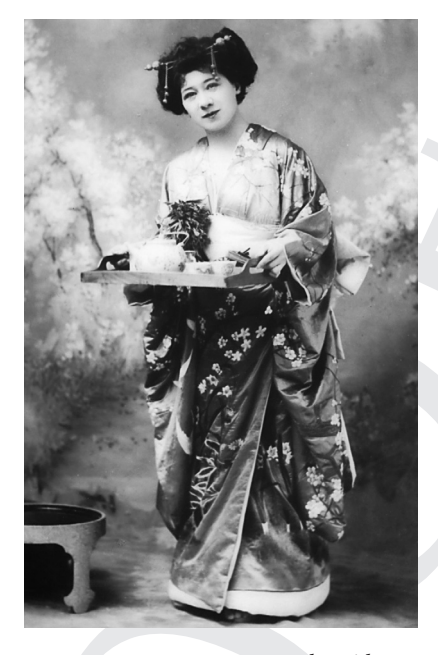
FIGURE 16 Doing Other cultures. Marie Tempest in The Geisha (1896)

Against the complaints of critics of the new department stores who frequently highlighted their corrupting effects – invariably on women – these shows allowed for a celebration of these shopping cathedrals as a "new heterosocial space," a sexualized site offering the opportunity for men and women to mingle relatively freely.<sup>14</sup>