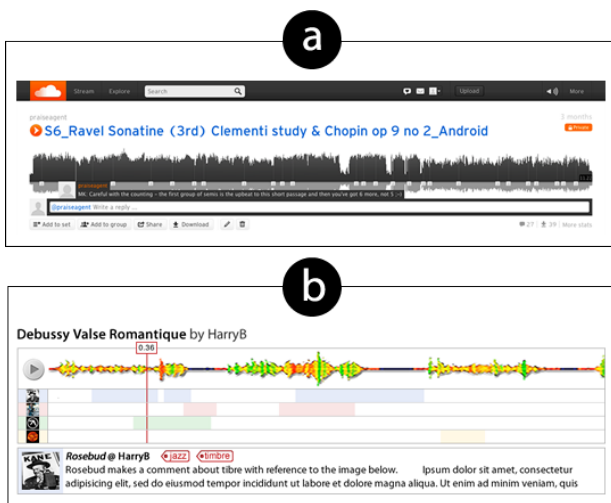
Figure 3: Initial prototypes: a) Embedded Soundcloud timeline showing a teacher commenting on a student's performance; b) concept design for a multitrack timeline

A 'minimal viable prototype' was developed in three weeks using an embedded version of the SoundCloud timeline (figure 3a).