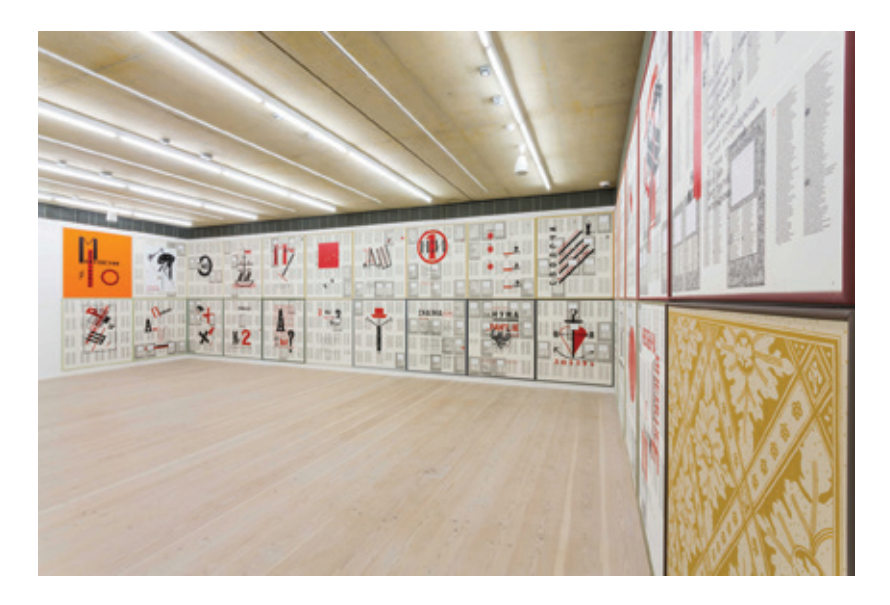
Figure 6. David Mabb. Announcer, 2014. Installation view, Focal Point Gallery, Southend-on-Sea.