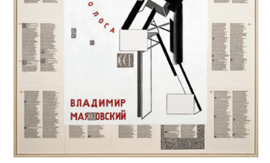
Figure 7. David Mabb. Announcer 2, 2013. Paint on paper, 148 cm x 168 cm.