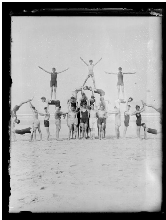
Figure 6. Pupils in a geometrical formation on the beach in Belgium. © Institut Emile Metz / [Inventory number HISACS000207V01] (CNA Collection).

inside the gear wheel, like the pointer of a clock, can be said to symbolise subjection to the rhythm of the machine imposed by the industry's quest for maximum productivity. 85