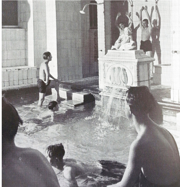
Figure 4. Activities around the institute's bathing and swimming installations. 69

Like the institute's gymnastics equipment, its bathing and swimming installations – as they were commonly called at the time – were also apparatuses that advanced and reflected newly imagined interrelations between bodies and machinery. As a self-promotional brochure issued by ARBED in 1922 stated, in these installations, too, “every day the systems of [Georges] Hébert and [Pehr Henrik] Link [sic] [were] practiced”. In other words, here too supposedly ‘natural’ and ‘mechanical’ 70 systems of choreography were applied to human body-motors. Cleanliness, pureness, revitalisation and preservation as key elements of the new cult of hygiene and medical prescriptions 71 further justified scrutinising these human motors. The water central to the photograph (fig. 4) necessitated and helped naturalise the exposure of their more intimate body parts. At the same time, the various ways in which this water was treated required much of the machinery interacting with human body-motors to remain hidden from view. That said, evoking associations with happiness, natural rhythm and relaxation, the scene in which the spectator takes part from behind the participants' shoulders obfuscates just how much the habit of disrobing and bathing in public 72 needed to be interiorised in order for the body to interact in an almost