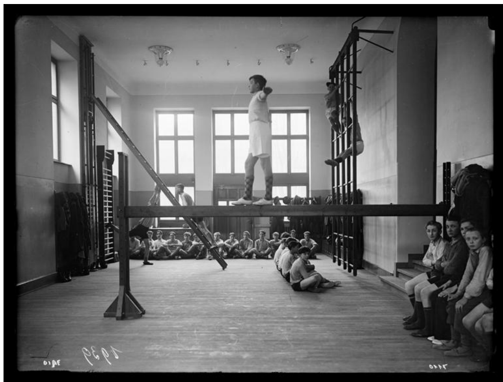
Figure 3. Gym of the Institut Emile Metz (1939).

touch and flow of movement and thus passed as the art of filing. 54 This choreography was embedded in a more complex chain of connections between human bodies and machines. In this chain a dynamographic file could become a lens to inspect, an instrument to train or correct, and statistics could in turn become the brain of an expert 55 by means of which pupils' performances were assessed, and compared with a norm with which they were expected to comply. Machines and bodies thus fused, both completing and perfecting each other in a human-mechanical constellation. The body, by being attached to devices which in the context of the then-reigning experimental system were supposed to be able to measure its output, and by performing in a mechanical choreography, implied and further reinforced human motor metaphors.