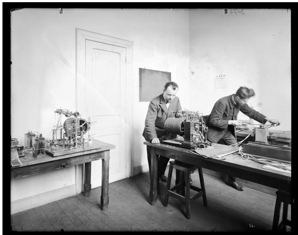
Figure 2. Filing test in the institute's psychophysiological laboratory.

fusions made evident infinite possibilities. 47 As an agent, the image enabled such understandings of the interrelation of bodies and machines and added new layers of meaning around the physical and the mechanical in the field of education and beyond.