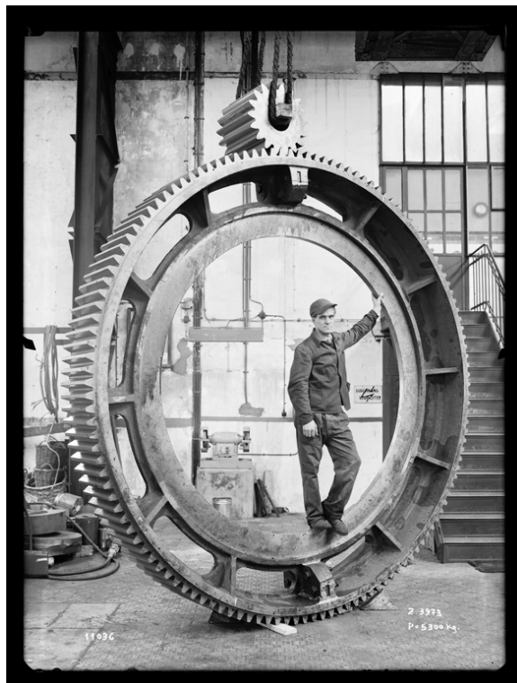
Figure 5. Worker standing in a crusher's gear wheel.

[Inventory number HISACS000849V01]