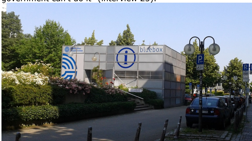
Figure 5: The "blue box" to engage with stakeholders about the Ebertstraße redevelopment

In addition, the highly political nature of the Hans-Sachs-Haus building, together with the importance of the entire Ebertstraße project for the future of the city centre, meant that the council needed to demonstrate transparency in its decision-making and project management. This required significant engagement with the organisations occupying neighbouring properties and the wider public. For example, large and prominent Lutheran and Catholic churches overlook Heinrich-König-Platz, and there was some initial concern about whether the work would affect the fabric of these historic buildings (interview 17). A number of local businesses, such as an ice-cream parlour that experienced a significant drop in sales because of the amount of dust produced during the construction phase, were not particularly happy with the plans (interviews 17 and 23). More broadly, other groups within the city argued that the money should have been spent on schools or kindergartens rather than redeveloping the city centre. These criticisms were bolstered by the poor management of public works projects elsewhere in Germany, which fed a growing suspicion that “the council can’t do it, or local government can’t do it” (interview 23).