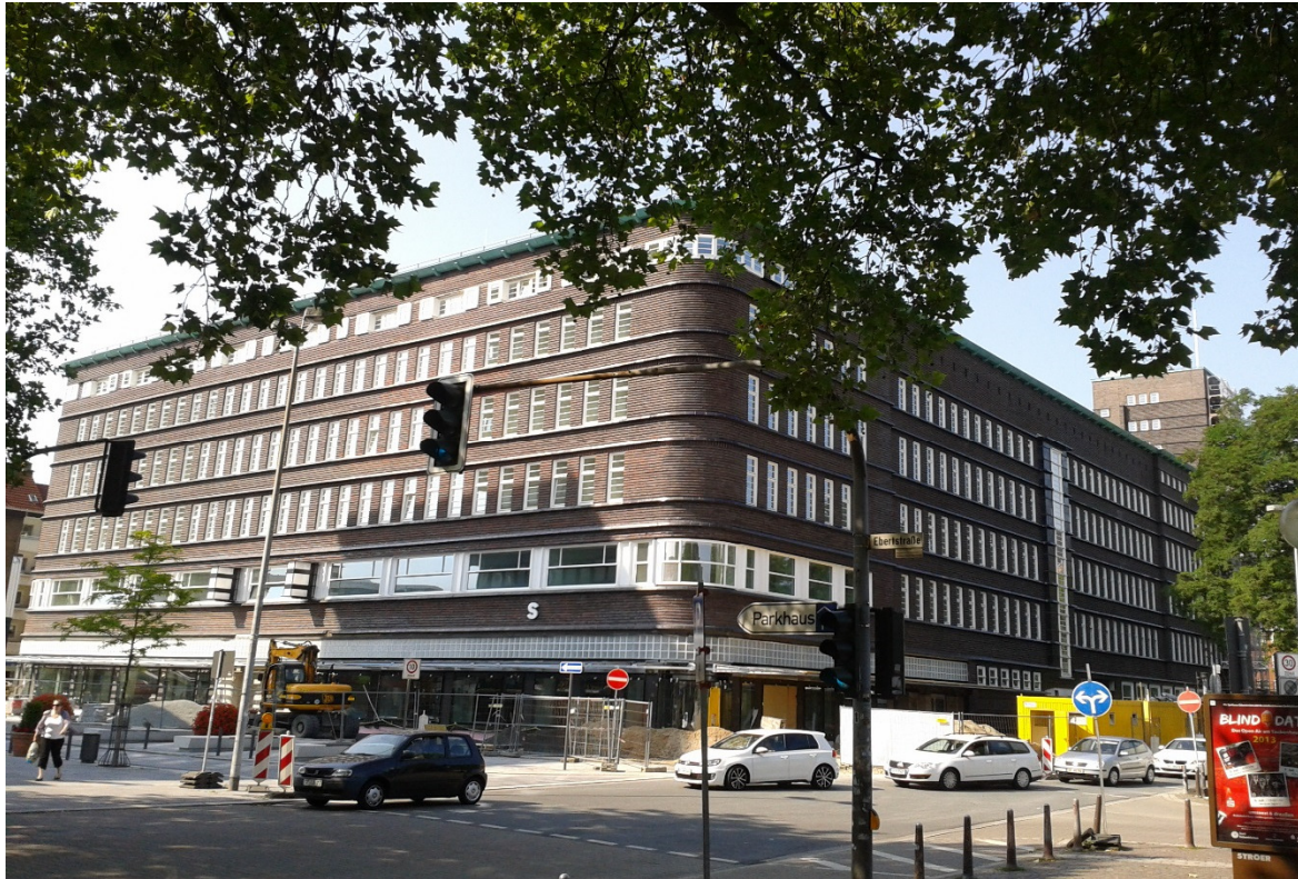
Figure 3: Hans-Sachs-Haus shortly before it was reopened (photograph taken in July 2013)

The controversy over the future of Hans-Sachs-Haus ran in parallel with the decline of traditional heavy industry in Gelsenkirchen and the city's attempts to re-orient the local economy around newer technologies, particularly solar energy (Jung et al. , 2010). As the political debate over the building meant that it became an even more prominent local landmark, the council sought to ensure it symbolised Gelsenkirchen's position as a city that was forward-looking and sustainable. Furthermore, the building's location in the centre of town, and the council's desire to re-brand the area around Ebertstraße as "the heart of the city", ensured that Heinrich-König-Platz and Hans-Sachs-Haus would symbolise the city of Gelsenkirchen in the eyes of both local people and visitors (interviews 23 and 24). In this way, we might expect the council's policies on climate change to manifest themselves in the building's design and energy requirements. As such, both development projects are relevant objects of analysis for the purposes of this thesis, although Hans-Sachs-Haus's status as an occupied council building means that it is generally more applicable than the re-landscaping of Heinrich-König-Platz.