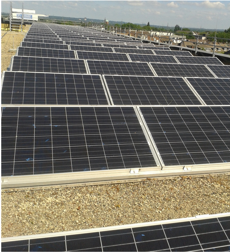
Figure 6: Photovoltaic panels on the roof of Hans-Sachs-Haus

However, within Gelsenkirchen more generally there has been a shift towards ensuring a financial return on investments over the medium term. This stems partly from the council's precarious budgetary position, but it is notable that sustainability features are often seen as a way of meeting this budgetary requirement, by reducing energy consumption (and therefore expenditure) or generating income through feed-in-tariffs. As such, adopting green technologies serves a dual purpose, even if it can take some time to generate a return on the initial investment: