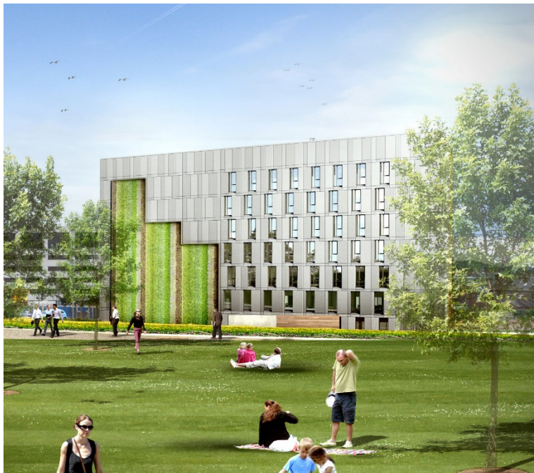
Figure 7: The “living wall” on the side of the Core Building (source: Newcastle Science Central (artist’s impression))

Therefore, although the building might not incorporate the most cutting-edge technologies at the outset, its flexible nature will mean that the design can be improved in response to how it actually functions. In addition, the data that it produces on user behaviour and the effectiveness of particular solutions should inform the design of buildings in the future and thereby contribute to sustainability initiatives outside the Science Central project. Interestingly, we can see how this attitude also encapsulates the “English” policy style of horizontal engagement – to an even greater extent than the council’s approach. By ensuring that the building can respond to its occupants’ behaviour and technological developments, the university is effectively continuing to consult (albeit implicitly) with relevant stakeholders after it has been constructed. Although Gelsenkirchen could upgrade the sustainability features of Hans-Sachs-Haus in the future (for example, it might replace the existing PV panels with more efficient solar technology once it becomes available), these flexible principles are not integrated into its core design.