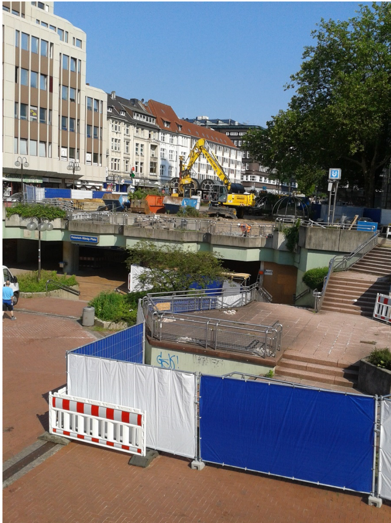
Figure 2: Picture of Heinrich-König-Platz being redeveloped in July 2013. Hans-Sachs-Haus is in the background (partly obscured by the tree)

König-Platz) formed a key part of its plans for the city centre. These plans came under the broad heading of Stadtumbau-City and, in contrast to many other initiatives within the overall programme, focused primarily on the physical redevelopment of public space rather than 'softer' issues of social inclusion or responses to industrial decline. As such, it sought to replace or refurbish many post-war buildings in the centre of Gelsenkirchen, expand the pedestrian precinct and re-use some brownfield sites. At the centre of the plans was the redevelopment of Ebertstraße, a street running north-west from the central Heinrich-König-Platz to the famous Musiktheater. Hans-Sachs-Haus is situated towards the Heinrich-König-Platz end of this street (see Figure 2).