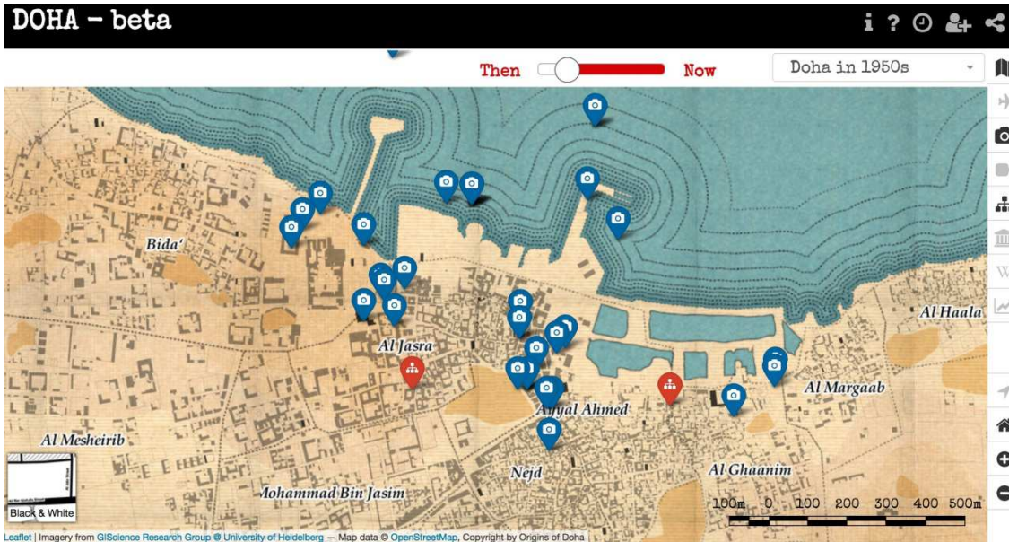
Fig. 3 – DOHA: the Doha Online Historical Atlas

Finally, we have created the Doha Online Historical Atlas (DOHA: http://originsofdoha.org/doha/ ), an online historical Geographic Information System (GIS) (BODENHAMER, 2010). DOHA presents research from the Origins of Doha team as visualized on an interactive map of Doha. Users of the interface can overlay historic aerial photos and increase and decrease visibility of these photos on the modern landscape. Aerial oblique imagery is also noted on the map, complete with location and angle of the photograph.