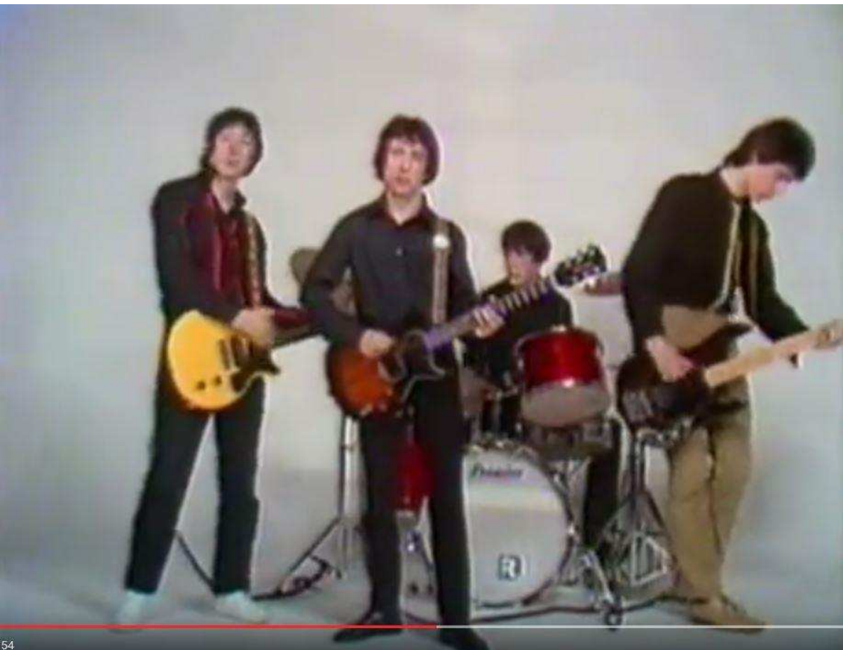
Figure 5 - Another time and space (Buzzcocks freeze frame)