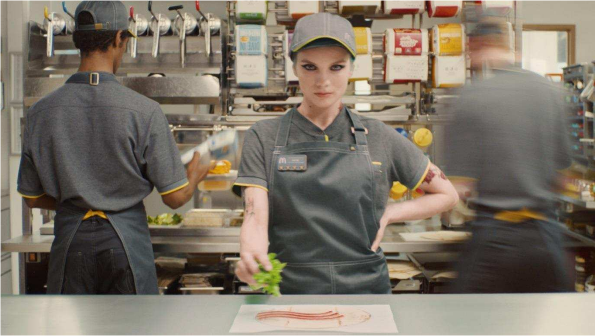
Figure 4 - A different time and space (McDonalds freeze frame)