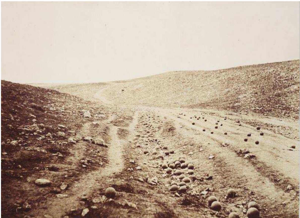
Figure 2 - Valley of the Shadow of Death (Roger Fenton)