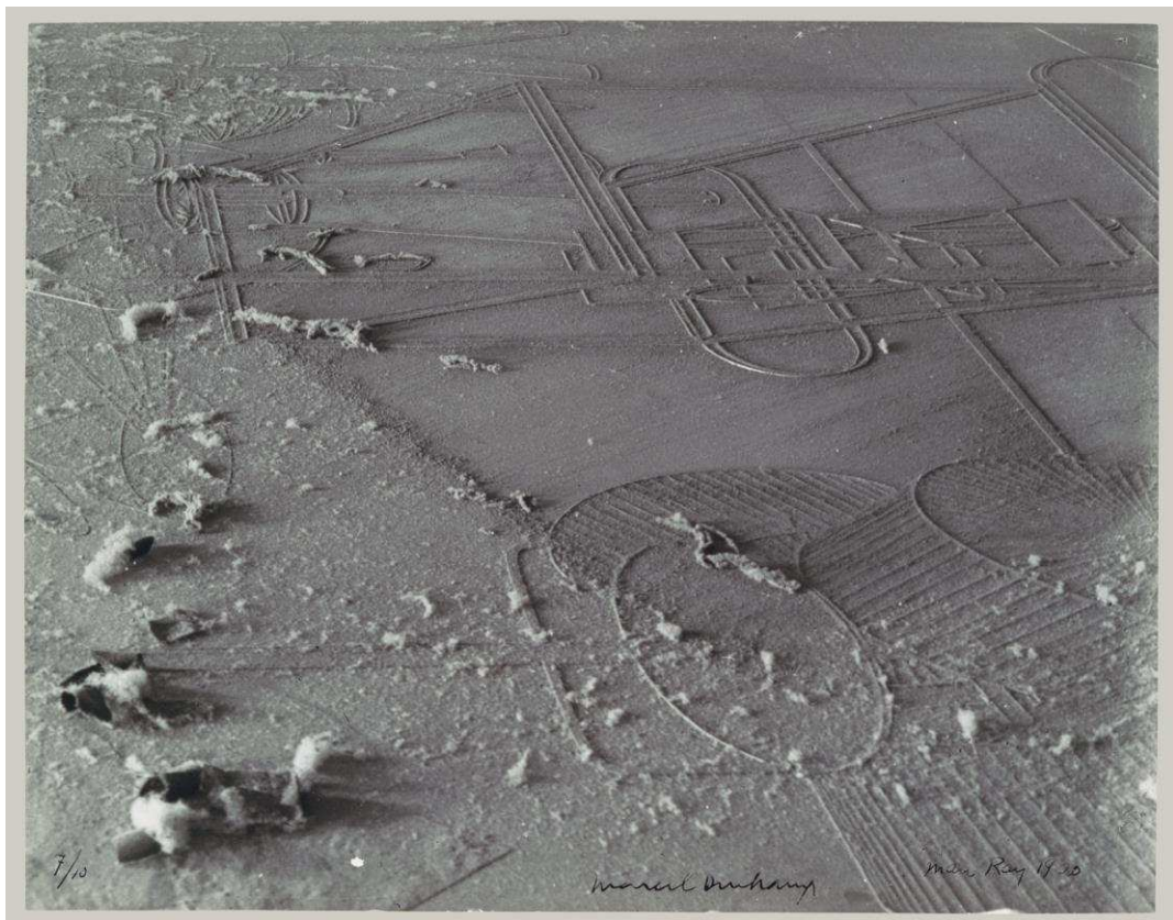
Figure 7 - Man Ray - Dust Breeding