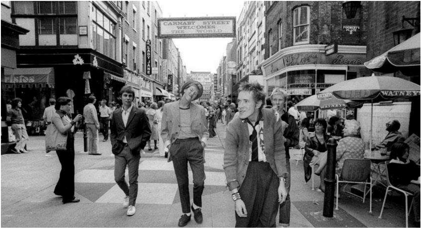
Figure 1 - Sex Pistols on Carnaby Street