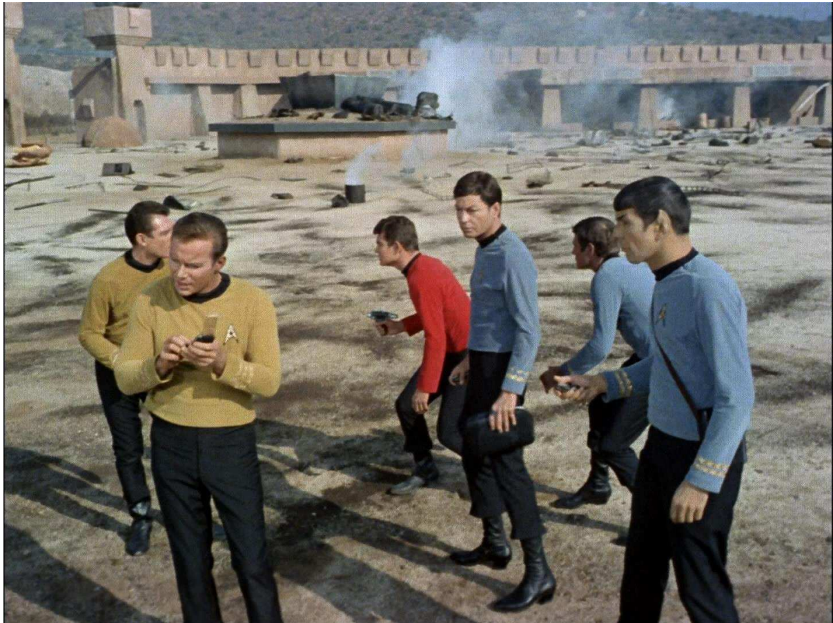
Figure 3 - Star Trek landing party

flickering between the 'taken and made.' By considering the photograph as a posed moment, something it clearly ascribes to, we question whether Stevenson is capturing the course of actual events or whether he is capturing something else. Rotten's presence becomes what Scannell (1996: 58) calls a 'performative paradox' that haunts the documentary and its impression of sincerity. 9 We have only a posed documentation (Sex Pistols invade the enemy territory Carnaby Street) that collapses into a documentation of posing. It is the latter that prevails as a useless truthfulness.