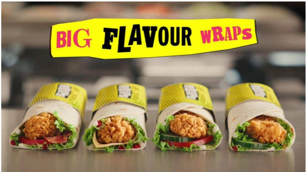
Figure 9 - Punk fonts on McDonalds products