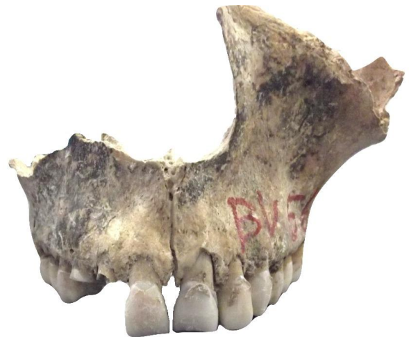
Fig. 2. Bovolone, burial 56 (T56). Calculus sampled from the labial surface of the upper incisors.

We performed a shotgun metaproteomic analysis of 9 samples of dental calculus; 6 samples from Bovolone, and 3 from Sant'Abbondio. Deposits of dental calculus were removed the tooth surface using a sterile dental scaler. Only supragingival calculus has been sampled, predominately from premolars and molars (Fig. 2), and collected in 2.0 mL tubes. We used between 1.9 and 26.7 mg of dental calculus for protein extraction.