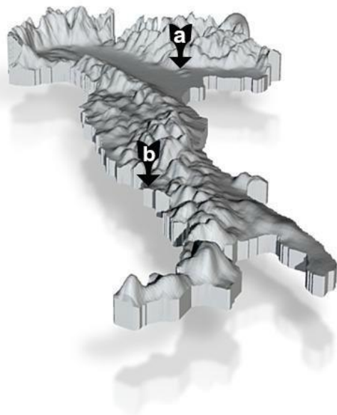
Fig 1. Location of Bovolone (a) and Sant'Abbondio (b).

Bovolone, in the province of Verona, is a Bronze Age necropolis excavated a number of times since 1876. The individuals sampled for this study belong to the excavations carried out between 1981 and 1983 concerning the Middle Bronze Age area of the necropolis [4]. 64 graves were recovered during these campaigns, 29 of which are burials.