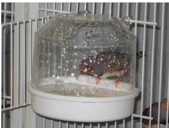
Figure 4 A zebra finch perching on the water bath

look slightly sheared or ragged. While preening, birds tidy and repair their feathers, adjusting and aligning each feather in the optimum position. Having access to bathing water encourages birds to preen which also helps to reduce the amounts of parasites on the birds, improving feather health. The flight performance of birds is also said to be increased when water is available for bathing purposes. It has been said that birds that are not able to bathe regularly are clumsier flyers compared with birds that are able to as they are more agile and find it easier to evade predators (Brilot, et al 2009). Zebra finches do not have elaborate mating rituals and therefore rely on their bright feathers to attract potential mates. Water access for bathing purposes allows males to clean their colourful feathers, which helps individuals to stand out from the competition as their feathers gleam in the hope of reproducing and passing on their genetic information. The eagerness to bath shows the finches' natural raw instinct and although in captivity they do not need to escape predators or compete for mates, it is easy to understand the drive these birds have to bathe beyond their own enjoyment.