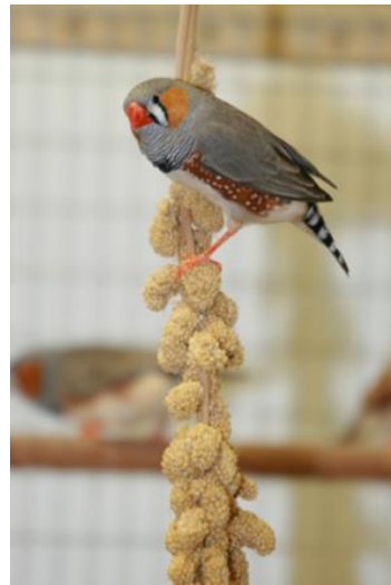
Figure 2 shows a zebra finch gripping the hanging millet

own seed, which provides mental stimulation as well as increased physical activity.