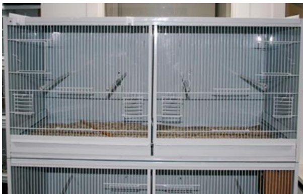
Figure 1 shows the basic recommended set up under the current 2016 guidelines

The majority of the finches at Glasgow are housed in experimental cages, although some are housed in large aviaries that allow for more social interaction and space for flight. Zebra finches are gregarious and we keep all of our finches in social groups, with a maximum stocking density of ten birds per double cage (120cm x 50cm x 50cm) and sixty birds per large aviary (2m x 2m x 2m). Our main objective when using enrichment in our cages is to create conditions that our birds can thrive in, whilst still utilising space and complying with research requirements. Within the cages we have provided a specific environment that has been evaluated on the basis of the finches' needs, allowing them to perform essential components of their behavioural repertoire.