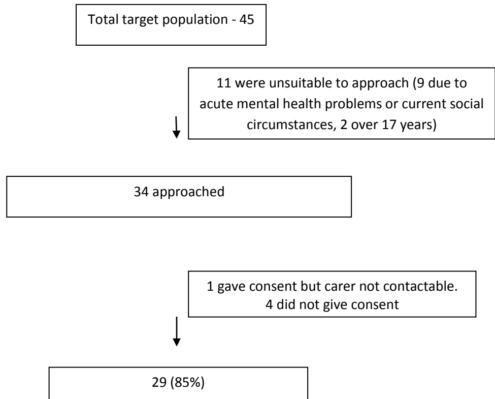
Figure 1. Flow chart of participant recruitment