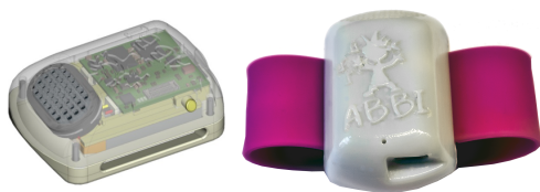
Figure 5. A render and photo of our audible beacon prototype.

We have prototyped a wearable audible beacon (Figure 5). A custom circuit and loudspeaker sit inside a 3D-printed enclosure, which has two slots so it can be attached to a wrist strap.