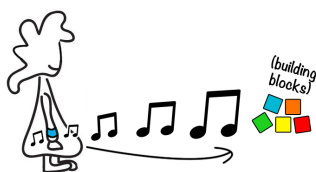
Figure 2. Amy's audio bracelet uses sound to tell her about the nearby building blocks activity, getting louder as she gets closer to them.

In this scenario, Jack's bracelet informs him when one of his friends moves to a new activity. A challenge highlighted by this scenario is using sound to help the child once he is near an item or person of interest. Once Jack is close to Sally, he may need further guidance to identify her amongst a larger group.