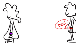
Figure 3. Jack's bracelet uses sound to help him find his friend Sally.