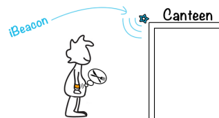
Figure 4. Michael's wearable presents sounds to tell him about nearby places in the school.