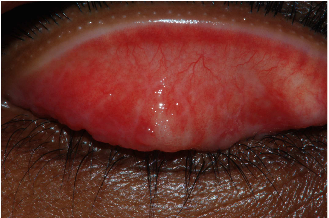
Fig 2. Conjunctival photograph of the individual felt to demonstrate equivocal evidence of conjunctival scar, Western Division, Fiji, 2015.