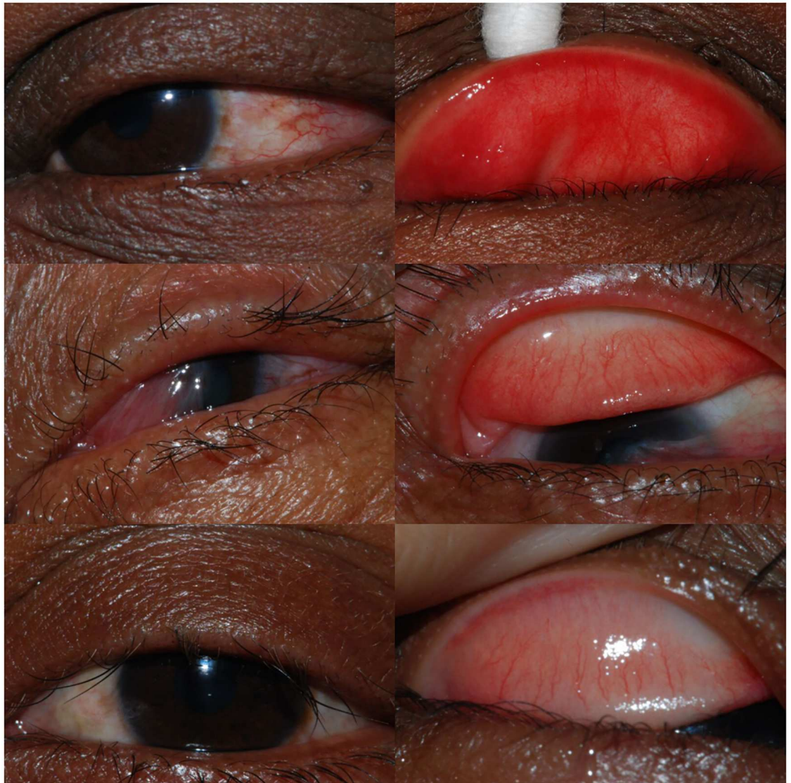
Fig 3. Front-of-eye and conjunctival photographs of individuals who removed (Bottom) 2–10 eyelashes, (Middle) >10 eyelashes (with pterygium), or (Top) most or all of the eyelashes; Western Division, Fiji, 2015.