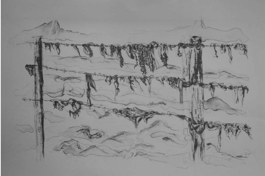
Figure 4. Drawing by Davina Kirkpatrick. “Black Rock” 2014.

been recorded in words, drawing and photographs as an ongoing body of work addressing mourning and remembrance 13 . Here again there is a sense of letting grief wash away in the ever changing flows of the tides and the striking atmospheres of the estuary.