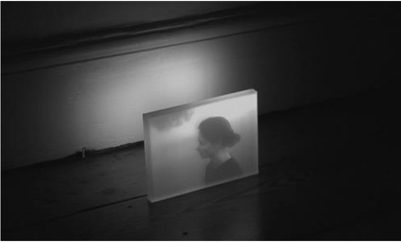
Figure 8. Bore Song . A still of the projected image on glass. (ibid)