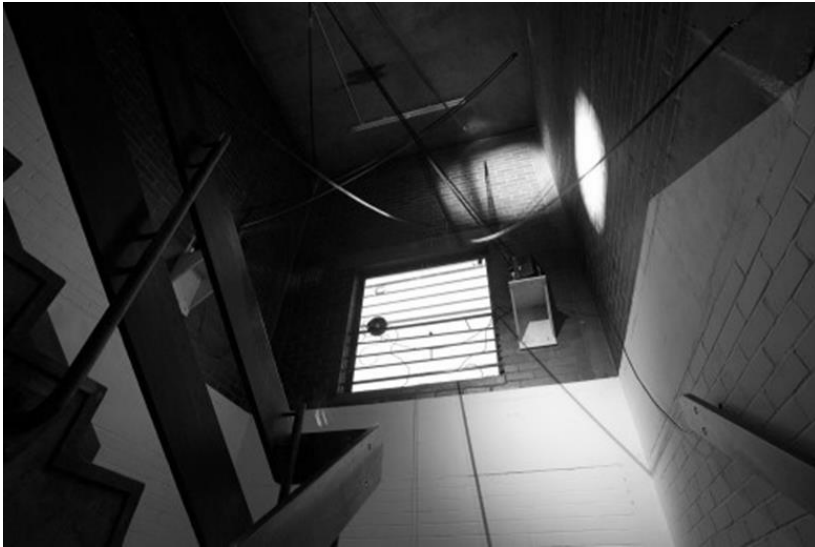
Figure 10. Can People See Me Swallowing? - a film for a stairwell, Spike Island. (Louisa Fairclough 2014).

The films loops running through the projectors were mainly black, with projector light emitting through clear sections when a few sung words punctuated the mute film. With a single sung phrase on each length of film, the voices fell together in harmonic clusters. At moments there was only the whirr of film projectors humming in the throat of the building (Figure 10).