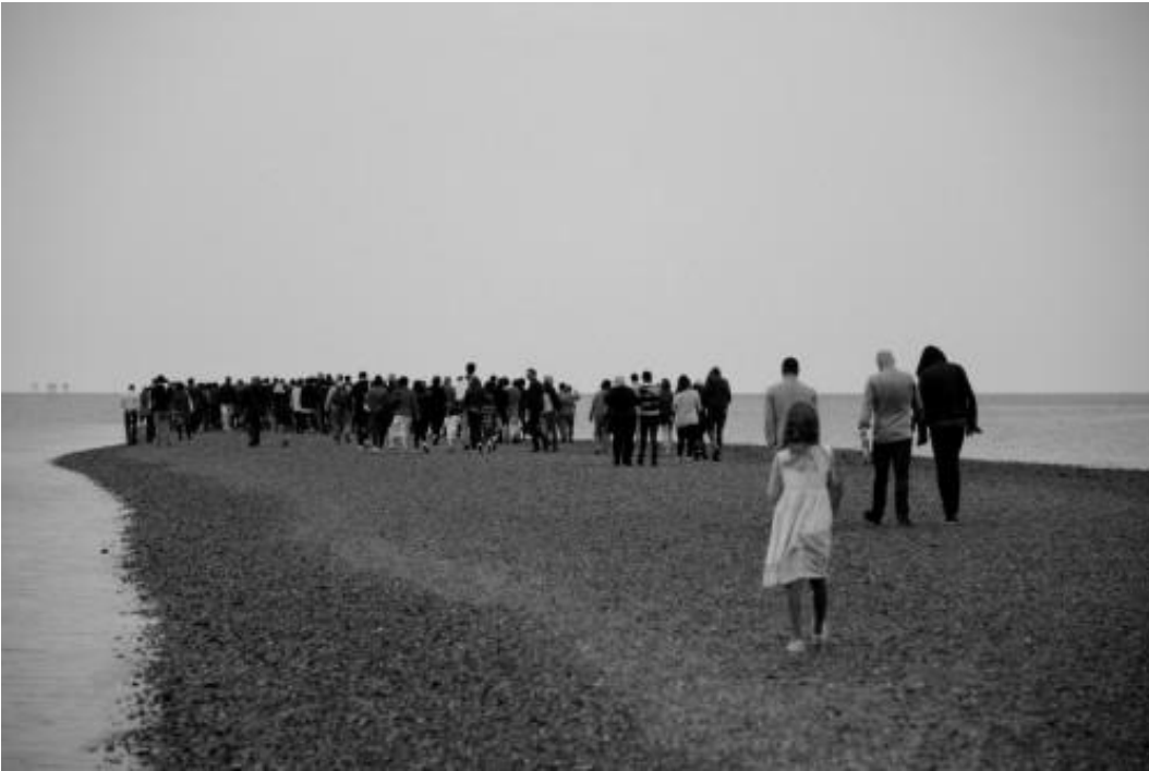
Figure 12. Compositions for a Low Tide; Louisa Fairclough (2014).