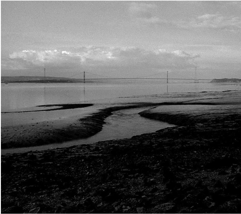
Figure 2. The Mid Estuary with Severn Road Bridge. (Owain Jones; circa 1978)

As it has such a high tidal range, with the sea level rising and falling as much as fourteen metres at the perigee spring tides which occur at the equinoxes, the whole estuary, in geomorphological, ecological and cultural terms, is particularly dynamic. Approximately 80% of the estuary's 370 km shoreline is lined with sea walls (regular, grassed earth banks in rural locations; concrete walls in ports and towns). These stop the very highest tides flooding low lying surrounding land and settlements. These sea walls are, in many places, open access and used for recreational purposes, the route of long range footpaths (The Severn Way), and accessing (here possible) and viewing the intertidal areas more generally.