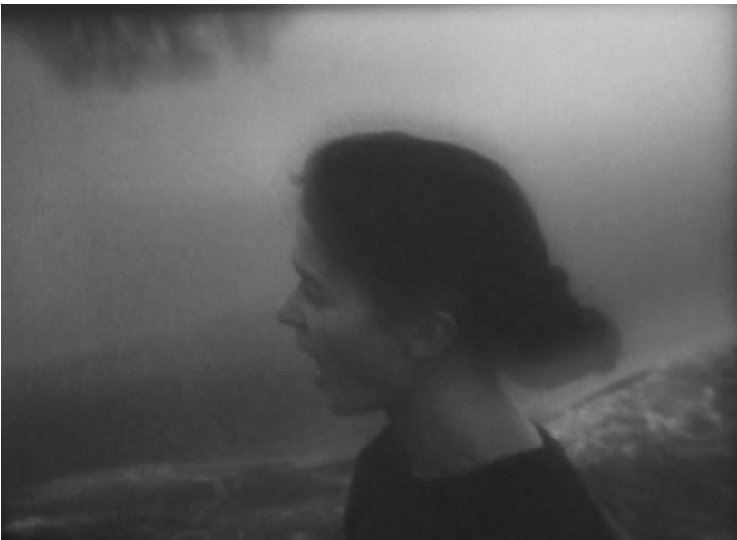
Figure 9. Bore Song . The cry (by the river), which repeats as the film loop cycles. (ibid).

The film loop is the exact length of a single take on a clockwork Bolex camera (28 seconds/ 16ft). Approaching Bore Song you initially hear the approach of water and the woman's call. You hear this before seeing the film image that seems almost contained within the glass drawing the viewer down to a crouching position.