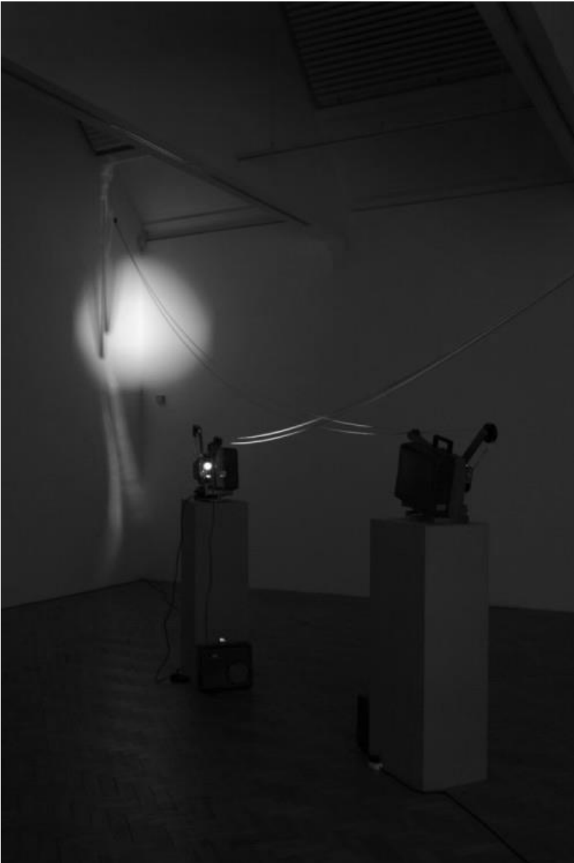
Figure 5. Song of Grief ; the projector's running film loops.

Poet and critic Cherry Smyth describes, Song of Grief