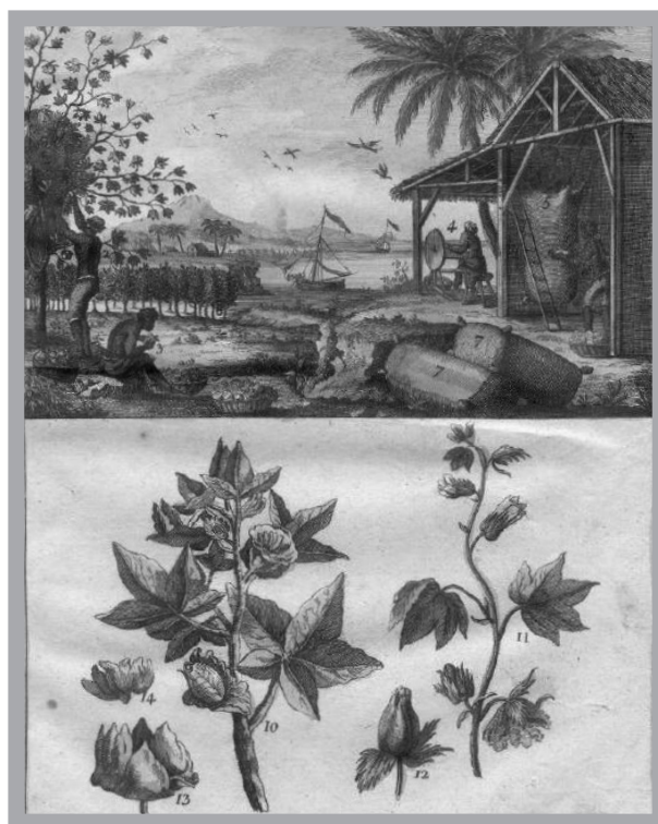
Figure 4. 'Coton', plate VIII of plate from M. Chambon, Le commerce de l'Amérique par Marseille (Avignon, 1764). Private collection.