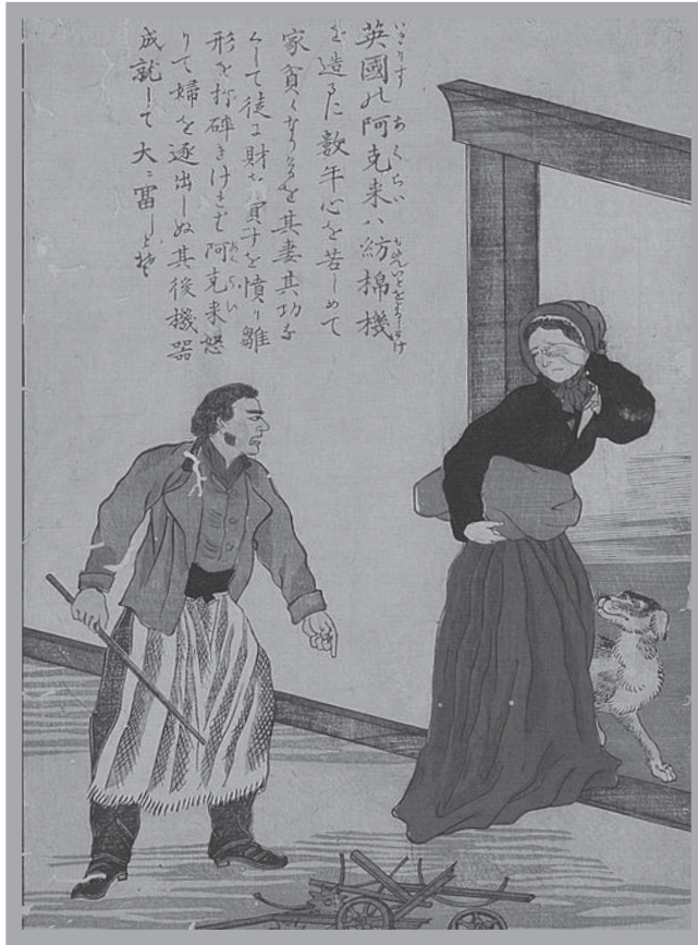
Figure 1. Sir Richard Arkwright, inventor of the spinning machine, second half of the nineteenth century. Chadbourne collection of Japanese prints, Library of Congress. hōsho paper. LC: FP 2 - Chadbourne, no. 30.

Seeing him wasting money without success, driven by the anger, his wife broke a scale model. Arkwright got so mad at her that he kicked her out of the house. After that event, he successfully invented the machine and made fortunes on it.” 4