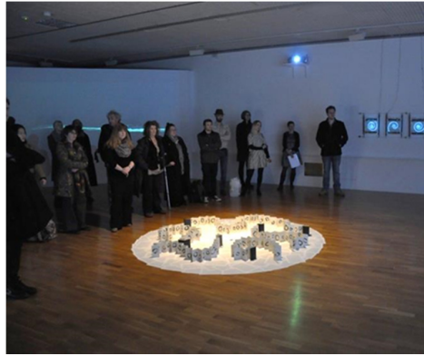
Fig 4. Opening night of Trace. Exhibition.