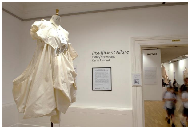
Fig 6. Insufficient Allure (2012) exhibition by Kevin Almond and Kathryn Brennand.

Other groups to draw on the ROTOЯ experience have included local performance dance groups, which have incorporated exhibitions into their performances. ROTOЯ also collaborated with Kirklees Library to disseminate exhibition content, leading to new book purchases and increased lending. Kirklees Library assistants reported a 50% rise in borrowing for the books selected for the ROTOЯ reading group, including some that were rarely borrowed previously, noting, “[ROTOЯ] has been very positive [...] It brings the University into a different space.”