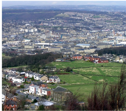
Fig. 1. A view of Huddersfield Town from Castle Hill.

Surrounded by countryside and with a population of approximately 146,000 and rising, Huddersfield in West Yorkshire, England, is the 11th biggest town in the country. With its rich vista of historical architecture, much of which dates back to the early 19th century, it boasts the third highest number of listed buildings in the country after Westminster and Bristol. In 1845 Friedrich Engels described Huddersfield as “the handsomest by far of all the factory towns in Yorkshire and Lancashire by reason of its situation and modern architecture”, and more recently the Guardian newspaper described it as “the Athens of the north” (The Guardian, 2004).