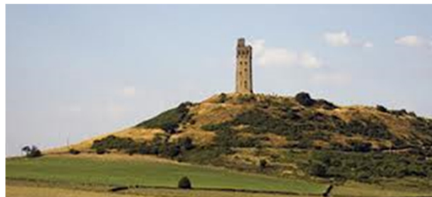
Fig. 2. Looking out towards Castle Hill from the town.

Despite the idyllic image depicted here, Huddersfield suffers from its share of problems. Relative to other UK towns of a similar size it suffers from high levels of deprivation, including significant income deprivation, high levels of health and mental health problems and is lower than average for education and skills. The wider borough of Kirklees is one of the 50 most disadvantaged local authorities in England (of approx. 433 boroughs) in terms of income and employment.