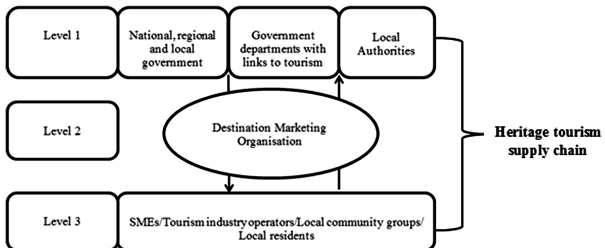
Fig. 1. Heritage tourism supply chain.

The HTSC can be viewed as a hierarchy of three levels of management, as depicted in Fig. 1. Public sector bodies exist at Level 1, and are tasked with a range of responsibilities including providing strategic direction (Kerr, 2003; Vernon et al., 2005; Wray & Cox, 2011), a range of facilities, and executing strategic marketing functions, including destination level promotion and product development (Greenley & Matcham, 1983; Korzay & Alvarez, 2011; Vernon et al., 2005). Tourism products and services are delivered largely by private sector businesses (Komppula, 2014) operating at Level 3, within the strategic framework set out by public sector bodies. These businesses provide the elements of operational visitor servicing required (Gilmore et al., 2007; Greenley & Matcham, 1983) and need to be interdependent and complementary (Komppula, 2014). The firms operating at Level 3 must operate in conjunction with the public sector in order to provide a viable, holistic and streamlined service product (Bornhorst et al., 2010). Operating between these two levels is the quasi-public/private sector level, Destination Marketing Organisations (DMO), that create a link between Level 1 and Level 3 and are recognised as