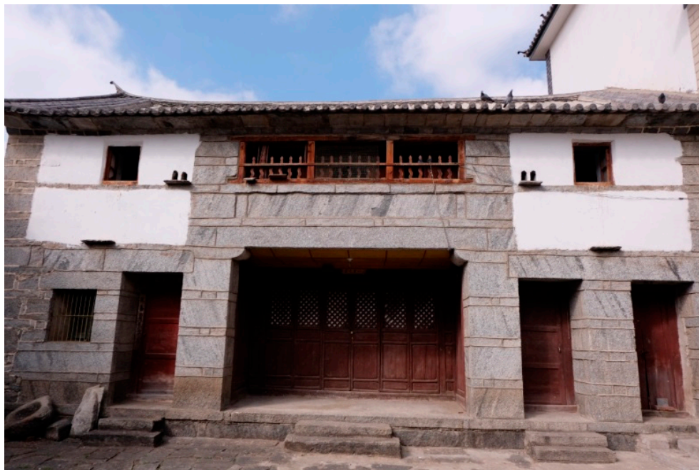
Figure 9. Home of the stone mason.

The third generation houses generally used machine processed stone, though some new houses used bricks. Windows had wooden window shutters made according to traditional crafts and well-known in the Jianchuan region of Dali as shown in Figure 10. The internal garden incorporated timber pavilion forms from the central part of China, with high raised roof eaves similar to those in the traditional gardens of Suzhou in Central China as shown in Figure 11.