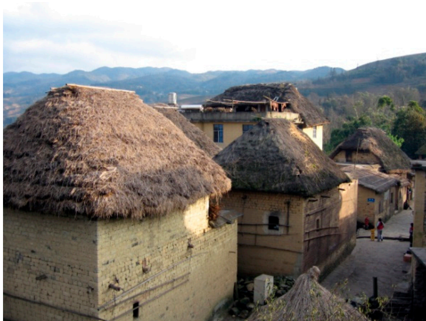
Figure 4. Hani traditional mushroom house in 2001.