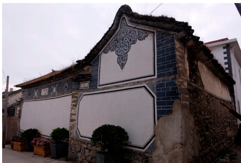
Figure 8. Second generation of stone house, built between the 1930s and the 1970s according to villagers.