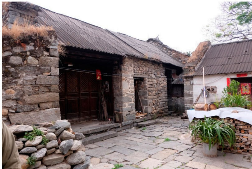
Figure 7. First generation of stone house, built in the 1930s according to the villagers.

The first generation of dwelling houses were built with irregular stones. The majority of these houses were derelict when the author visited in 2016, some were waiting to be demolished to give space to new buildings as in Figure 7. The second generation had raised floor to ceiling heights and were two-story buildings. The stone walls were painted with white and black decorations on the wall, incorporating the influence of the Bai ethnic groups in the region as in Figure 8. Stone materials for those houses were processed manually before modern machinery became available. The textures on the blocks were widely recognized as resulting from valuable hand making crafts, much more appreciated by the villagers than machine-processed blocks that have become prevalent in recent years. The length of the stone block determined the sizes of the buildings and openings. A typical example was the house by the stone mason in the village which demonstrated good proportion of the ground and first floor heights for different functions and the appropriate proportions of the window openings, as shown in Figure 9.