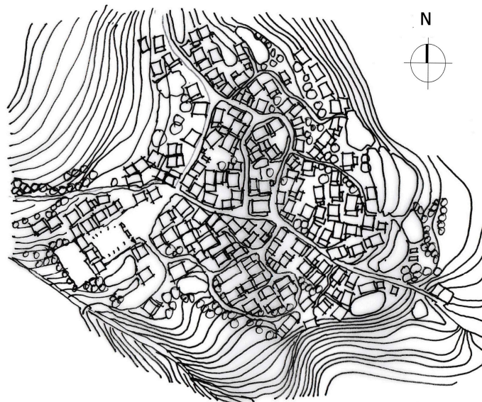
Figure 2. Qingkou Hani village plan in 1999.

The villages are built on the sun-facing side of the mountain. Houses in a village generally have the similar orientation, and are densely built on either side of the narrow lanes, following the topography of the site. Each village traditionally has its own village gate, water wells, and sacred cemetery. Before the 1960s, public wells served as the most important social communication space, but since the 1990s, the central square, developed for public activities in most villages, has increasingly become the main gathering space for the villagers. A village plan can be seen in Figure 2.