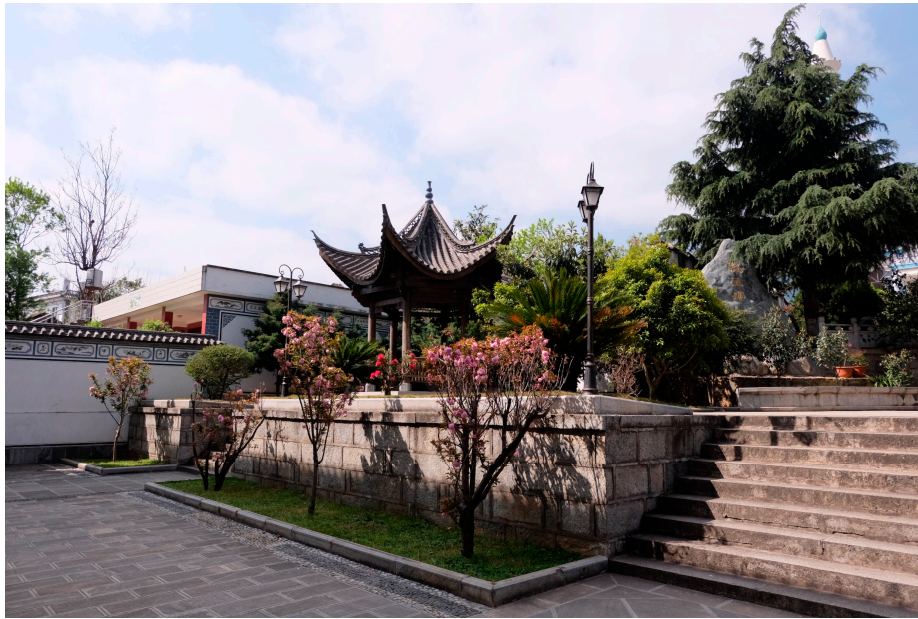
Figure 11. Pavilion in Nan Wuliqiao village.

All these different house types co-existed, although villagers considered the new concrete houses as representing advanced contemporary life. Nevertheless, the appreciation of the craftsmanship involved in stonework still held importance, and stone rather than concrete was used for the main gates of the village, and wooden carved window shutters were fixed in front of the glazing. The village also has houses designed by architects using craftsmanship from other parts of the region. The local regulations for controlling the height of the houses were generally followed. Some innovative methods were explored by the villagers themselves, such as using new balconies attached to the first floor that enabled movement of the staircase to the outside in order to enlarge the internal space and to separate the circulation space from internal rooms as shown in Figure 10.