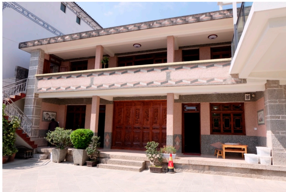
Figure 10. A traditional house being converted to a restaurant in 2010.