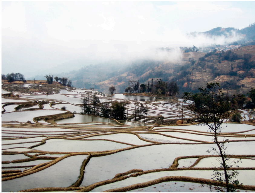
Figure 1. Hani village in the terraced rice field.

The villages are built on the sun-facing side of the mountain. Houses in a village generally have the similar orientation, and are densely built on either side of the narrow lanes, following the topography of the site. Each village traditionally has its own village gate, water wells, and sacred cemetery. Before the 1960s, public wells served as the most important social communication space, but since the 1990s, the central square, developed for public activities in most villages, has increasingly become the main gathering space for the villagers. A village plan can be seen in Figure 2.