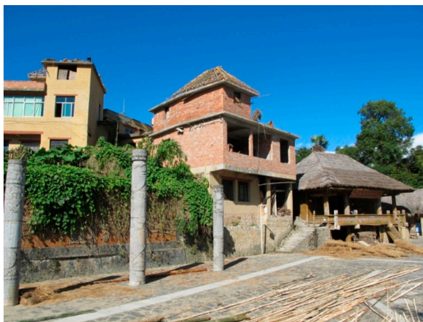
Figure 5. Brick and concrete houses in village in 2013.

Annual ceremonies are still held at the village gate, by the oldest well, and for the ancestors of the clans. Their beliefs are reflected in their understanding of the ecological system in which humanity's serenity and happiness relied on the harmonious relationships among individuals and the supernatural spirits, and with the surroundings. There has been no fundamental change in relation to this belief, despite increasing availability of new house construction materials and technologies.