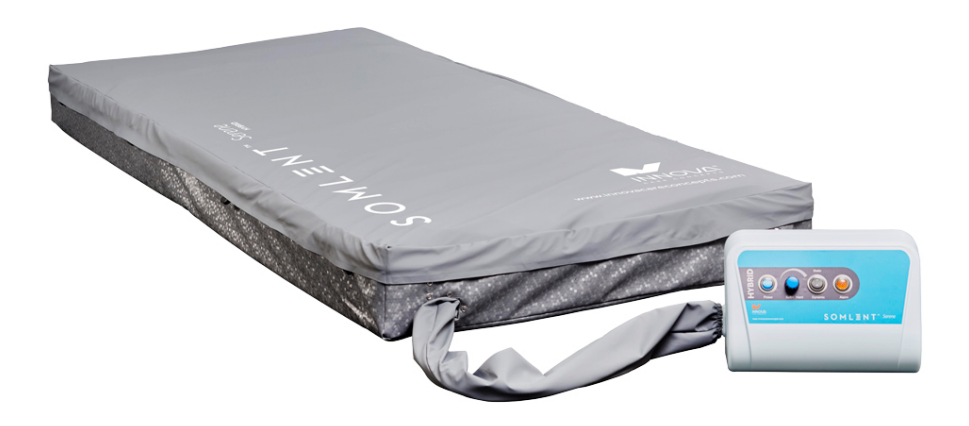
Figure 2: The foam and air cells of The Solment Serene