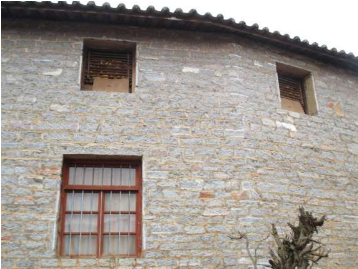
Figure 12. Nuohei maize storage on upper floors.

Turning to the buildings themselves, in contrast to the traditional adobe buildings of Damoyu, they are constructed from stone set in many different patterns. Figure 13 shows a collage of styles, including both stones and bricks, which can be seen walking along the main street of the village. The majority of buildings are in a good state of repair, though it is also clear that some maintenance is required in a number of cases. Many buildings also make use of timber and other materials, as well as, of course, glazing. There is no clear evidence of the use of modern insulation materials. Those buildings constructed using similar adobe materials to those of Damoyu seem to be in a poorer state of repair than those constructed from stone. There also seems to be an increasing use of concrete blocks for construction, particularly for the agricultural buildings.