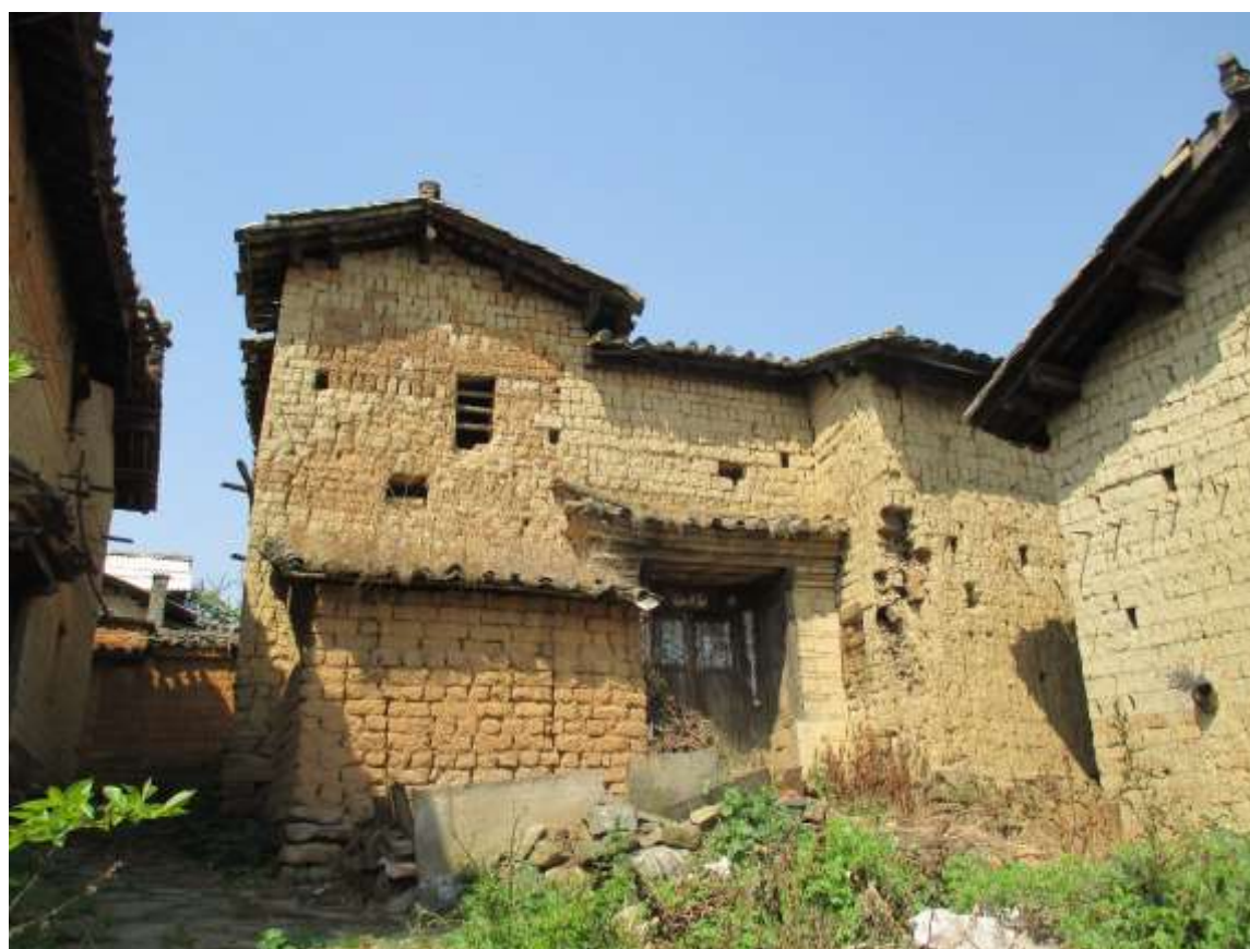
Figure 7. Damoyu deteriorating building.