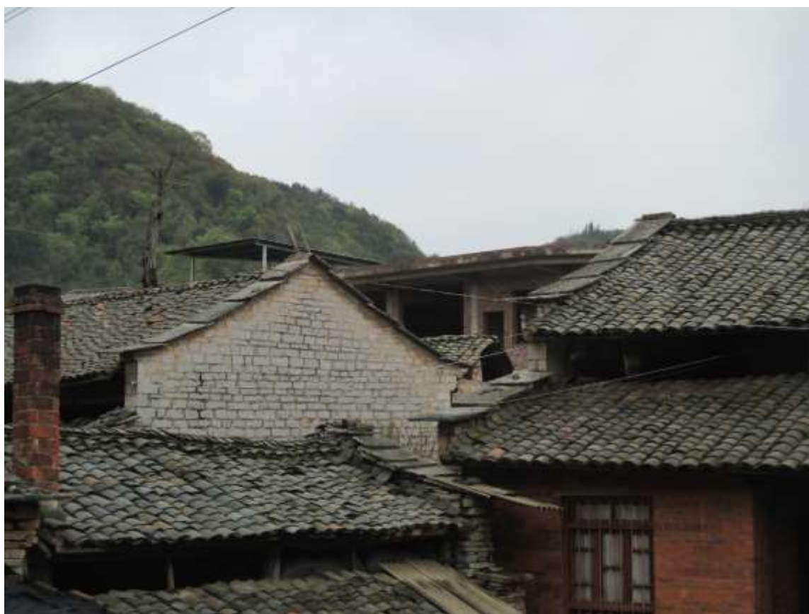
Figure 10. Nuohei traditional stone dwellings.