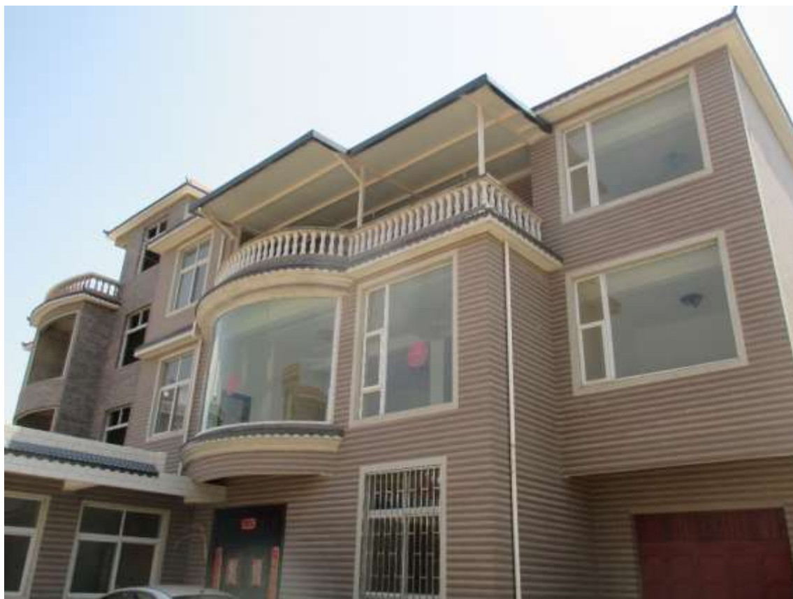
Figure 4. Damoyu new construction dwelling.