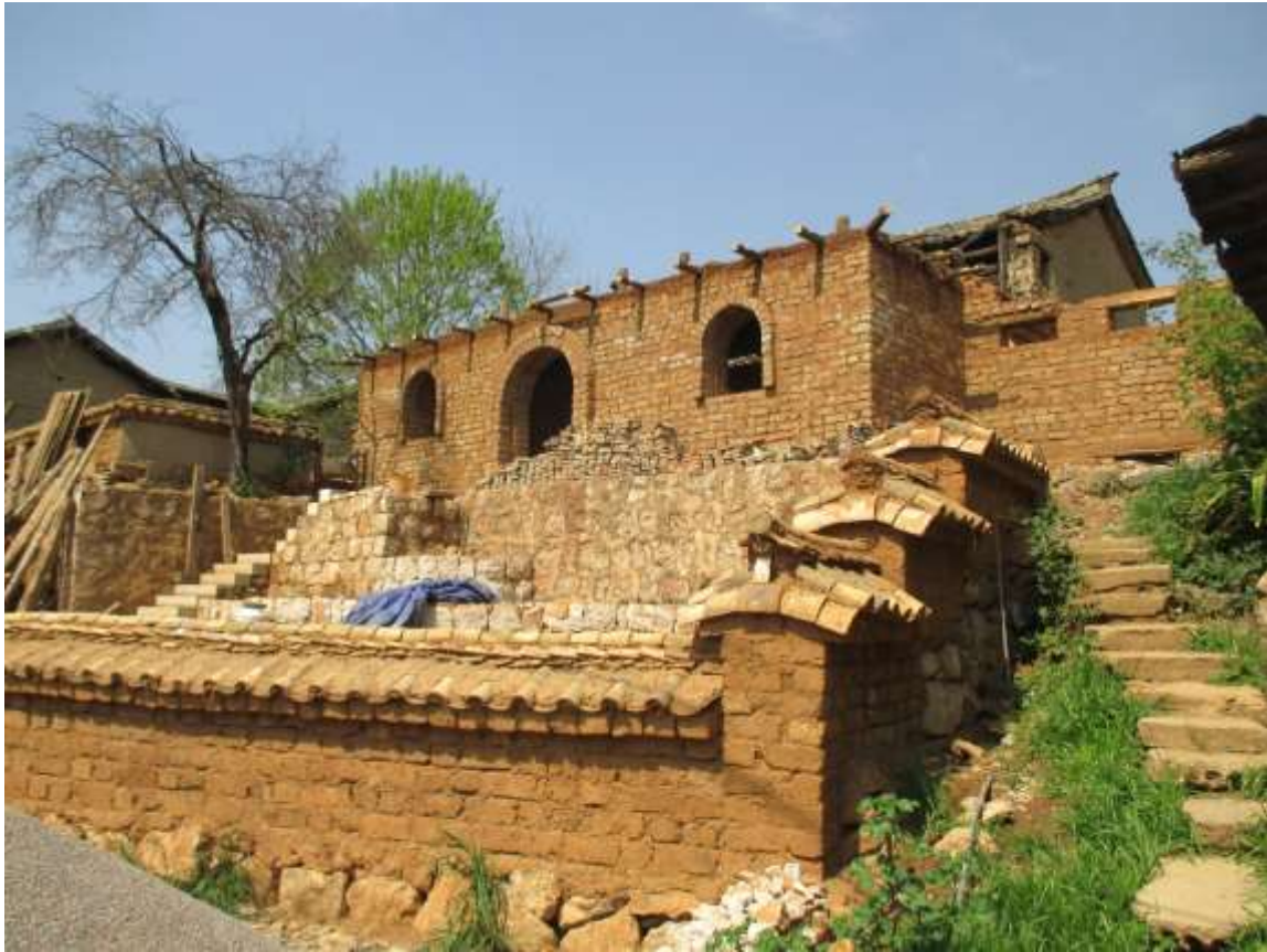
Figure 8. Damoyu building renovation project.