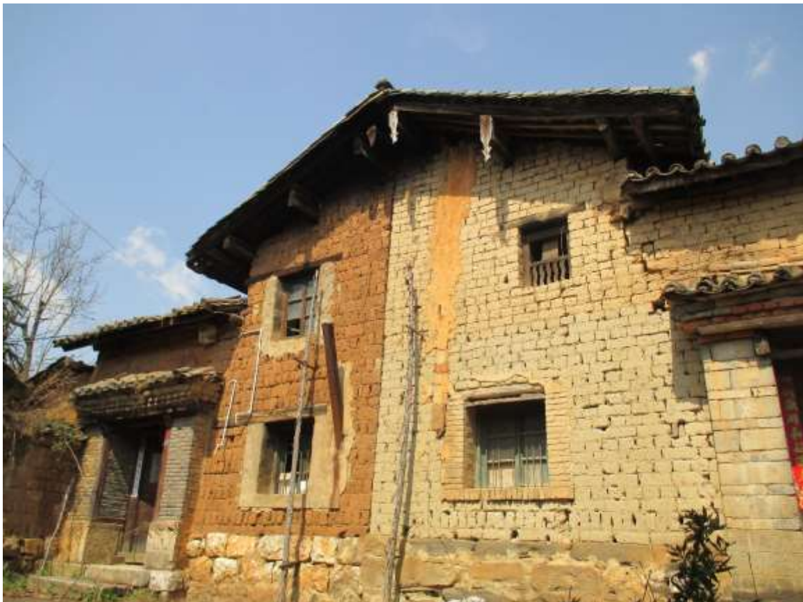
Figure 3. Damoyu traditional construction dwelling.

Analysis of the traditional buildings shows internal layouts to have the majority of windows and openings facing in one orientation. The majority face to the east given the slope of the land and towards the main surfaced roads through the village. Many of the new dwellings face from the other side of the road towards the west and have rather more windows. The use of modern materials of concrete and bricks seems to have promoted the adoption of large glazed openings in a number of cases, also clearly seen in Figure 4. From the on-site survey of both new and old dwelling construction, it appears that improvements to performance might be found relatively easily if more attention were focused on window positioning, size and function, taking account of exterior features and the internal space needs.