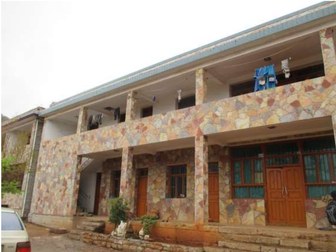
Figure 14. Nuohei modern building.