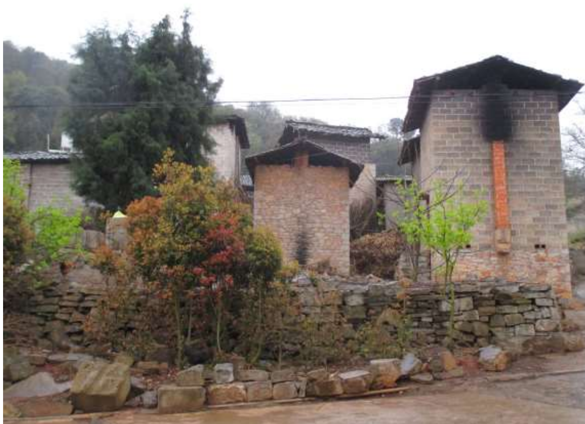
Figure 11. Nuohei tobacco drying towers.