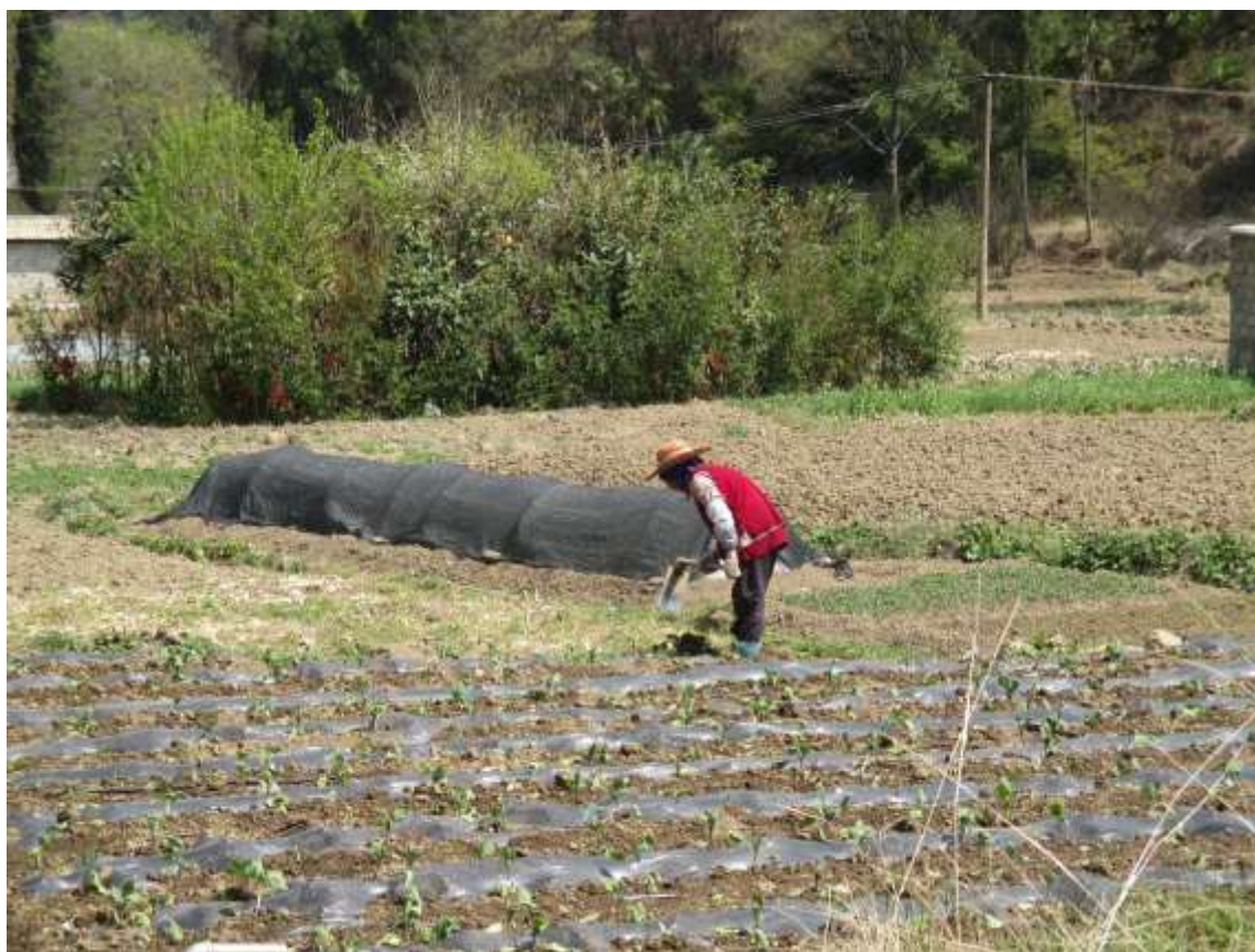
Figure 6. Damoyu older resident working the agricultural land.