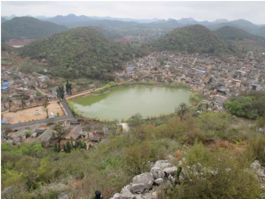
Figure 9. Nuohei: view of the village.

The village is prosperous with places to eat and buy products, as well as places to stay, each of which are advertised on the posters in the main car parking area and on numerous signs through the village in both Chinese and English. There is a propensity of motorized transport (though many vehicles are those designed for agricultural purposes), and there is a thriving village school. The village emphasizes traditional development focusing on preservation; it follows strict guidelines for the protection and management of intangible cultural heritage and of the environment. It was declared a region for the protection of the Sani Yi culture by the state in 2006.