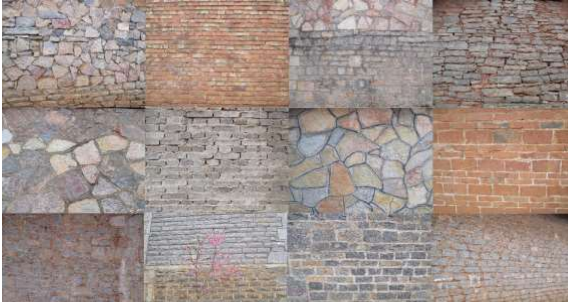
Figure 13. Nuohei: collage of twelve different wall constructions.