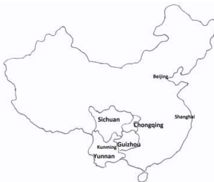
Figure 1. Map of China showing the provinces of interest, including Yunnan.

The focus area for the larger research study of which this paper reports a part is southwest China, the provinces of Yunnan, Guizhou and Sichuan. Also associated is the city of Chongqing and its environs (which is currently one of China's four centrally-controlled municipalities, but which was formerly part of Sichuan). The outline of the location is shown in Figure 1.