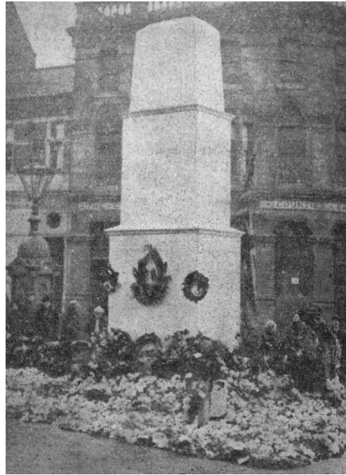
Figure 1. The temporary memorial in Market Street, 1919.

A stone memorial cross was erected outside St Barnabas church after the war 12 but that church was destroyed by fire in 1949 and the memorial tablet was placed in the new church built soon afterwards. A stone cross 23-feet high and mounted on an octagonal base stands in the churchyard of All Hallows. The calvary was donated by a Mrs Sotheby but a public appeal was needed to fund the addition of two gates, the laying of paths and planting. 13 It