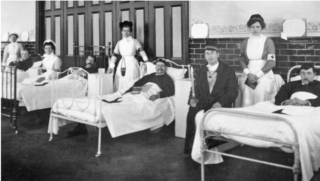
Figure 3. Soldiers recovering in the VAD hospital at Wellingborough.