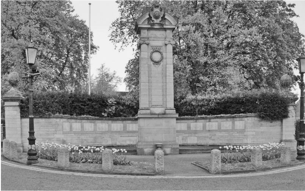
Figure 2. The memorial at Broad Green.

does not list individual names but carries the inscription, ‘Pray for the gallant men who from this town gave their lives for truth and freedom in the Great War 1914. Invictus Pax’ (peace to the unconquered). A movement to erect a cross in the churchyard of St Mary’s was abandoned due to an inadequate response to a public appeal. 14 Church authorities decided instead to place a roundel of coloured glass within a circular wreath of palm. St George is shown on a white horse transfixing a green dragon with the inscription, ‘Dedicated by the people of this parish to the memory of the men who laid down their lives in the war 1914–1918 whose names are inscribed below.’