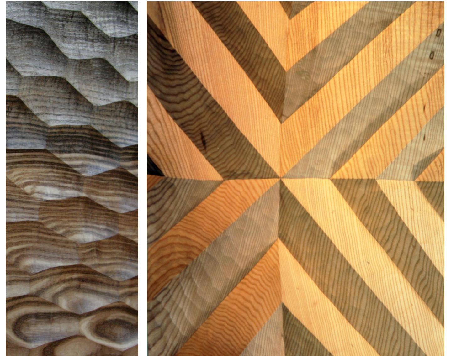
Details of work by Nick Barberton.

My vessels have grown bolder, more African, my shapes geometric, often wall art rather than fruit bowls. The patterns that I impose have their own conversation with the grain of the wood. Sometimes I will turn the wood to define the form faster, use an angle grinder on a gimbal to speed up roughing out. I enjoy seeing how the gouge handles the knot, backing off and trying it from a different angle. Light is just as important as wood and easier to carve. I enjoy the workmanship of risk.