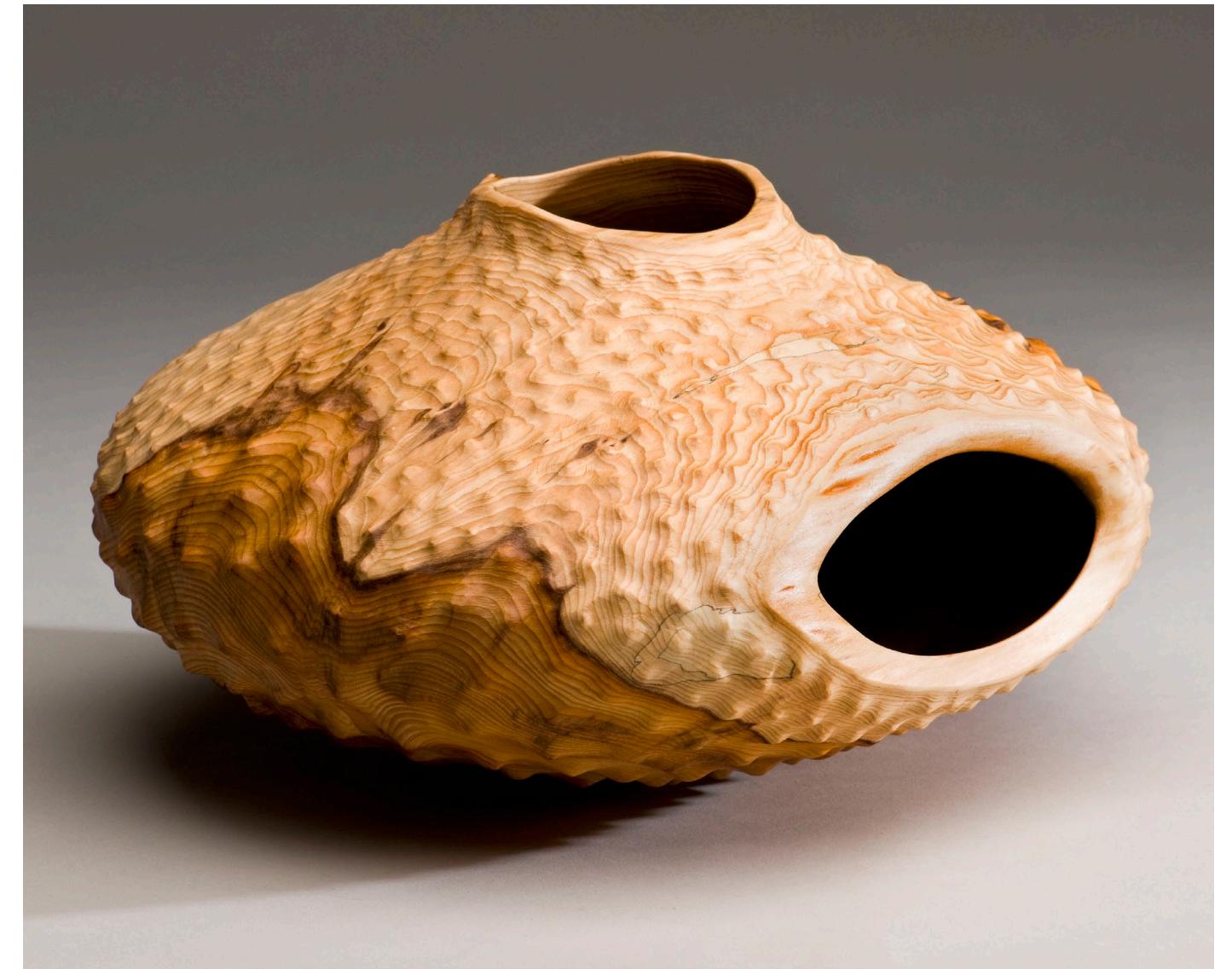
Work by Eleanor Lakelin.

I like the immediacy of this way of carving. The pieces are held in the lap with an idea in mind but there is no design sketched on the wood. The tool allows me to sketch a free-hand texture, to make marks in response to the shape and material. The irregularity is intentional. There is a consistency of pattern as in nature but there is also the possibility of something unexpected developing – the chance that a texture may change as work proceeds. The striations are not universally sanded out and on some pieces deliberately left to add to the layers of texture from pattern to grain.