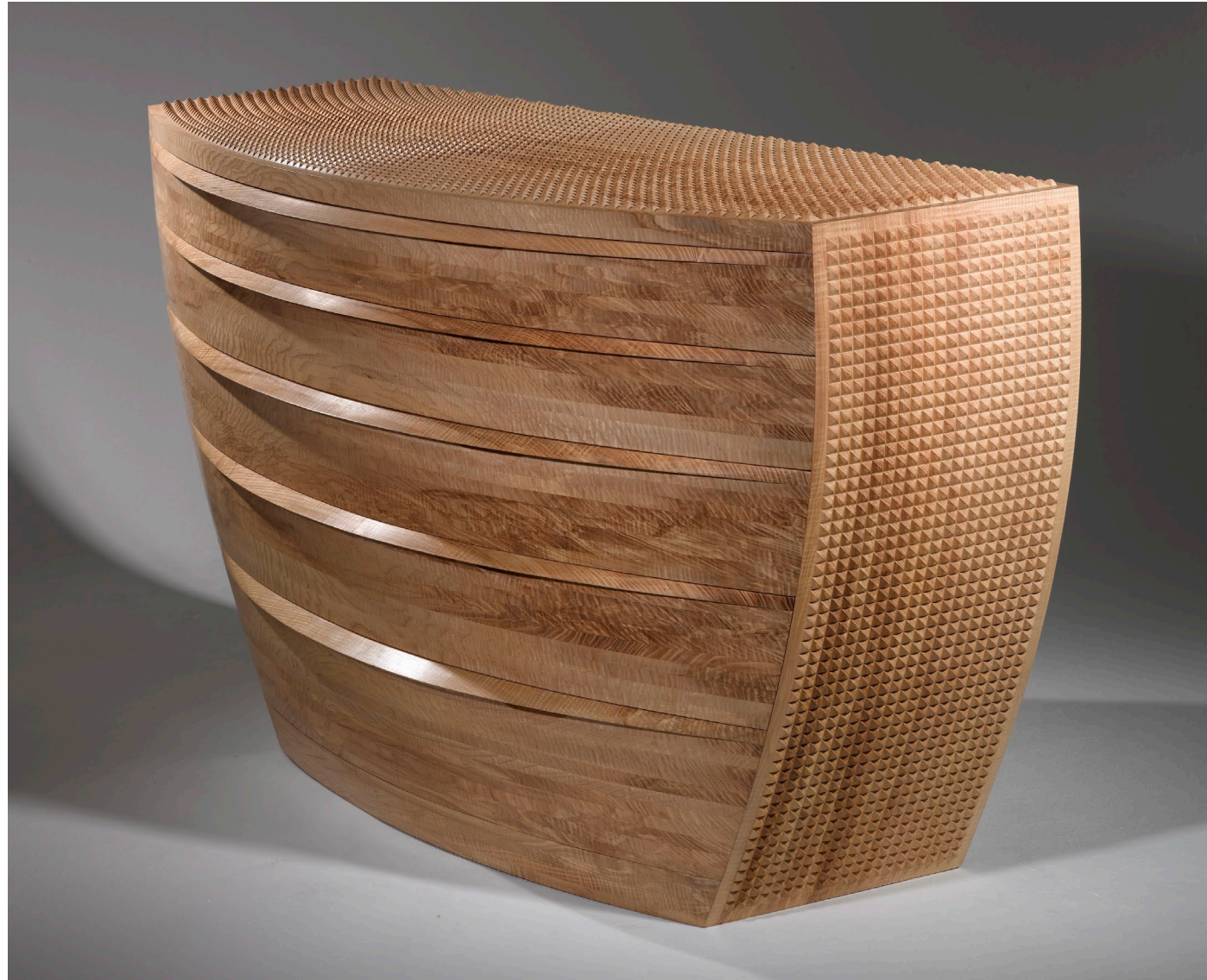
Pyramidalised Dresser by Matthew Burt.