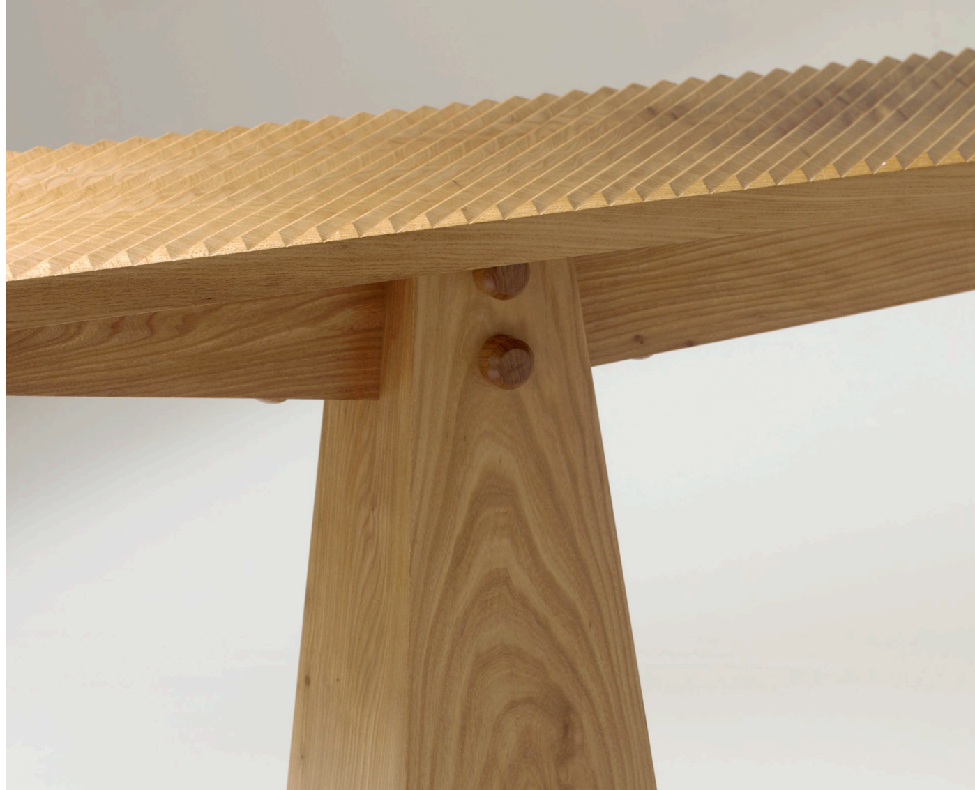
Matthew Burt Canti-11 table, Crafts Study Centre collection.

do not recognise such a narrow definition, they explore conceptual ideas through making prototypes or by experimenting with materials: for them legitimate acts in their own right.