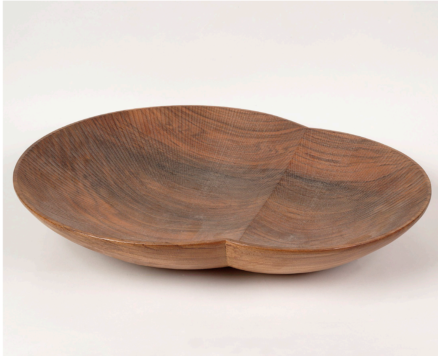
David Pye bowl, Crafts Study Centre collection.