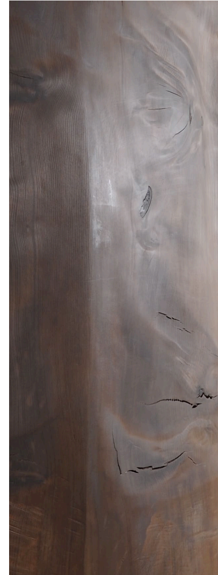
Senser - Cedar of Lebanon, Keith Rand.

downlands and living within a naturalised garden he would gather grasses, leaves, petals and seeds to draw and study. The breakthrough came as he started to work with lime wood and other fine-grained woods. The bulk of timber was removed using chainsaws, followed by weeks or months of hand carving and surface finishing, often using tools that he made or adapted for the purpose. He developed a way of carving very thin sections that continually change in cross section through the different planes and which he was able to interlock. Keith created sublime semi-figurative sculptures redolent of plant and landscape features - purely by carving.