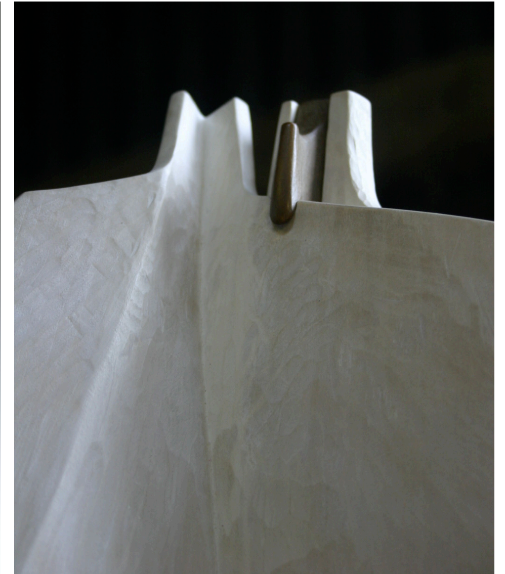
Work by Keith Rand. Left: Lamina Blue (detail) . Right: Anvil Ivy (detail) .