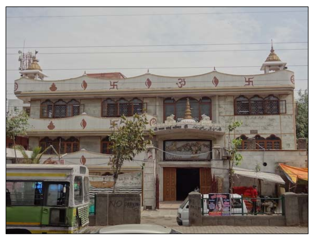
Figure 3: The Lal Sai Sindhi temple in Lajpat Nagar

The UNHCR would hold its open meetings with the Afghan refugee community in the large hall that comprised the top floor of the temple.