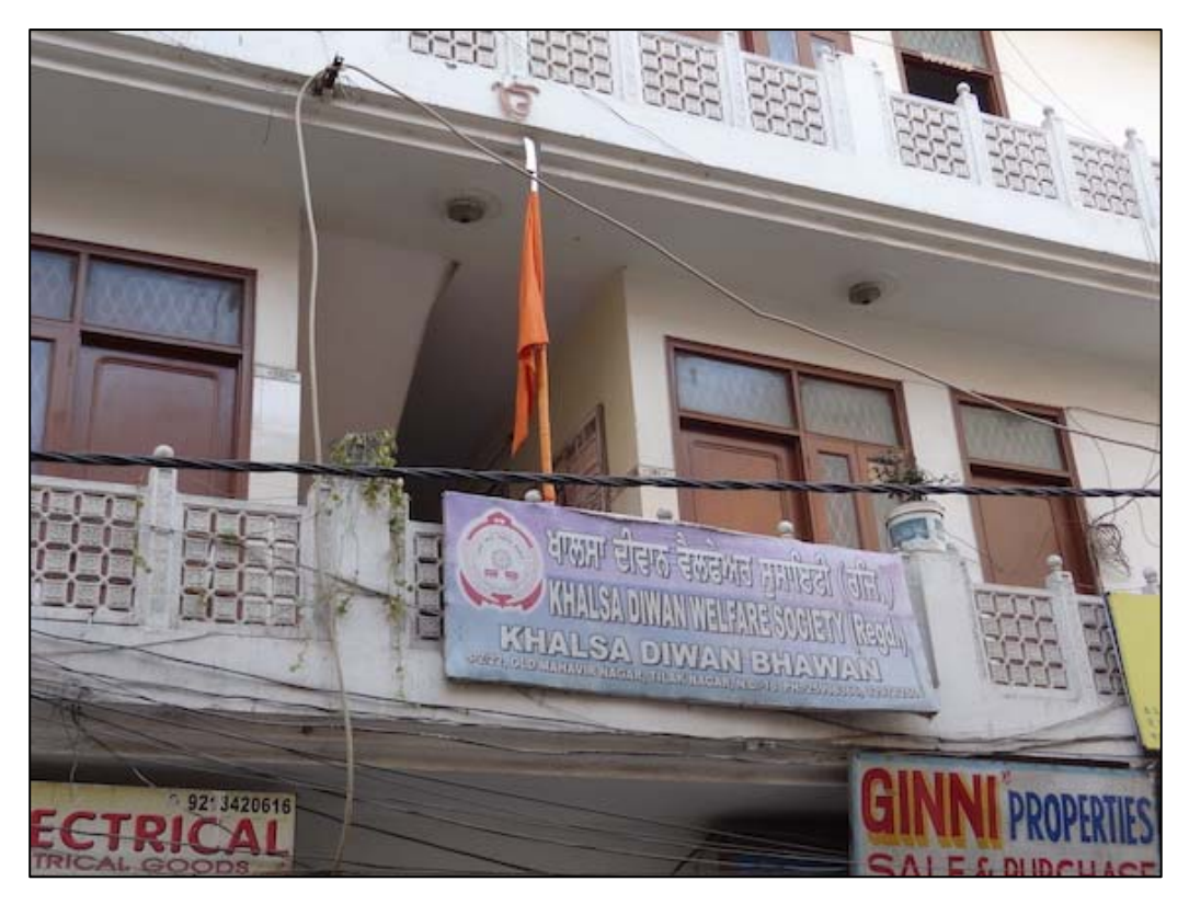
Figure 1: Offices of the Khalsa Diwan in West Delhi