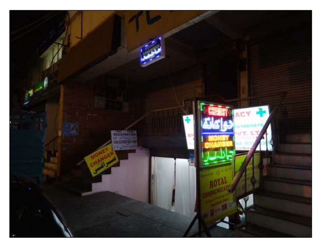
Figure 7: Lajpat Nagar Shops Catering to Afghans

An artist paints a sign in Persian from left to right.