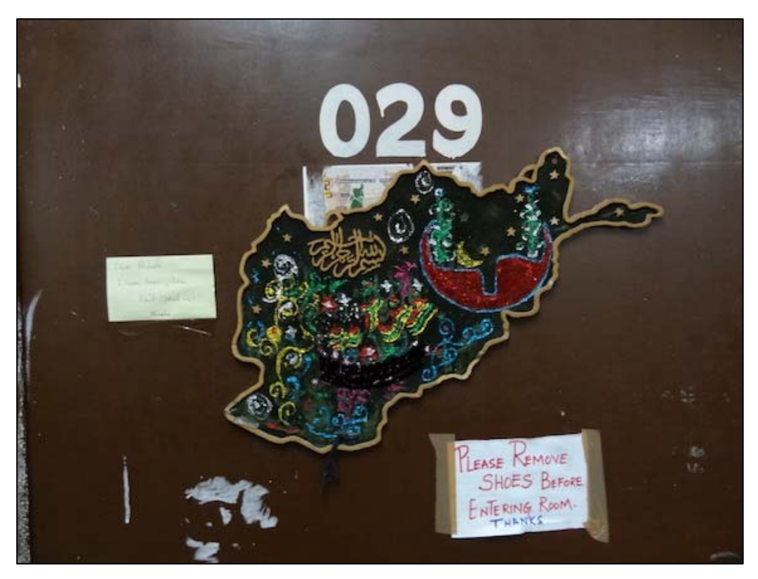
Figure 4: Ali's Door Decoration

The plastic cut out in the shape of Afghanistan with the basmala is adorned with glitter. I have removed Ali's name from the centre of the sign.