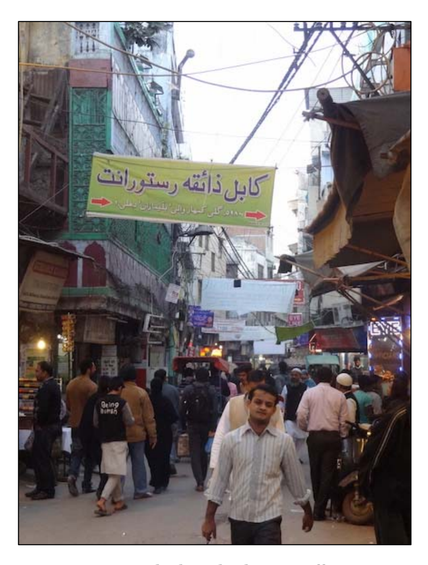
Figure 6: Street Scene Outside the Sohrab Press Offices

Above the busy main artery of Ballimaran, a sign advertises the nearby "Kabul Zaeqah" restaurant, a competitor to Yusuf's restaurant.