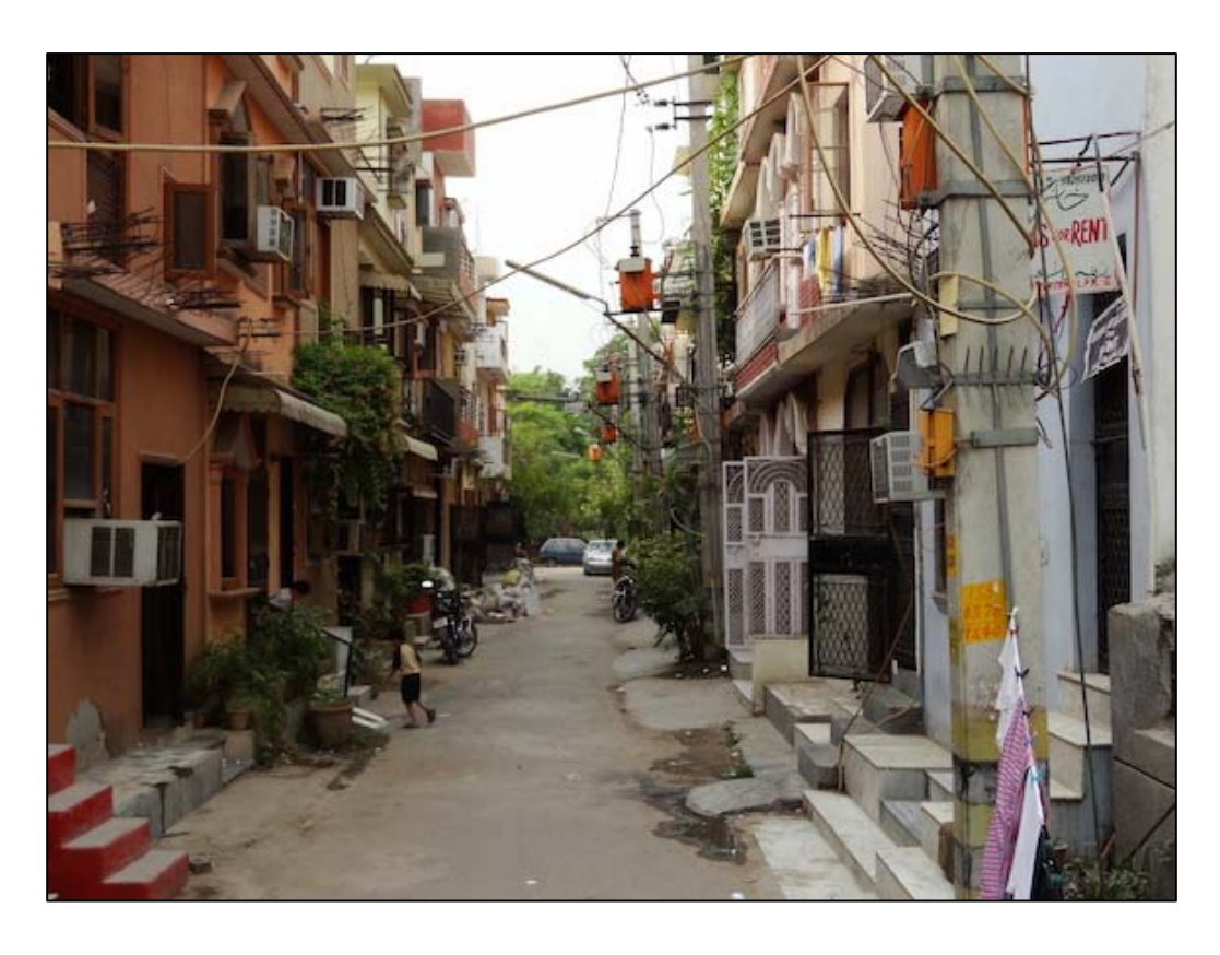
Figure 9: Rental Properties in Kasturba Niketan

An empty street in Kasturba Niketan (Lajpat Nagar) with a "for rent" sign in English, Dari, and Arabic.