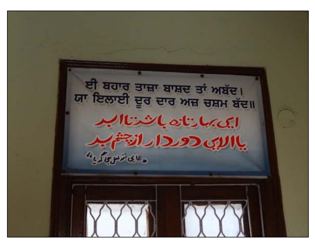
Figure 2: Persian Verse above Khalsa Diwan Main Office Door

Written by Nandlal Goya, a 17<sup>th</sup> century Afghan Sikh scholar, the verse has been printed in Persian and Gurmukhi transliteration and reads: "May spring stay fresh eternally/ O God, far away from the evil eye."