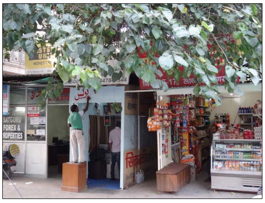
Figure 8: Sign Painting in Lajpat Nagar

An artist paints a sign in Persian from left to right.