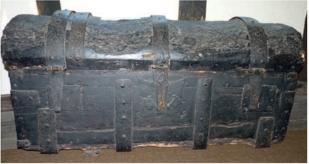
7 Fordwich chest (Type C). The author