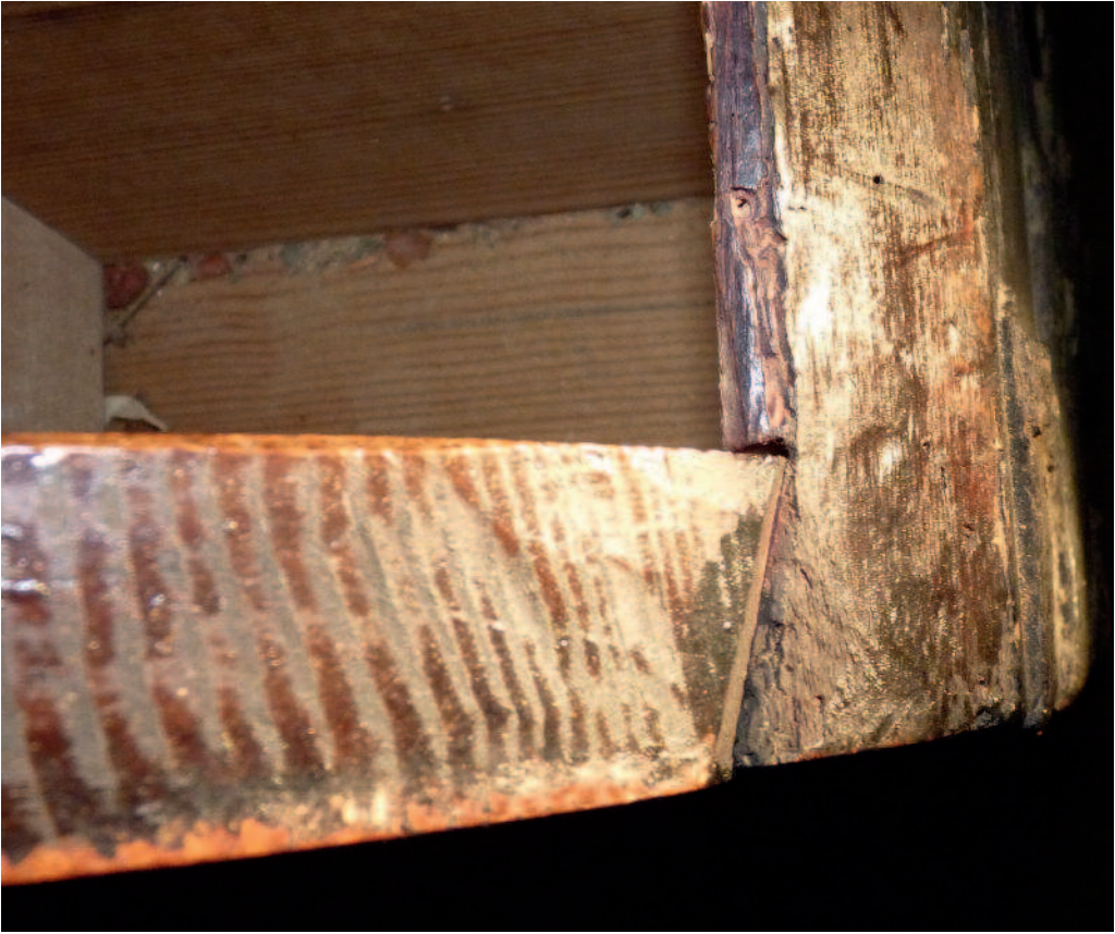
3 Pegged splayed rabbet joint, Fordwich chest. The author

The domed chest is made of a pine box and a lid made from a hollowed out section of trunk from a relatively soft, light and non-durable hardwood, a combination that has the advantage of lightness and lower cost relative to oak. The lid is highly prone to erosion. The walls are 3–4 cm thick. The sides of the box meet the front and back in a distinctive pegged splayed rebate joint (Figure 3). The top edges of the front and back are chamfered to fit the sloping inside of the lid. The bottom is probably rebated into the front and back (it is usually hard to see this joint) but appears butt-jointed at the sides where it is visible. In cross section, the lid is thickest at the apex (8–12 cm) and thins to the front and back. The inside of the lid is smoothly finished and has a splayed rebate of about 6 cm allowing a neat fit over the four walls; it projects at each end by about 2 cm. The close fit no doubt contributes to the frequently clean, fresh appearance of the pine inside. The lid has a number of iron bands and is hinged to the box. These bands are typically around 6 cm wide. Where the lid also has horizontal bands, the vertical bands are imposed upon them, not interlaced. The box ends have one or more vertical iron bands with one or two staples through which suspension rings or triangles were fixed to which ropes or iron rods were attached to allow the chest to be carried