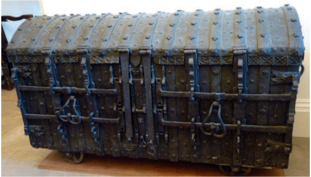
4 Sidney Sussex College, Cambridge, wheeled, armoured chest (Type A).