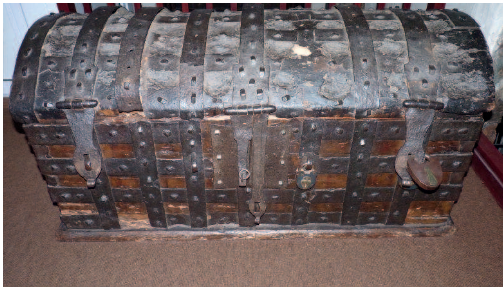
6 Canterbury Heritage Museum chest (Type B). The author

TYPE A This consists of completely armoured chests. These vary greatly in quality. Examples of high quality chests sheathed in iron and with wheels exist at the Gruuthuse Museum, Bruges, 42 and Sidney Sussex College and St John's College Cambridge (Figures 4 and 5). The Sidney Sussex College chest may represent the highest quality since as well as being wheeled and armoured, it has a highly complex and decorative locking arrangement with four locking bars. In Kent the two completely armoured chests, at Ash (Figure 1) and Sandwich, are of lower quality.