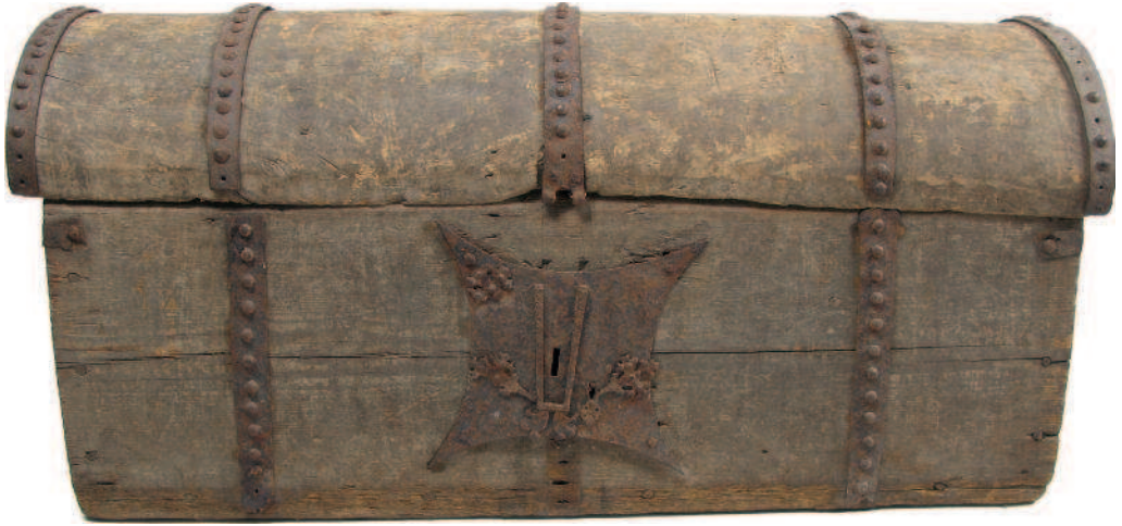
12 (above) Skrukeby chest, front view. Reproduced by permission of the Nordiska Museum, Stockholm