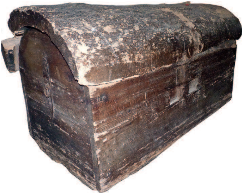
8 Lower Halstow chest (Type D). The author