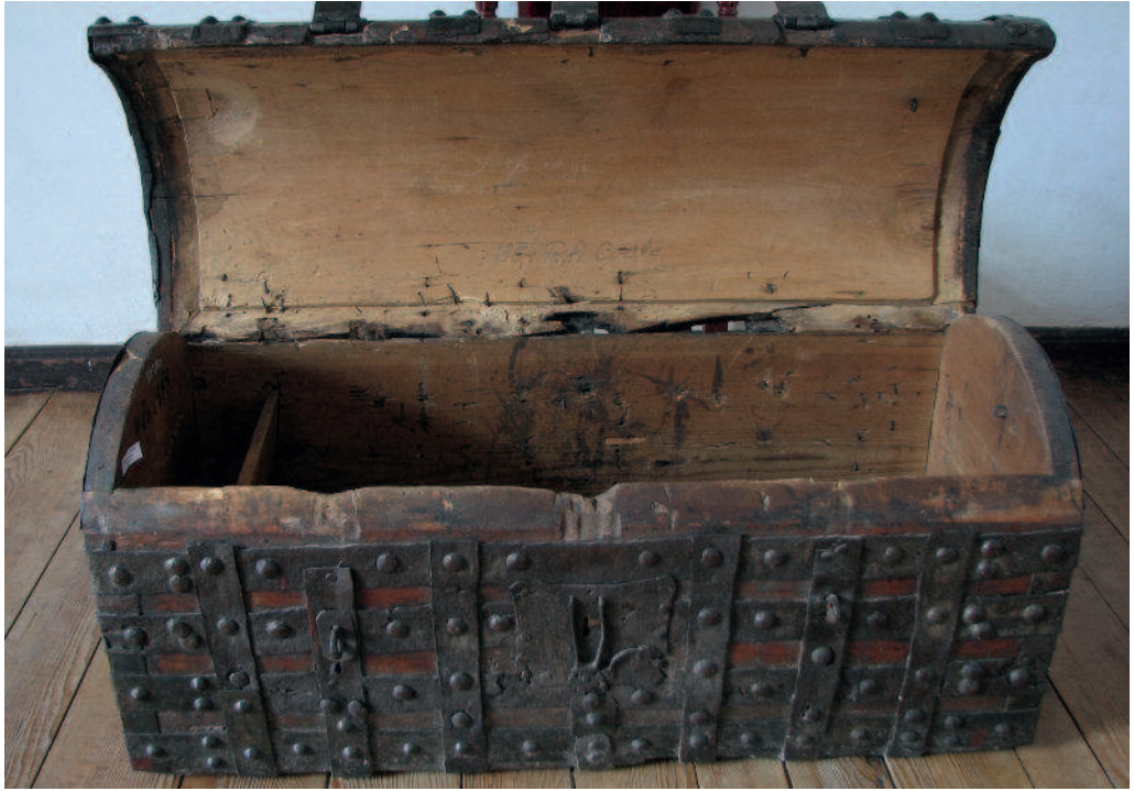
17 Kwidzyn chest.

reinforce the idea that the Skrukeby chest was imported to Sweden and that Sweden is not the source of these chests (or at least not the sole source.) However, such arguments rest on assumptions about how far the distribution of the surviving chests is representative of that of the original chests.