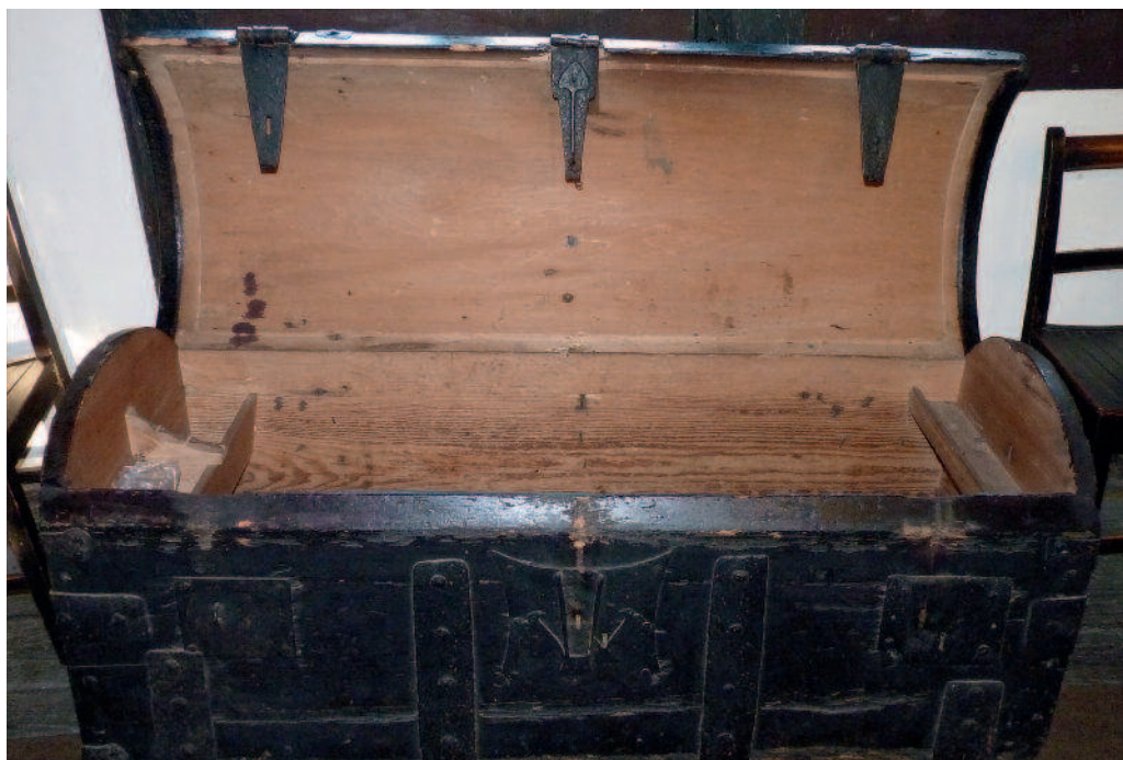
11 Fordwich chest, internal view. The author

Unfortunately, the earlier argument about the absence of pine outside Scotland does not apply to lime. Lime was grown in England and Salzman records it as being used in the thirteenth and fourteenth centuries for tables, benches, dressers, stalls, doors and scaffolding, though he says it is 'of rare occurrence'. 49 Lime was also imported and Childs reports lime boards being imported to Hull from Danzig in the fifteenth century. 50 However, she does not record lime trunks being imported, which would be necessary if the dug-out lids were made in England. The fact of lime board exports may indicate that lime had low value in the area within reach of Danzig and is thus consistent with its being used there to make dug-out lids. Thus not only is there no English tradition of making chests with dug-out lids on top of boarded boxes, but there is no evidence of lime being used for dug-out lids in England; however, its availability does not rule this out absolutely.