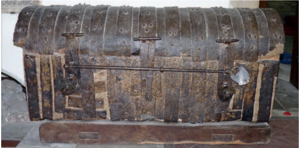
1 Ash armoured chest (Type A). The author

(yew)). 6 These were a small proportion of the 155 church chests illustrated in the book. The Dictionary of English Furniture omitted any reference to domed chests in its chapter on chests but Cescinsky and Gribble described the domed chests at Groton and Chelsworth in Suffolk as of poplar and dated them to the late fourteenth century. 7 Roe used the term ‘barrel-lidded’ in discussing the Harbledown and Minster (Kent) and Framlingham (Suffolk) chests. 8 In his survey of the Home Counties, Roe noted that ‘round-topped’ chests were ‘not very scarce’ and described those in the Pyx Chapel, Baldock, Cheshunt and Kings Langley (Hertfordshire), and Little Bentley and Hadleigh (Suffolk). 9 In other works he described domed chests in Ingatestone (Essex), Debenham and Framlingham (Suffolk), and St Swithin’s (Worcester), and says that ‘there are plenty remaining’ and that ‘the probability is that the greater number of them belong to a period not earlier than the sixteenth century’. 10 The individual dates he gives them are mostly in the range 1500–1550.