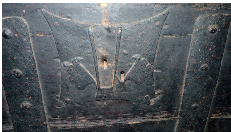
19 Fordwich chest, lock plate. The author

deeply concave sided with flaring key guides with leaf decoration (Figures 18 and 19). 69 The Harbledown lock plate has a slider with an acorn finial that has to be released to allow the key to be inserted; the Fordwich lock plate has no slider. 70