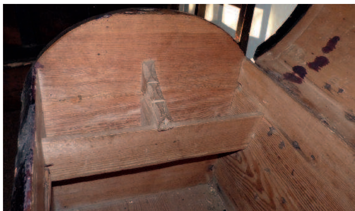
15 Fordwich chest, internal view, left hand side showing divided till. The author