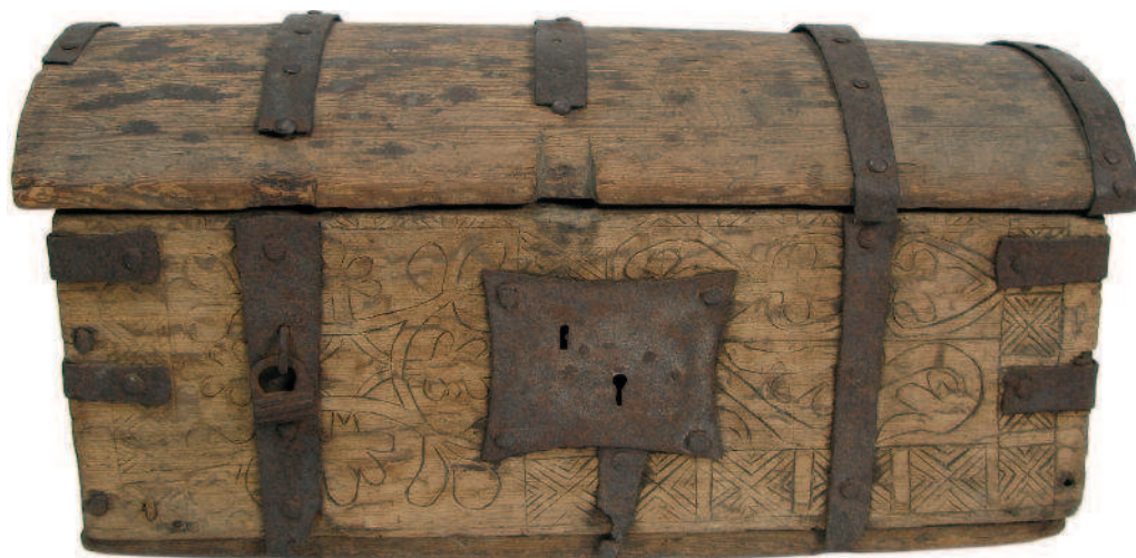
16 Swedish chest (slightly domed with carving, to show a close relative).

chest (Figures 7, 11 and 15). 55 This provides an intriguing link. Given the westward direction of medieval timber flows, it supports the idea that both chests are products of the eastern Baltic. 56 In this connection, it should be noted that the Skrukeby chest is the only plain chest among a set of chests at the Nordiska Museum with shallow domed or flat lids and all-over chip, foliate or scroll carving. 57 Figure 16 illustrates one of these. Such carved decoration does not have parallels in Germany that I am aware of and one might conclude that they represent a Swedish type. If so, this would