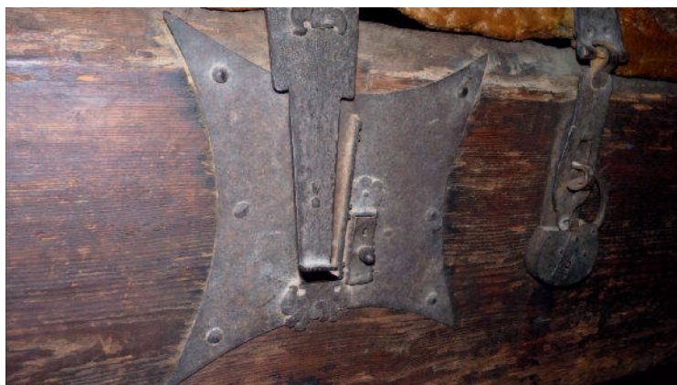
18 Harbledown chest, lock plate. The author