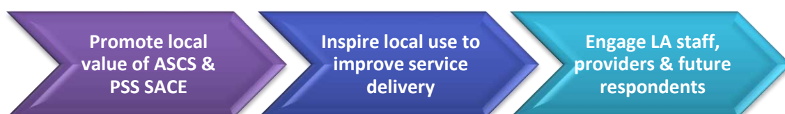
Figure 5: Key functions of reporting: encouraging engagement with and use of ASCS and PSS SACE data

The reporting of ASCS and PSS SACE data is an important stage in the survey and dissemination processes, and reports circulated both within and beyond the LA (e.g. to potential consumers, such as managers, commissioners and providers, or to both previous and future survey respondents) have the potential to fulfil a number of functions beyond the communication of key findings. An internal report to decision-makers within the organisation (e.g. managers and commissioners), for example, can present a range of findings, including the results of analysis of unmet need. Such analysis can potentially highlight possible causes and/or actions and, as a consequence, may help to enhance operational management and, in turn, inform the delivery of adult social care services. An external report, on the other hand, can demonstrate how survey data can be used to produce specific and desirable changes to the way the local care system operates (e.g. changes in services) and, by doing so, simultaneously justify and motivate previous and future participation. These functions are summarised in Figure 5 below, and indicate that reporting also has the potential to alleviate barriers and time/resource burdens at other stages of the survey process: the increased use of ASCS and PSS SACE data among LA decision-makers, for example, can reduce the need for further local research and will be addressed in the developing toolkits.