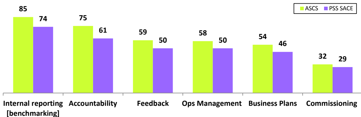
Figure 6: Local authority (LA) use of ASCS and PSS SACE data for local purposes [N = 100 LA staff from 83 LAs]

The responses to the MAX online survey (see Figure 6 below) show that the data from the ASCS and PSS SACE are used for a range of local purposes, most commonly for reporting, being shared with LA colleagues through internal reporting mechanisms or with the public through accountability and feedback mechanisms. However, survey data are used much less often for activities that result in changes to the planning and/or delivery of adult social care services, with approximately half or less of the online survey respondents stating that their organisations used the data to improve operational management , to feed into business plans , such as Joint Strategic Needs Assessments, or to inform commissioning.