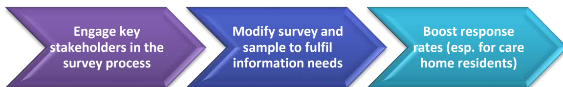
Figure 3: The importance of engagement during the administration phase

However, evidence collected from the MAX online survey indicated that the ASCS and PSS SACE were considered to be a significant resource to undertake and often place additional strain on already limited time and resources capacities. Respondents cited many examples of how the administration of the surveys can be time-consuming, including the organisation of the mental capacity checks, the administrative tasks associated with data collection (e.g. sending out reminder letters, checking postal addresses), the data-cleaning exercise, and the compiling of results onto spreadsheets as part of the annual data returns. 8 Such activities have the potential to serve as a barrier to maximising the value of ASCS and PSS SACE data, but a number of local practices have been identified to help the administrative process, as follows.