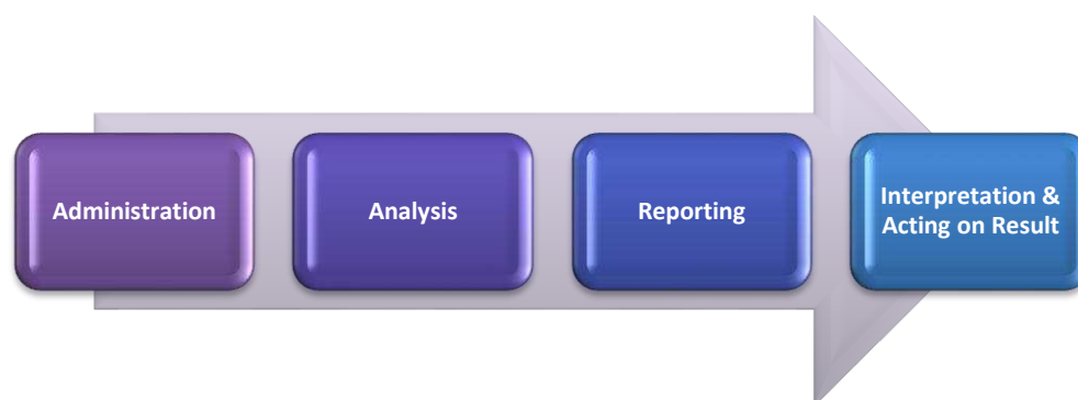
Figure 1: stages of the survey process