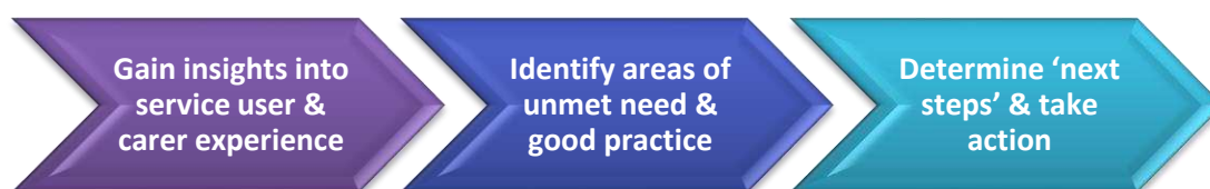
Figure 7: Potential importance of interpreting ASCS and PSS SACE data