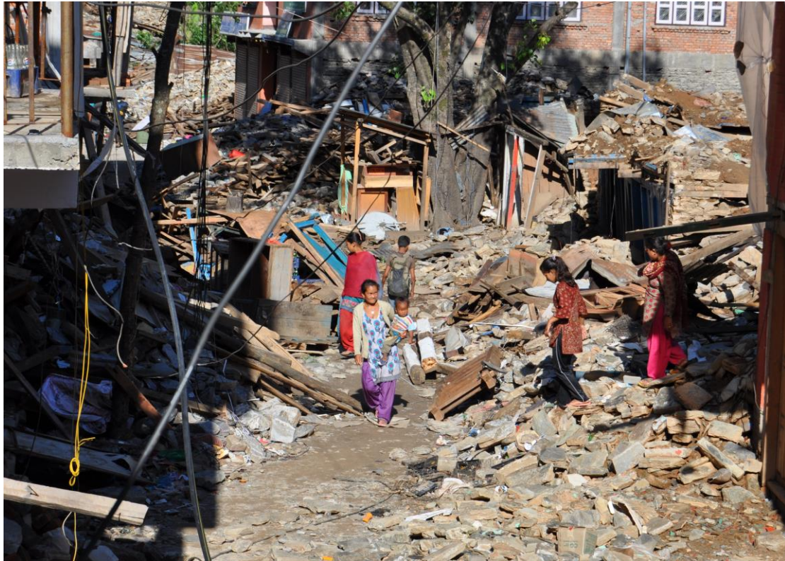
An earthquake-damaged street in Singati, Dolakha District.

Photo credit: Deborah Underdown, June 2015