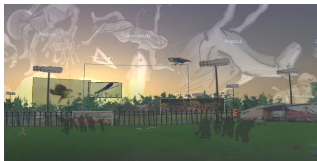
Figure 4. The Stellarium landscape for the Conflict zone memory point. The conflict is also enhanced through the sharp black gates. Note the inclusion of the yellow breast-ed robin and blue dragon fly, as well as the intrusion of a building site. Here an alignment square indicates the rising of the constellation Fishes linking this part of the landscape to water.

Photographic panoramas were taken at two sites. The first site was in the courtyard outside the ERD complex. In the foreground to the northeast is a small roundabout with a sculpture of an atom. In the centre of the roundabout is a small memorial stone to university alumni. Fruit trees grow in the roundabout which members of staff use to harvest cherries, also blackbirds and crows visit them in the spring and summer. This link was highlighted through alignment squares in the landscape through which the constellation of the crow rises. Its star myth (Staal, 1988 : 160) reflects the use of this part of the landscape. Visible to the east is the mammoth sculpture. Gravel extraction near the Clifton Campus revealed that in prehistoric times, mammoths wandered this site. The temporality was captured subtly within this site in the form of the memorial stone in the centre of the roundabout, cows seemingly wandering the site, and the mammoth sculpture to the southeast. These served to indicate deeper history.