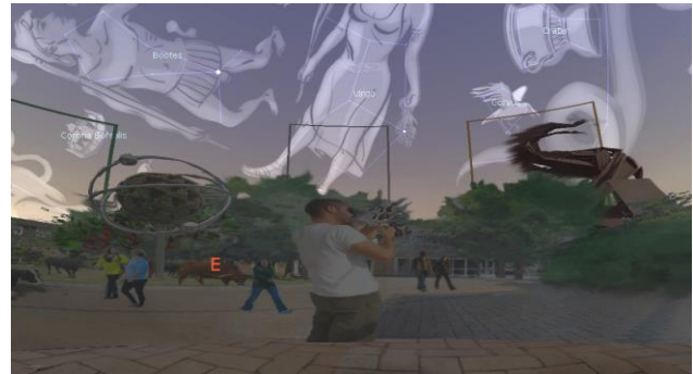
Figure 3. The Stellarium landscape for the ERD memory point. Note the additions of people, cows and the enhancement of the Mammoth and Atom sculpture, frequently referred to structures. The squares indicate intended alignments with relevant constellations such as the Crow over the cherry trees but also the Bull as a link to the initial pasture character of the site.

Furthermore, the results can only give a relative distribution of light pollution since the survey was carried out while no actual astronomical twilight was achieved during the night.