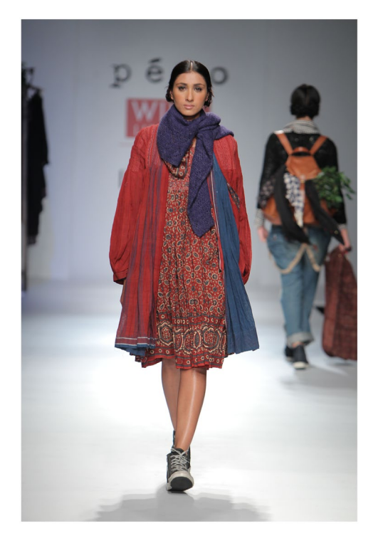
FIG. 6. Ajrakh-print dress, Péro Autumn/ Winter Collection, 2011. Image courtesy of Aneeth Arora. © Péro.

Péro participates in Indian Fashion Week at New Delhi and Mumbai, and in that sense it is part of the global fashion cycle, but the label is underpinned by Arora's desire to produce sustainable fashion and to work with regional craft producers. Her distinctive, hand-crafted clothes are defined less by prevailing trends and more by an enduring aesthetic that draws