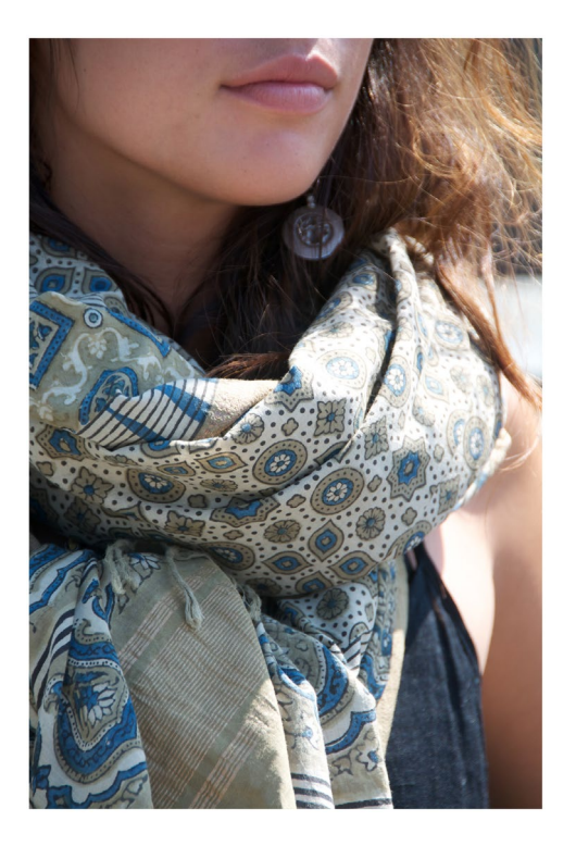
Fig. 9. 'Slow clothes' at Maiwa: ajrakh-print scarf, 2014.

Maiwa, conscious of the often negative social, environmental and economic legacy of the global fashion system, is an advocate of the 'slow clothes' movement, and both its fashion line and soft furnishings range feature the use of organic fabrics and natural dyes (Fig. 9).<sup>28</sup> The company also runs a tailoring unit in Bagru, Rajasthan, the organisation of which