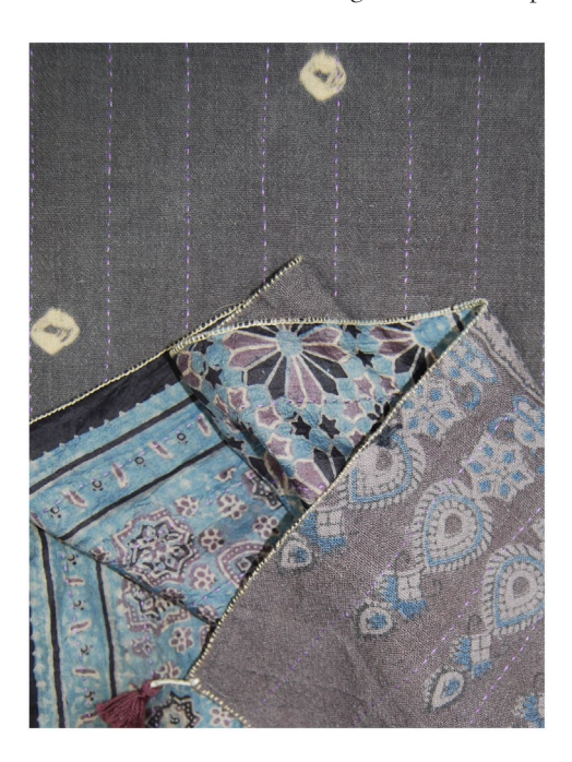
FIG. 10. Detail of double-faced Maiwa Handprints stole: one side is silk, the other wool with block-printed decoration by Sufiyan Khatri and tie-dye by his brother-in-law, Junera Khatri, 2013. Dyed with natural colours. The author's private collection.

in former times things were mostly multi-coloured; in one piece you would see blue, red, yellow, green, all these [colours]. When yellow colour was dyed, there might be many blotches but you couldn't see them because of the multi-coloured design. Now people want clean fabric without blotches ... Foreigners like clean pieces.<sup>36</sup>