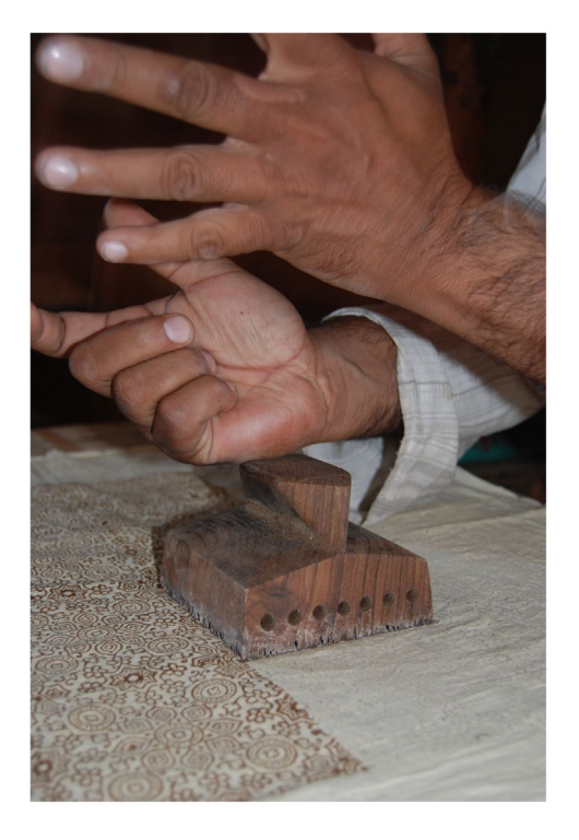
Fig. 3. Abduljabbar M. Khatri printing a resist of lime and gum, Dhamadka, Kachchh, 2013.

(Fig. 3).<sup>4</sup> There are several different forms and sizes of ajrakh , but the most acclaimed is a double-faced textile, printed on both sides of the fabric, dyed using madder and indigo, and known as minakari .<sup>5</sup> The depth of colour and the perfect alignment of the printed designs — tested by holding the finished cloth up to the sun, thus revealing any mistakes, requires the utmost skill on the part of the artisan.