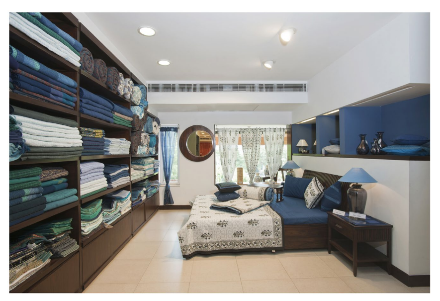
FIG. 11. Fabindia home store at Khan Market, New Delhi, 2014.

Fabindia, Abduljabbar M. Khatri's largest client, espouses a similar ethos to Maiwa Handprints, but it has followed a very different business model; the global reach of its retail sector now extends to 176 cities across six countries and there is also an online store (Fig. 11). 40 Established in 1960 by American John Bissell, the company has been led by his son