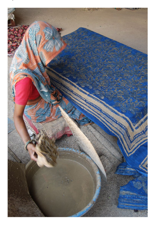
FIG. 2. Female worker printing dabu mud resist, Bagru, Rajasthan, 2012.