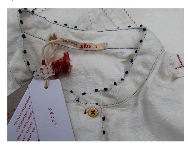
FIG. 7. Detail of hand-stitched and embellished seams on Péro kameez (shirt), 2014. The author's private collection.

on India's rich heritage of handlooms, block prints, tie-dyes and embroideries; not only are the fabrics made by hand, the hems, seams and other finishing details are hand-stitched, too (Fig. 7). In an interview in 2011, Arora discussed her approach to crafting fashion and how she has worked with ajrakh in particular. Aware of the potential impact of her label, she commented: 'I don't want to make it [Péro] so big that we have to dilute craft, so I would like to stick to numbers that I can do and be very loyal to the crafts and the craftspeople ... there's only so much that I would like to expand'. <sup>16</sup>