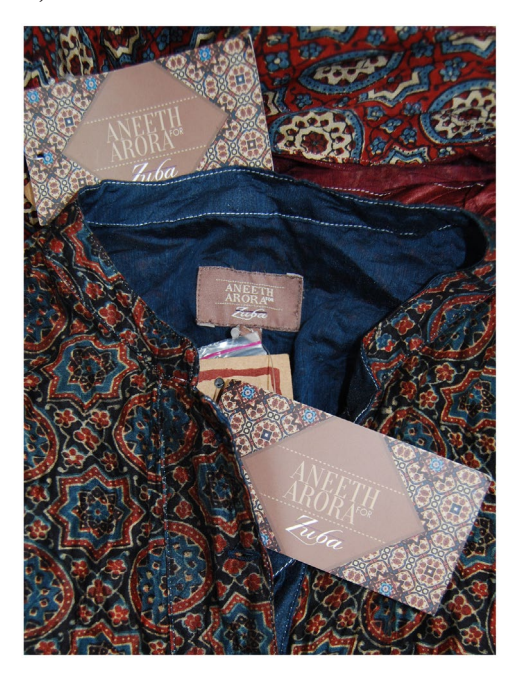
Fig. 8. 'Aneeth Arora for Zuba', 2014: tunic featuring ajrakh dyed with natural colours. The author's private collection.

... I told them to keep the numbers small but do block print because if you're saying 'Péro for Westside' then I want you to stick to him please.<sup>24</sup>