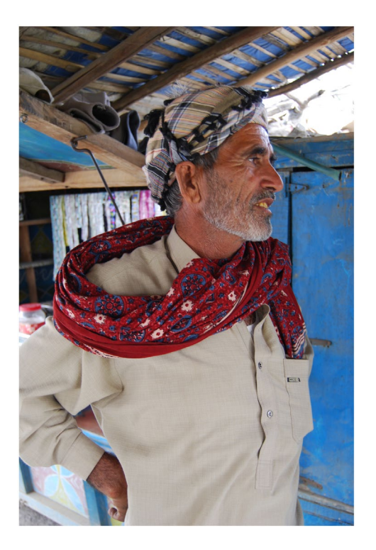
Fig. 1. Maldhari (animal herder) wearing ajrakh shoulder cloth, Kachchh, Gujarat, 2010.

in rural areas, it has simultaneously exposed other issues that ultimately threaten the sustainability of the craft; these problems will be discussed and strategies designed to address them outlined. In a final section, the article analyses the factors that have made ajrakh an object valued as 'cultural heritage', conserved in museums and private collections, as well as a successful commodity that has enjoyed an upward trajectory over the past forty years.