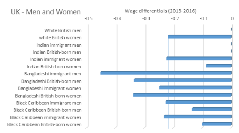
Figure 2: Racial and gender wage differentials in the UK (2013-2016)

Source: Author’s calculation using UK Labour Force Survey 2013 (first quarter)-2016 (second quarter).