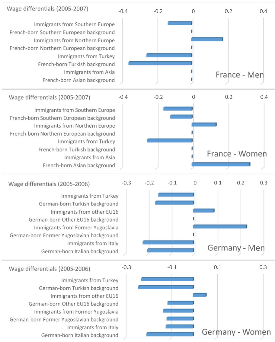
Figure 1: Racial and gender wage differentials in France and Germany