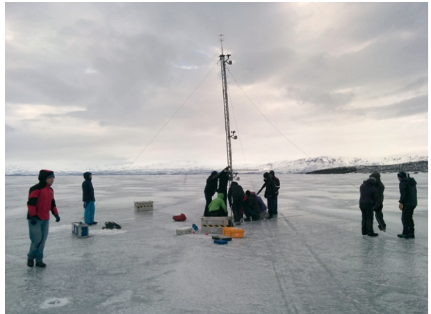
FIG. 1. Students helping to erect a mast on Lake Torneträsk.

The school was held at the Abisko Scientific Research Station ( http://polar.se/en/abisko-naturvetenskapliga-station/ ) in northern Sweden—an appropriately Arctic environment. It brought together 29 Ph.D. students and early-career researchers from 16 countries for 9 days of lectures and practical exercises on the