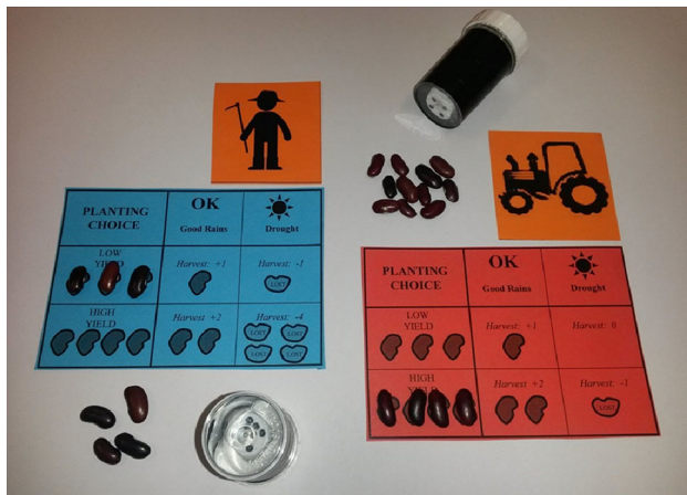
Fig. 2 CAULDRON gameplay materials: Country allocation cards (farmer for developing, tractor for developed), farming matrices determining planting gains and losses ( blue for developing, red for developed), beans used for planting, and rainmakers

rolling a six is one often used in PEA science. It demonstrates that although the probability of getting a six may have been increased by climate change, a six could have been rolled anyway.