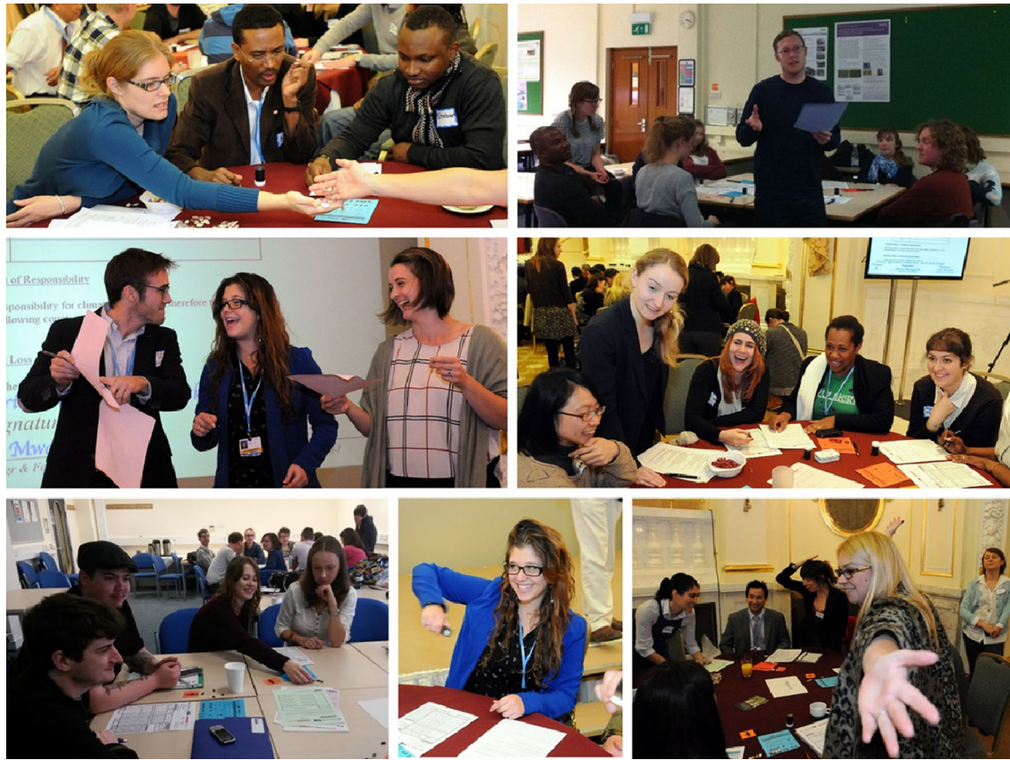
Fig. 3 CAULDRON sessions in action. Clockwise from top left: a exchanging beans during farming, b a spokesperson reading out his region’s negotiated text, c discussions during play, d the shock of drought during farming, e shaking a rainmaker, f planting beans